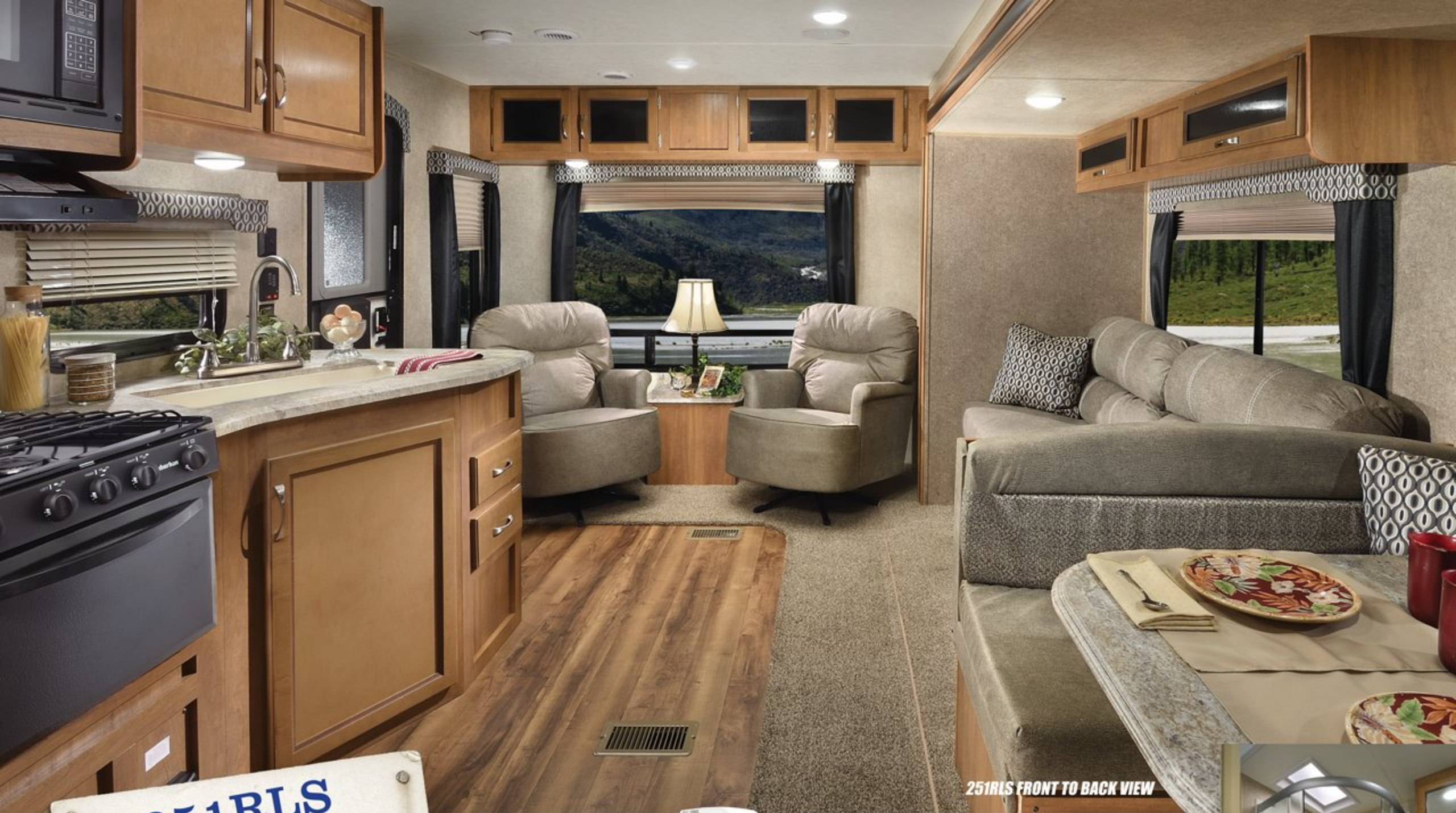
251RLS FRONT TO BACK VIEW