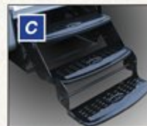
RADIUS TRIPLE ENTRY STEP (DOUBLE NON SLIDE MODELS)