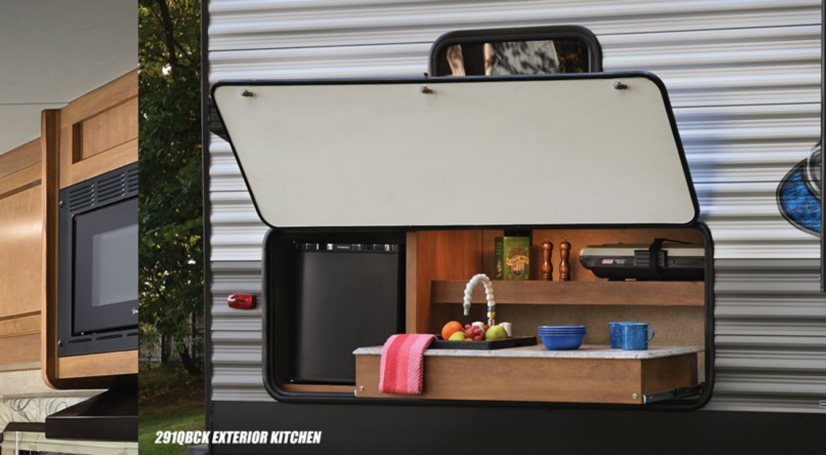
291QBCK EXTERIOR KITCHEN