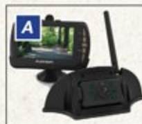
WIRELESS REAR VISION CAMERA PREP (CAMERA NOT INCLUDED)

At Catalina we are proud of the quality that Coachmen has proven for over 52 years. We are committed and excited about continuing that superior level of construction and quality that Coachmen Catalina stands for. We achieve this not only through the use of quality materials, but through our skilled teams that care, focus, and contribute in all stages of our manufacturing process.