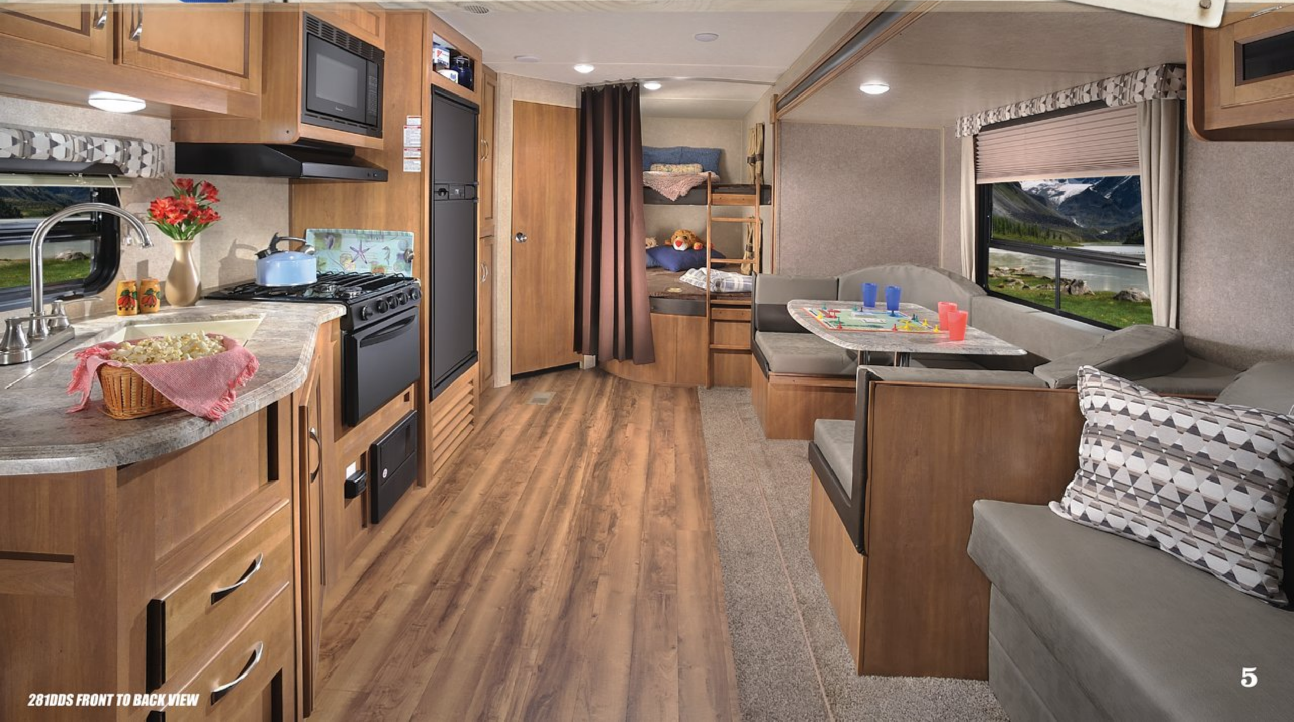
281DDS FRONT TO BACK VIEW