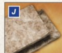
FULL 6 SIDED R-7 ECO-BATT INSULATION. THIS IS A NEW AND SUSTAINABLE TECHNOLOGY