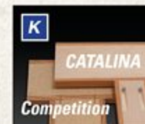
REAL WOOD CABINET STILES THAT ARE SCREWED AND GLUED NOT STAPLED PARTICLE BOARD LIKE THE COMPETITION.