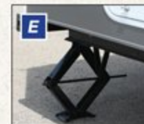
FOUR (4) STABILIZER JACKS STANDARD ON ALL MODELS (MOST COMPETITORS OFFER THIS AS AN OPTION NOT A STANDARD)