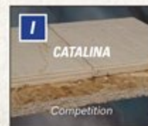
5/8" TONGUE IN GROOVE PLYWOOD DECKING GLUED AND STAPLED TO THE FLOOR STUDS- NOT OSB