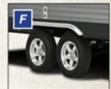
CATALINA'S EXCLUSIVE TIRE AND RIM PACKAGE INCLUDES: RADIAL TIRES, POLISHED ALUMINUM FENDER SKIRTS AND E-COAT MAINTENANCE FREE RIMS