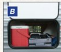
OVERSIZED EXTERIOR BAGGAGE DOOR