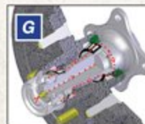
SUPERLUBE™ AXLES FOR FAST AND EASY LUBRICATION