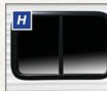
G20 RATED TINTED BLACK FRAMED WINDOWS WITH SAFETY GLASS