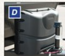
2-20 LB. PROPANE TANKS WITH BOTTLE COVER