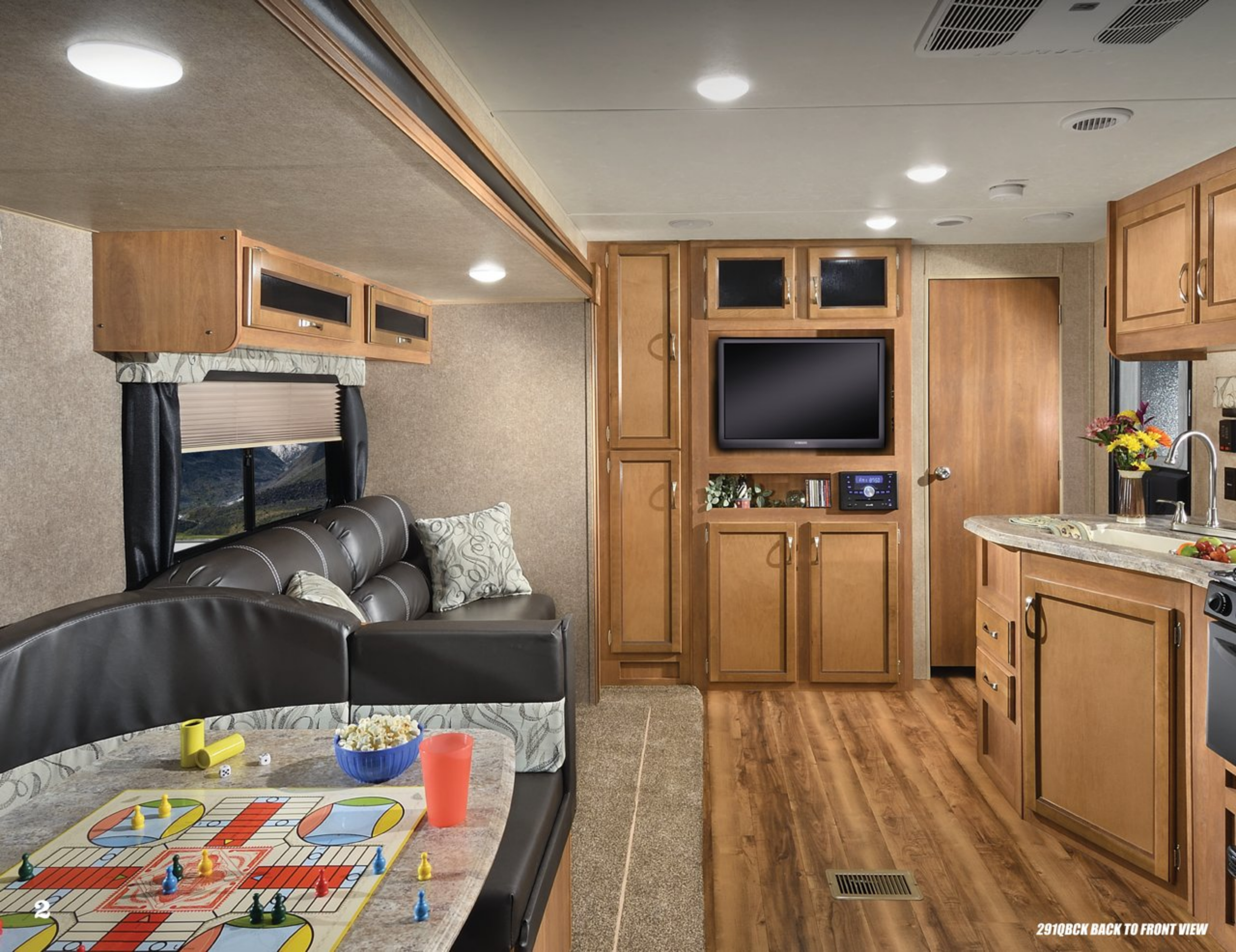
291QBCK BACK TO FRONT VIEW