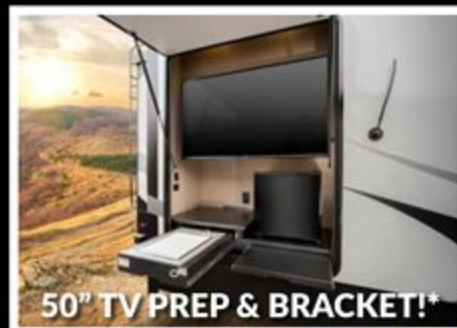
50" TV PREP & BRACKET!*