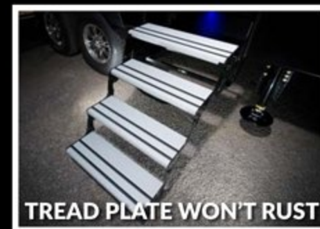
TREAD PLATE WON'T RUST ALUMI-TREAD® STEPS