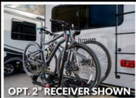
OPT. 2" RECEIVER SHOWN