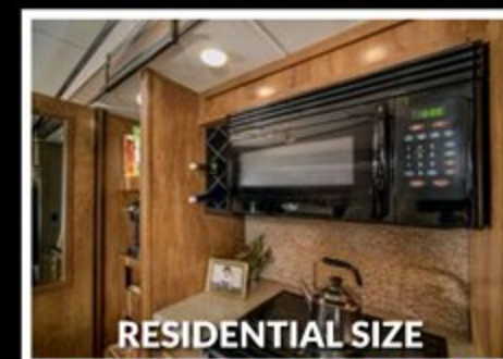
RESIDENTIAL SIZE 30" MICROWAVE (MIDS)