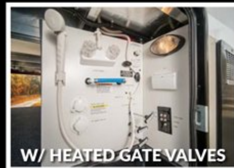
W/ HEATED GATE VALVES