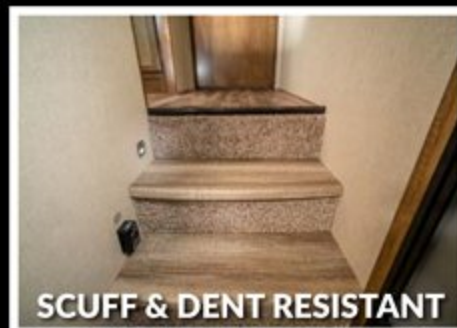
SCUFF & DENT RESISTANT