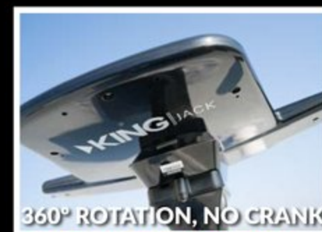
360° ROTATION, NO CRANK KING/JACK® ANTENNA