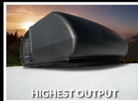
HIGHEST OUTPUT COLEMAN MACH AIR®