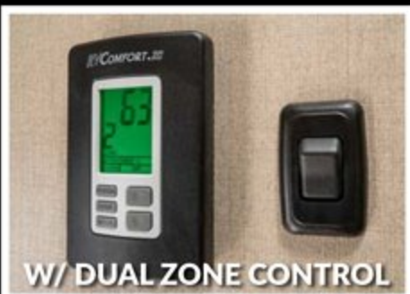
W/ DUAL ZONE CONTROL