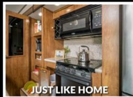
JUST LIKE HOME STORAGE & AMENITIES