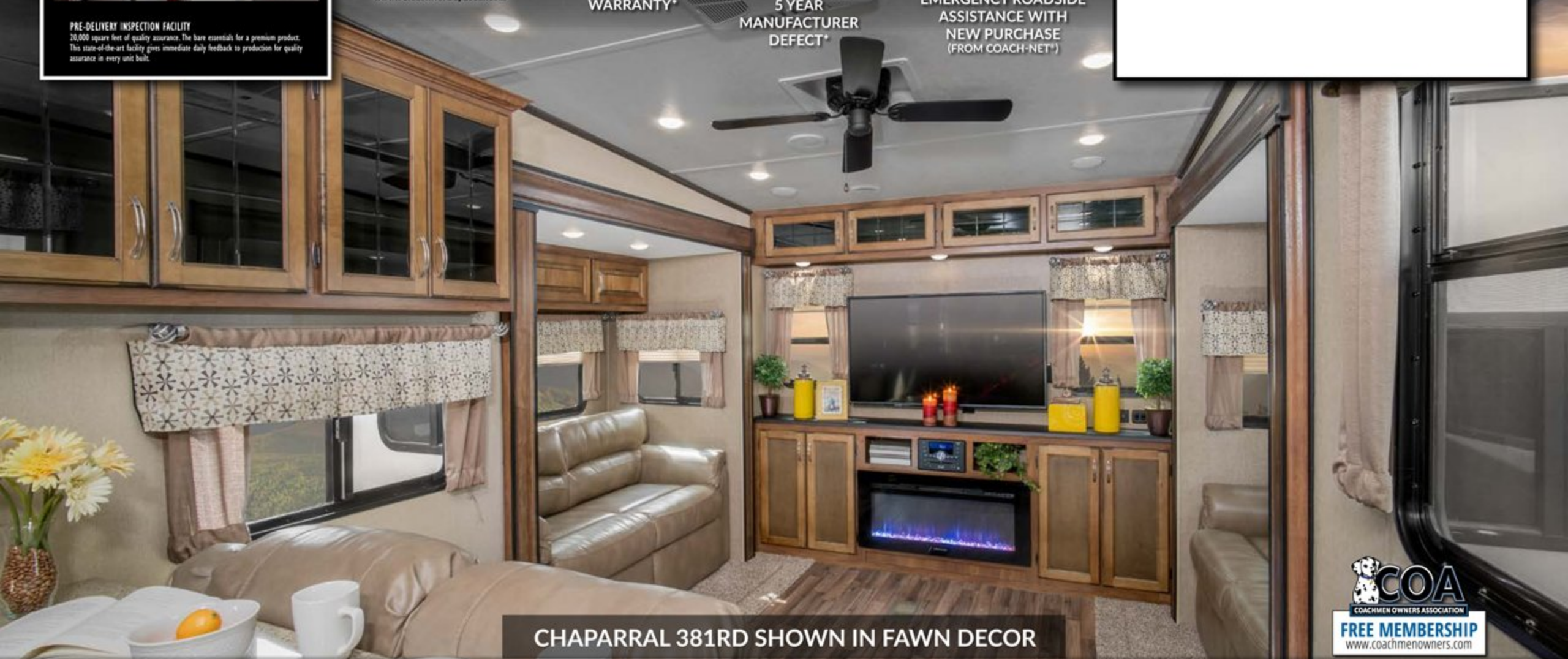
CHAPARRAL 381RD SHOWN IN FAWN DECOR