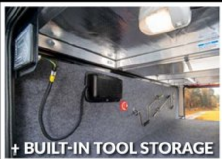
+ BUILT-IN TOOL STORAGE