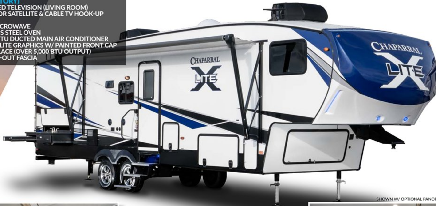
SHOWN W/ OPTIONAL PANORAMIC SECTIONAL SOFA