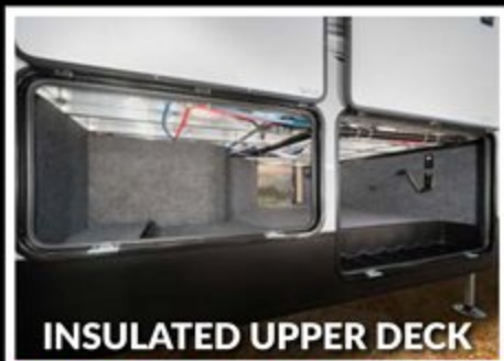
INSULATED UPPER DECK