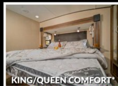
KING/QUEEN COMFORT* BLACK LABEL® PILLOW TOP