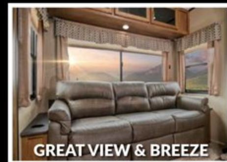
GREAT VIEW & BREEZE LARGER WINDOWS & SOFA*