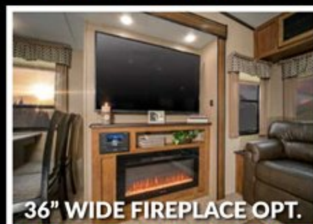
36" WIDE FIREPLACE OPT.