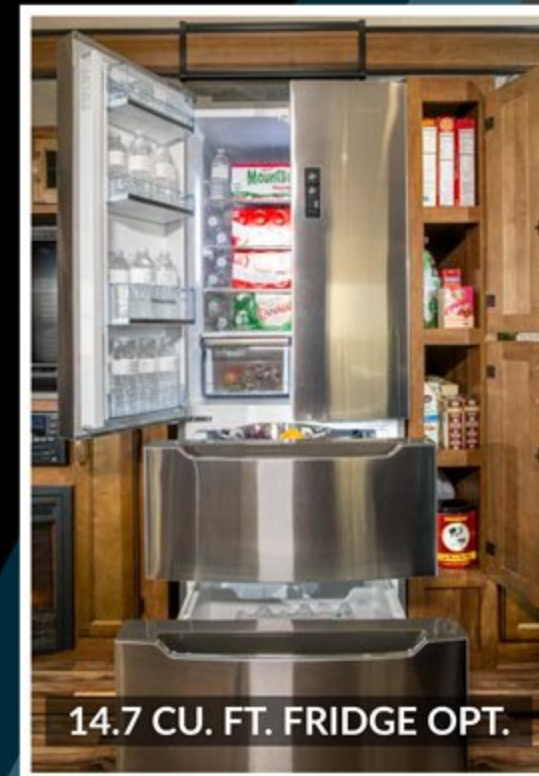
14.7 CU. FT. FRIDGE OPT.