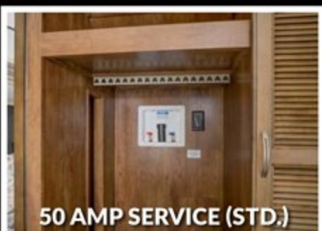
50 AMP SERVICE (STD.)