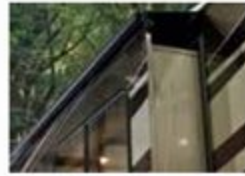
Slide room awnings (where applicable) to protect your slide room from debris.