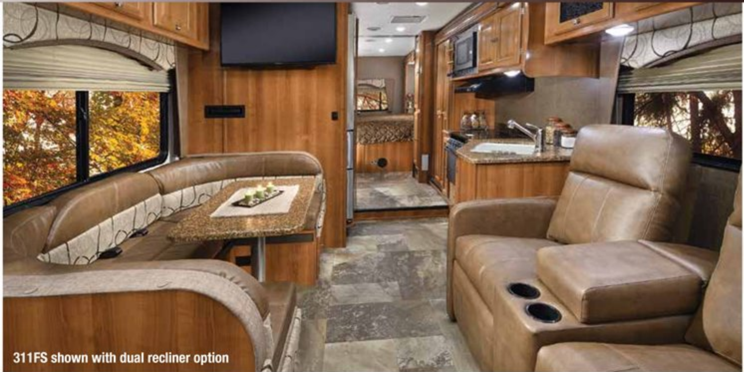
311FS shown with dual recliner option