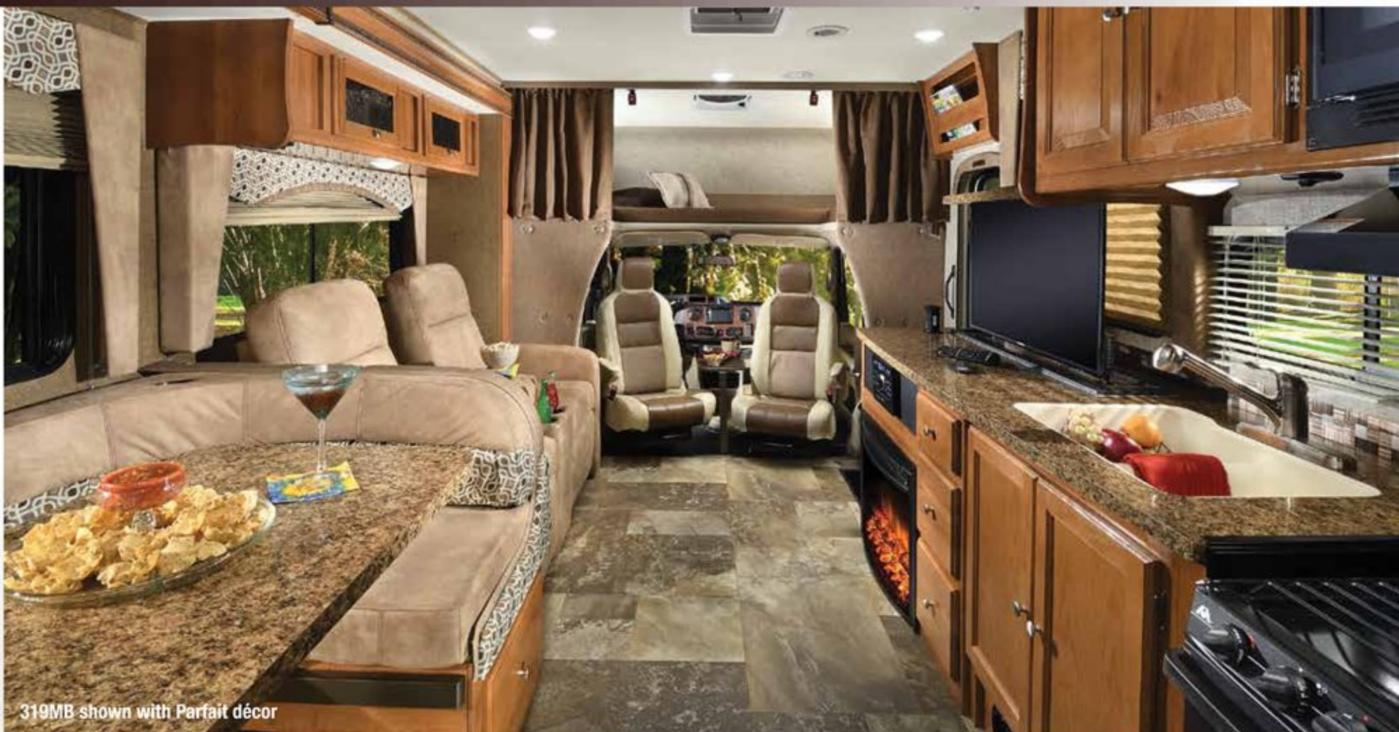
319MB shown with Parfait décor

At Coachmen, we pride ourselves in providing you with an RV that offers the most standard feature content on the market, allowing you to fully immerse yourself into any adventure!