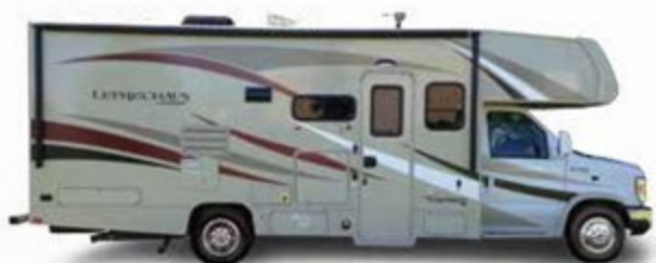
Color-infused Camel Fiberglass (Standard)