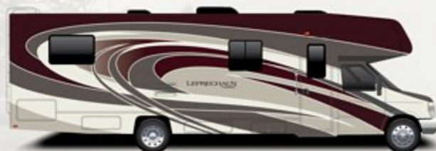
Cab Red Full Body Paint (optional)