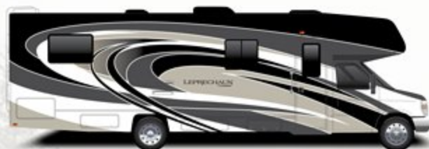
Onyx Black Full Body Paint (optional)