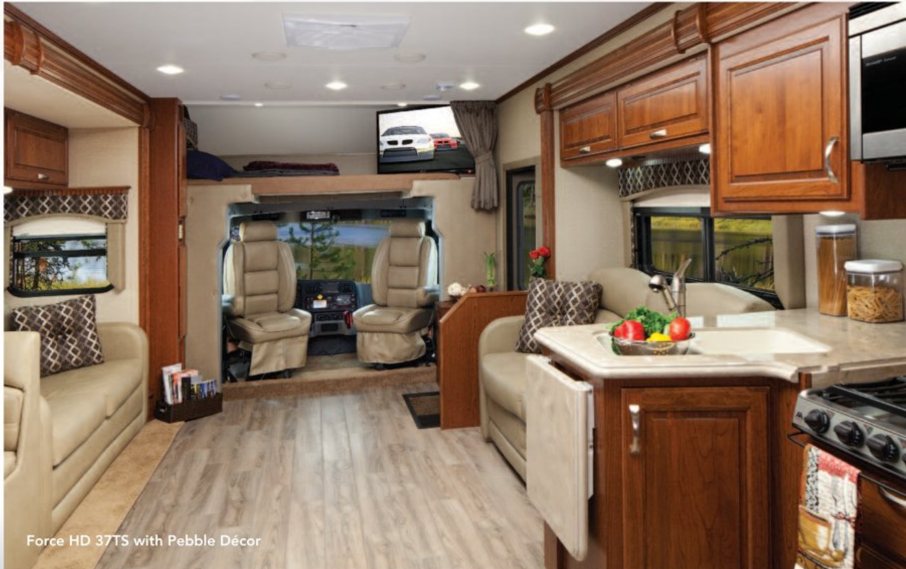
Force HD 37TS with Pebble Décor