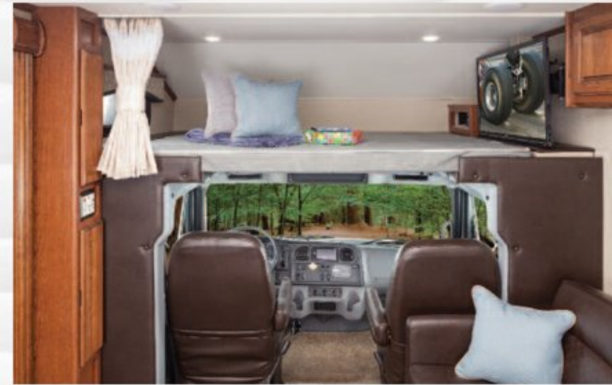
Versatile sleeping and entertainment features include this overcab bunk with a 39" LED TV on a Powered Swing Arm.