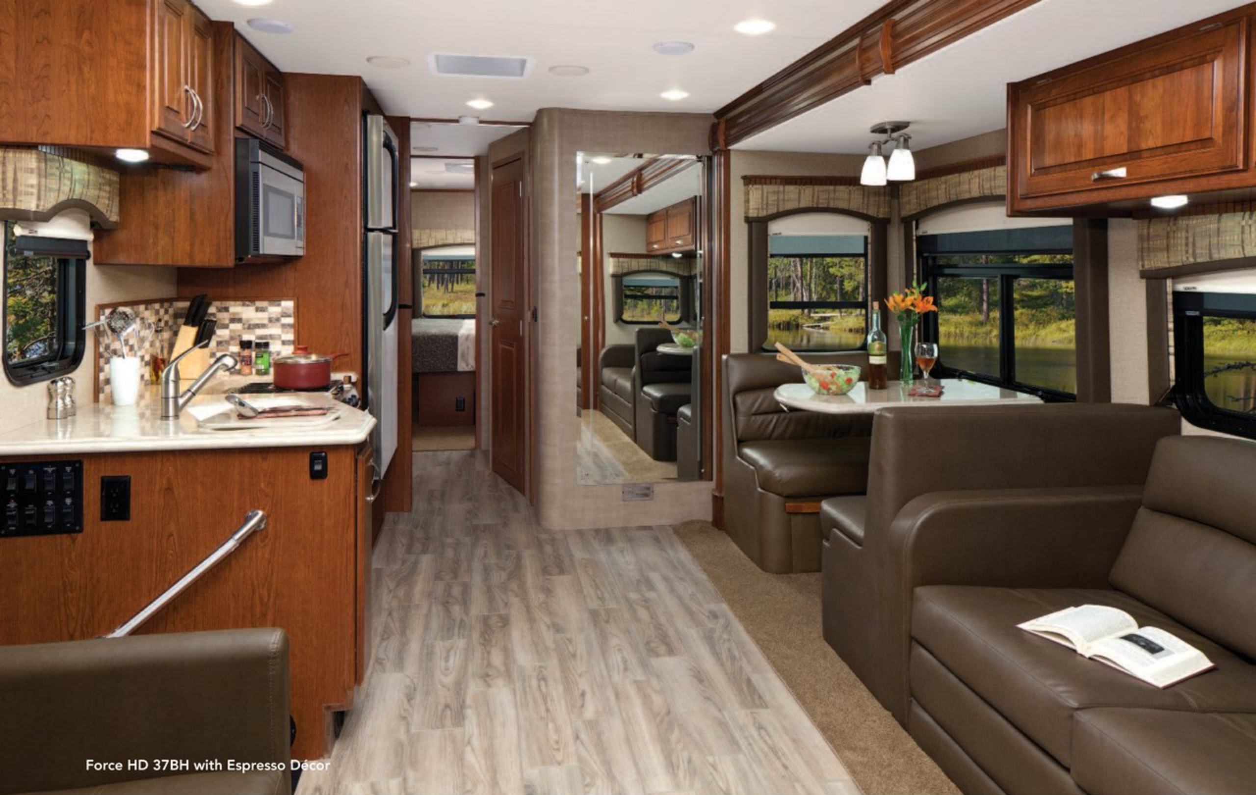
Force HD 37BH with Espresso Décor