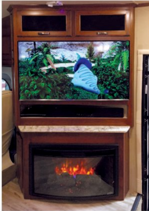
Optional 50" TV with Fireplace (37BH Only)