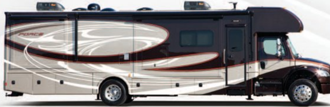
Driftwood (Force HD – Desert Mirage*)