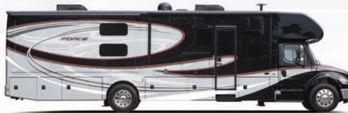
Billet (Force HD – Black Mirage*)

*Force HD includes enhanced full-body paint.