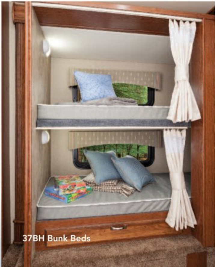
37BH Bunk Beds