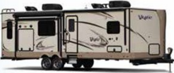
Optional Champagne Exterior