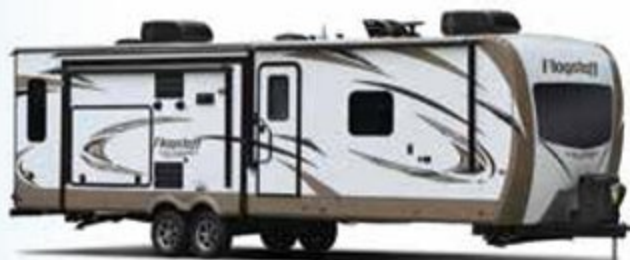
Standard White Exterior