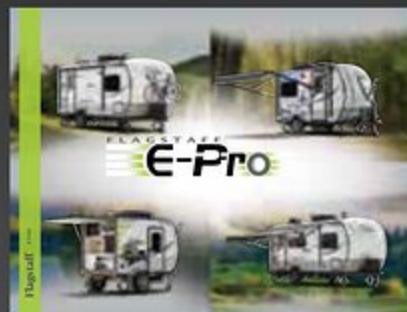
Flagstaff E-Pro Travel Trailers

LOOK FOR OUR OTHER POPULAR LINES OF FLAGSTAFF CAMPING TRAILERS.