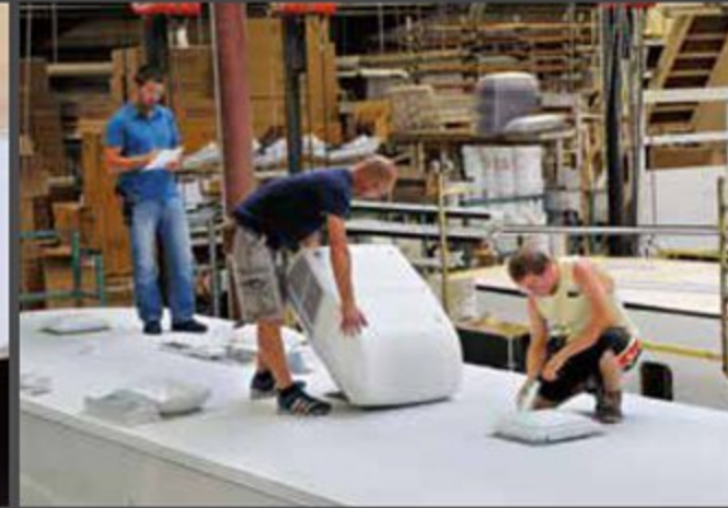
Built strong to enable you to conveniently perform periodic roof maintenance.