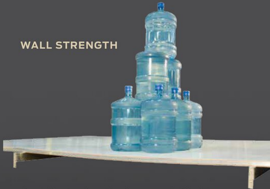
Structurally engineered materials makes our vacuum-bonded walls some of the strongest in the industry.