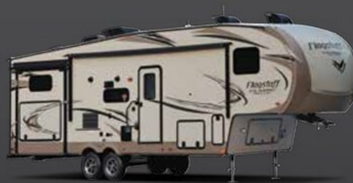
Optional Champagne Exterior

Featuring aluminum framing, vacuum bonded walls and roof, eye appealing exteriors and deluxe graphics, the Classic Super Lite and V-Lites are among the best constructed and most well insulated trailer available on the market today.