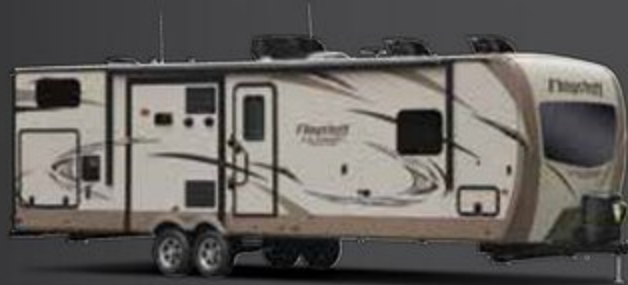
Optional Champagne Exterior

Featuring aluminum framing, vacuum bonded walls and roof, eye appealing exteriors and deluxe graphics, the Classic Super Lite and V-Lites are among the best constructed and most well insulated trailer available on the market today.