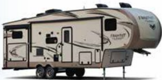
Optional Champagne Exterior