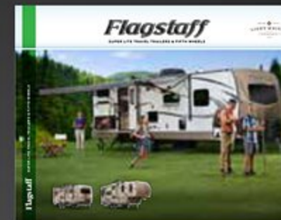
Flagstaff Super Lite Travel Trailers & Fifth Wheels