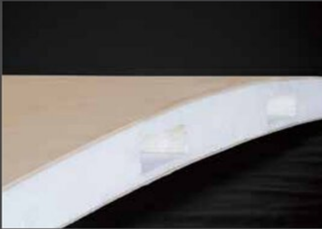
Vacuum-bonded radius roof with vaulted ceiling providing superior insulation and more interior height.