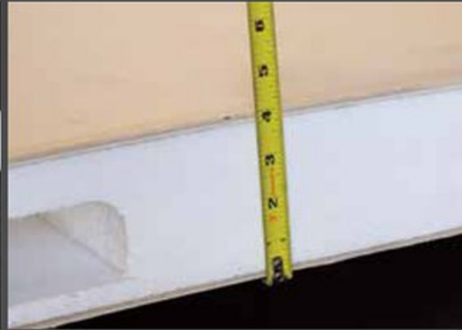
4" thick roof with built in insulated A/C ducts