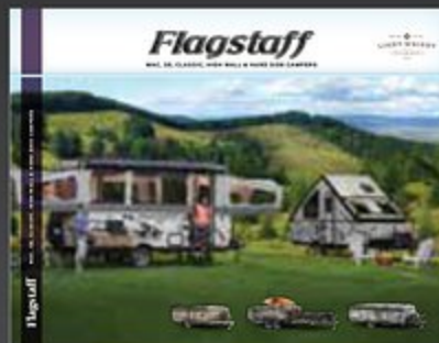
Flagstaff MAC, SE, Classic, High Wall & Hard Side Camping Trailers