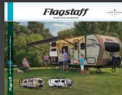
Flagstaff Micro Lite & Shamrock Side Camping Trailers