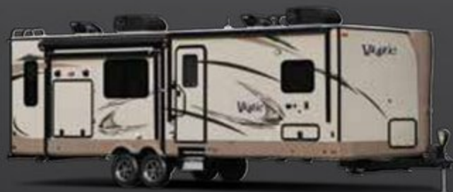
Optional Champagne Exterior