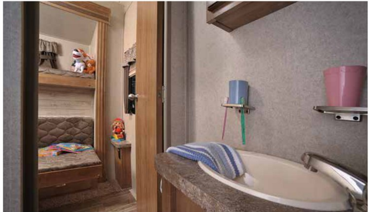
1/2 Bath in Bunkhouse on 8528BHOK