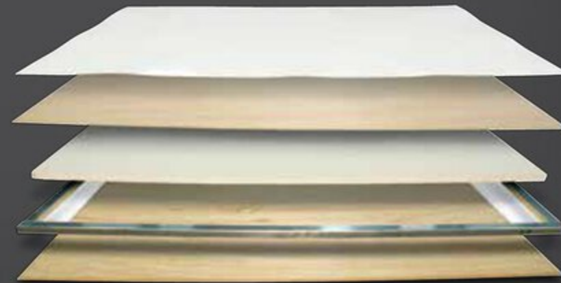
Flagstaff is one of only a few manufacturers with six sided aluminum framing. Vacuum bonded walls and roof to ensure a well-insulated, light weight, strong structural trailer.