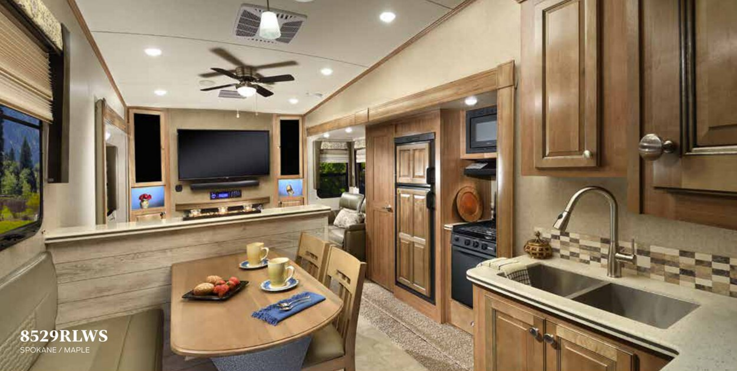
8529RLWS SPOKANE / MAPLE