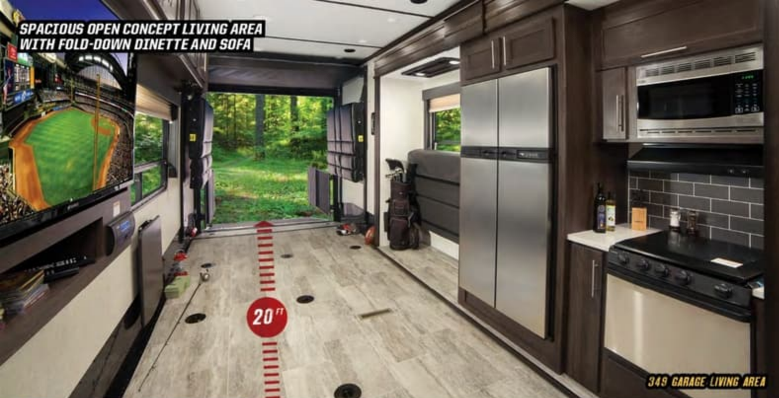
349 GARAGE LIVING AREA