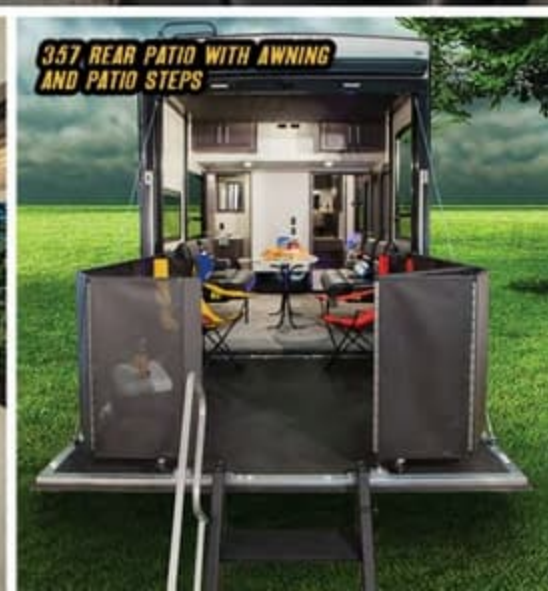
357 REAR PATIO WITH AWNING AND PATIO STEPS