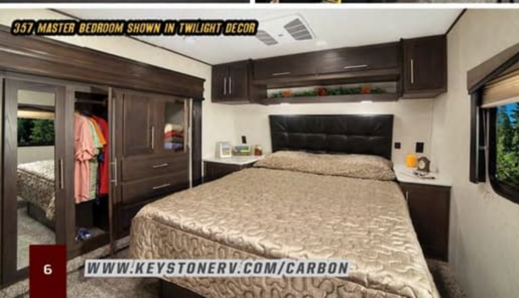
357 MASTER BEDROOM SHOWN IN TWILIGHT DECOR