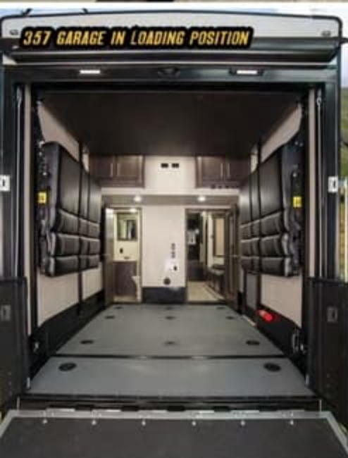
357 GARAGE IN LOADING POSITION