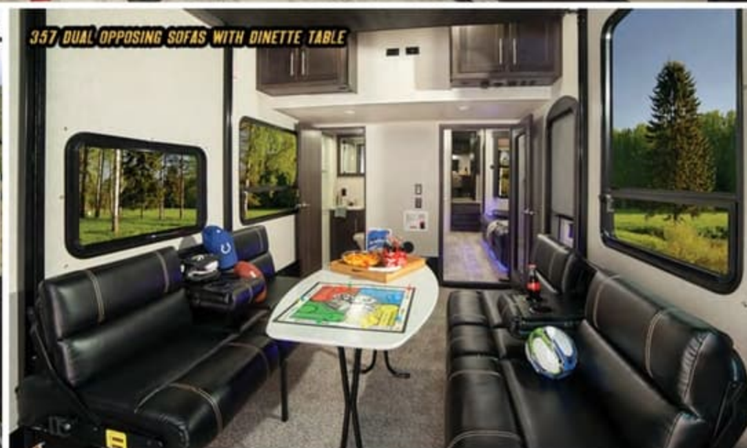
357 DUAL OPPOSING SOFAS WITH DINETTE TABLE