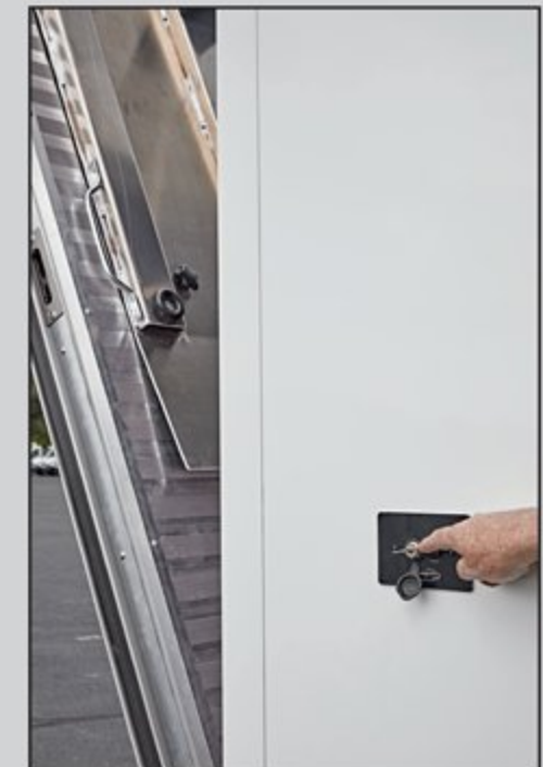
ELECTRIC HYDRAULIC REAR RAMP DOOR