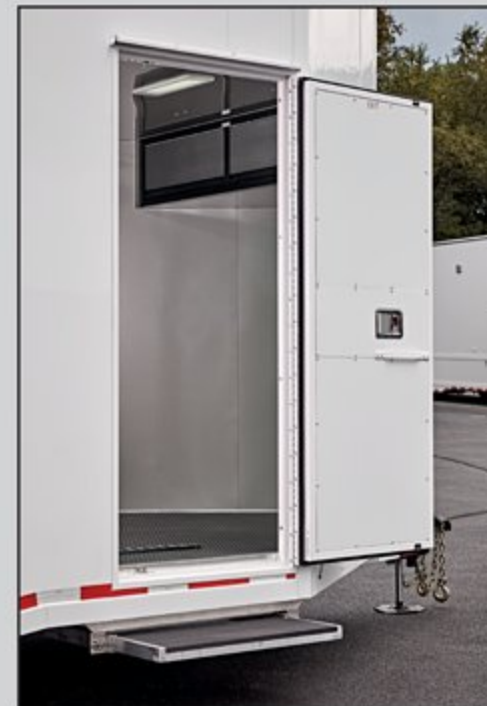
1520 SERIES AMBULANCE STYLE DOOR