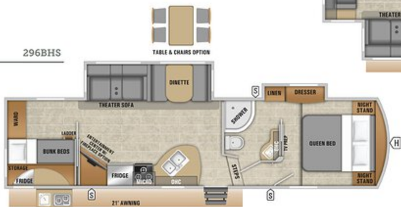
TABLE &amp; CHAIRS OPTION