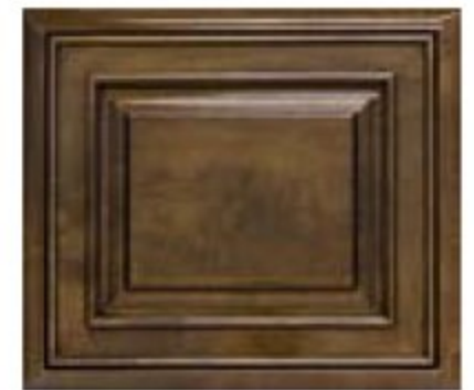
HIGH-GLOSS GLAZED PACIFIC