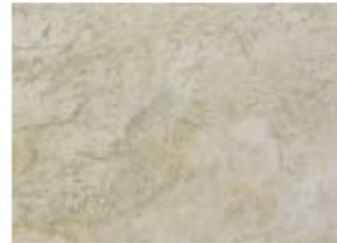
BED & BATH COUNTERTOP