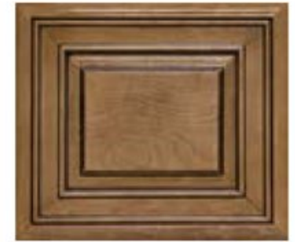
HIGH-GLOSS GLAZED NEWPORT