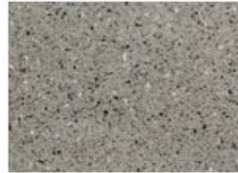
KITCHEN & DINETTE COUNTERTOP