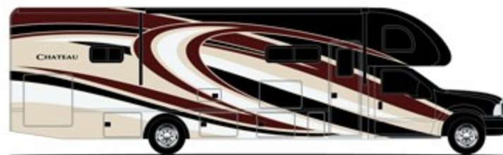
CHERRY TRAILS FULL-BODY PAINT