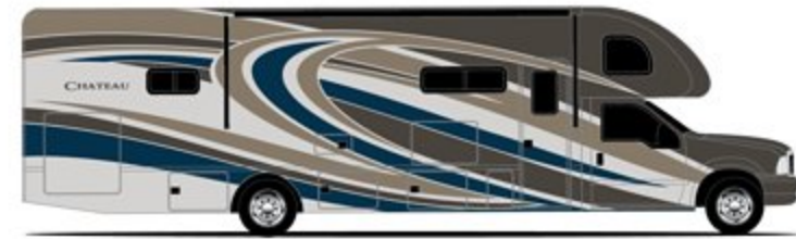
WINDING WATERS FULL-BODY PAINT