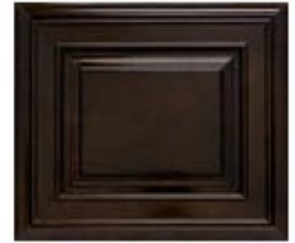
HIGH-GLOSS GLAZED MILAN