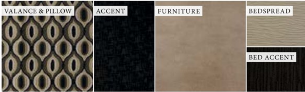
FADE TO BLACK