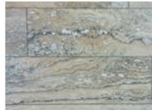
RESIDENTIAL VINYL FLOORING