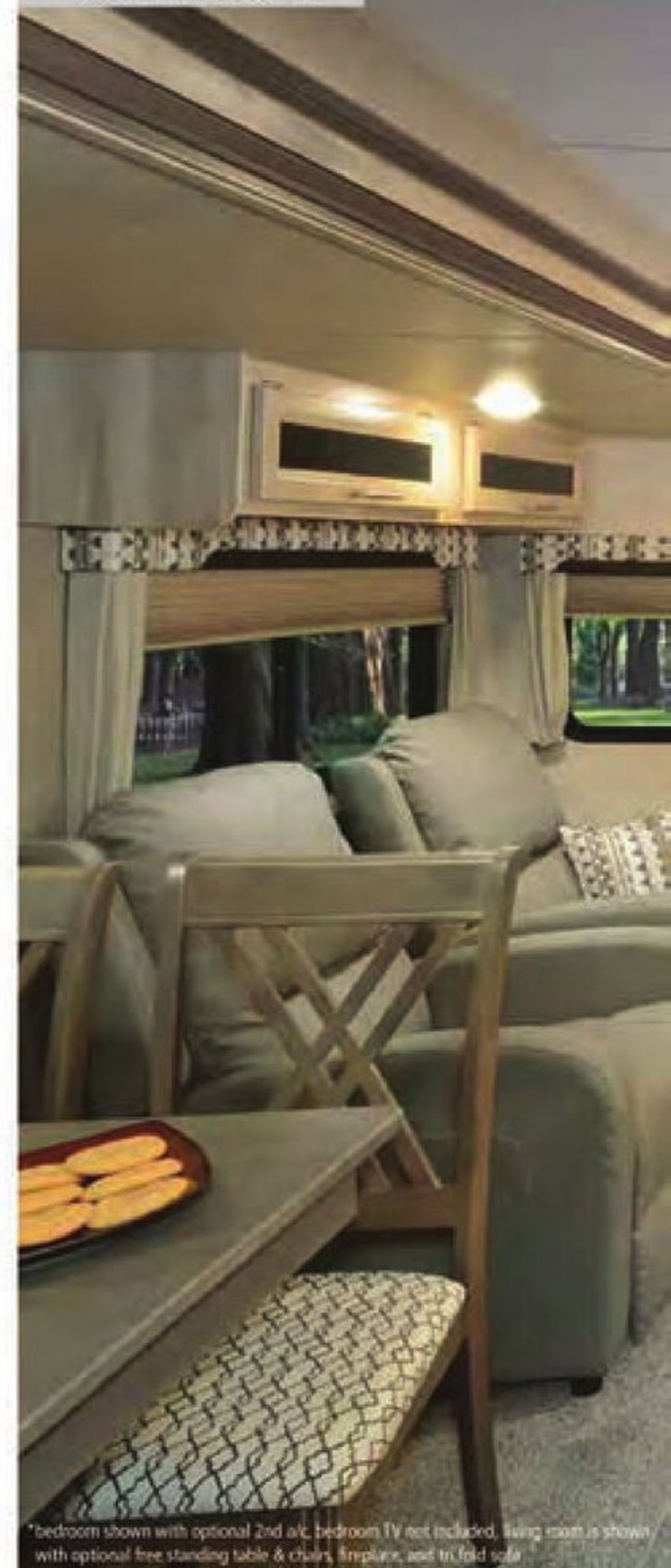
*bedroom shown with optional 2nd alc. bedroom TV not included. living room is shown with optional free standing table & chairs, fireplace, and in fold sofa