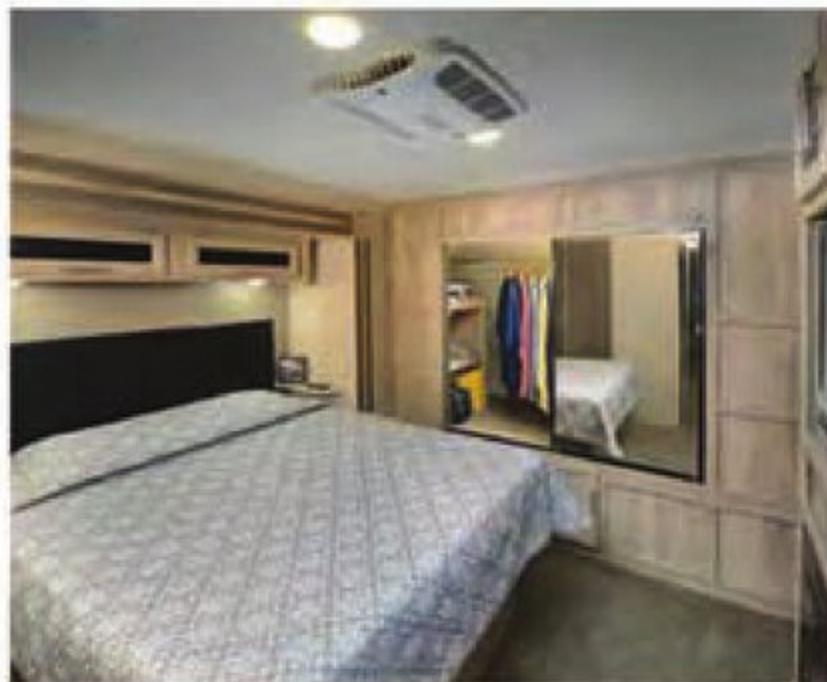
The 333RETS bedroom is built with a slide out making it one of the most spacious bedrooms in any travel trailer.

Wow! That's the first word that comes to mind when you step in to the Catalina 333RETS. Designed with a huge living and kitchen area to make your camping trips the ultimate experience! With an oversized bedroom, giant wardrobe, standard recliners, extra-large living room, and much more, you can't help but say wow!