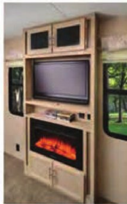
This bedroom also includes a custom built entertainment center and a fireplace. You'll feel right at home when you're ready to call it a night!