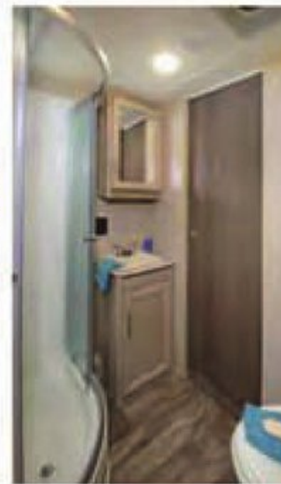
Tired of small bathrooms? That is something you don't have to worry about in the 333RETS. A full-sized radiant shower that includes tub surround and skylight, dual entrances, large sink, and medicine cabinets provide all the convenience you could ask for.