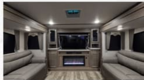
3851FL Living Area