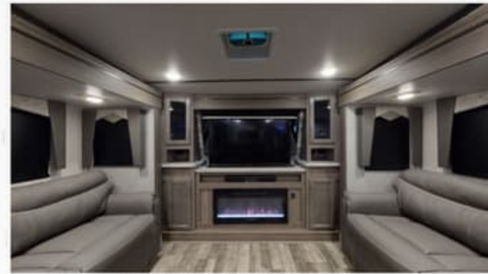
3851FL Living Area