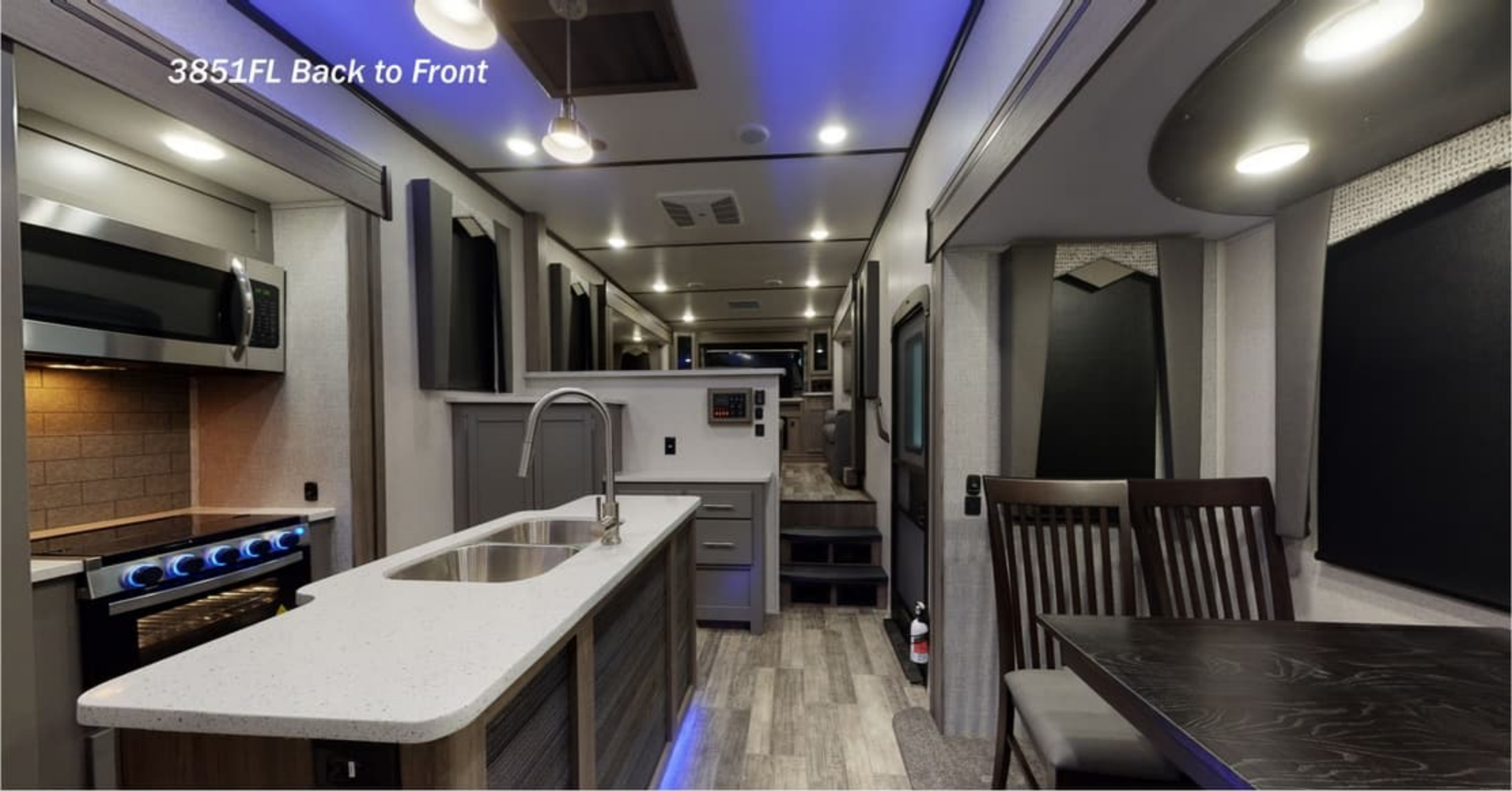
3851FL Back to Front