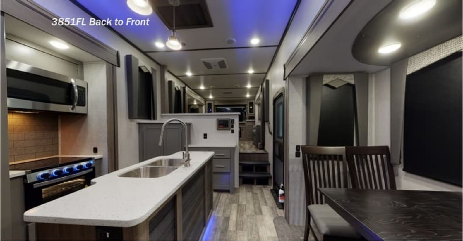
3851FL Back to Front