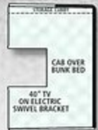
Cab Over Bunk Option