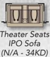
Theater Seats IPO Sofa (N/A - 34KD)