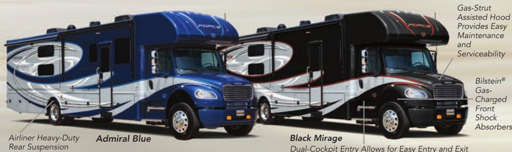
Airliner Heavy-Duty Rear Suspension