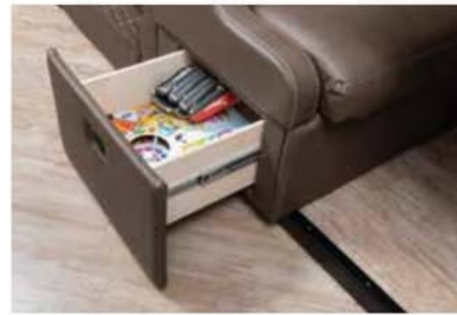
BOUNDER 36F Shown in Spiced Mocha decor with Nottingham Cherry cabinetry