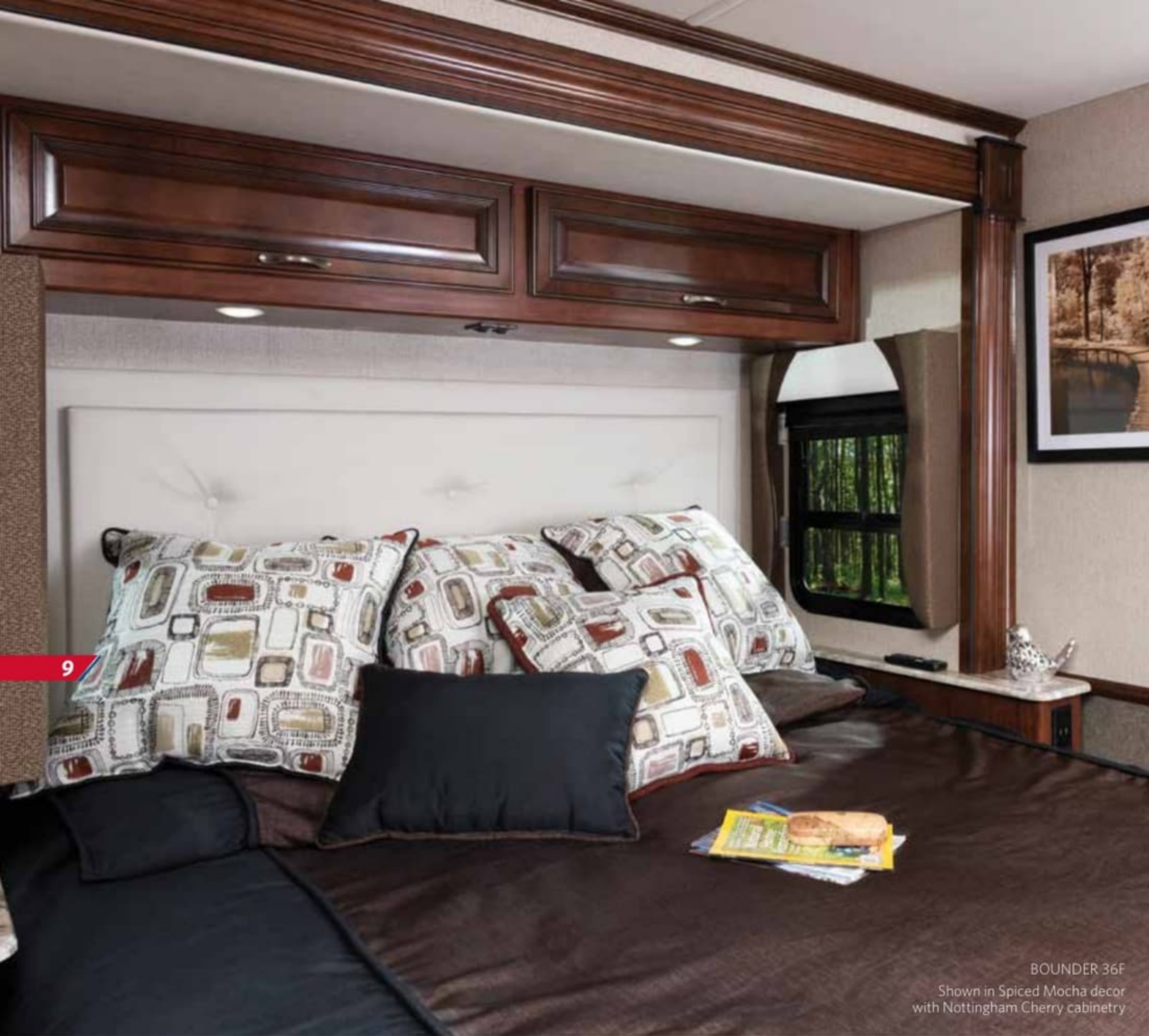
BOUNDER 36F Shown in Spiced Mocha decor with Nottingham Cherry cabinetry