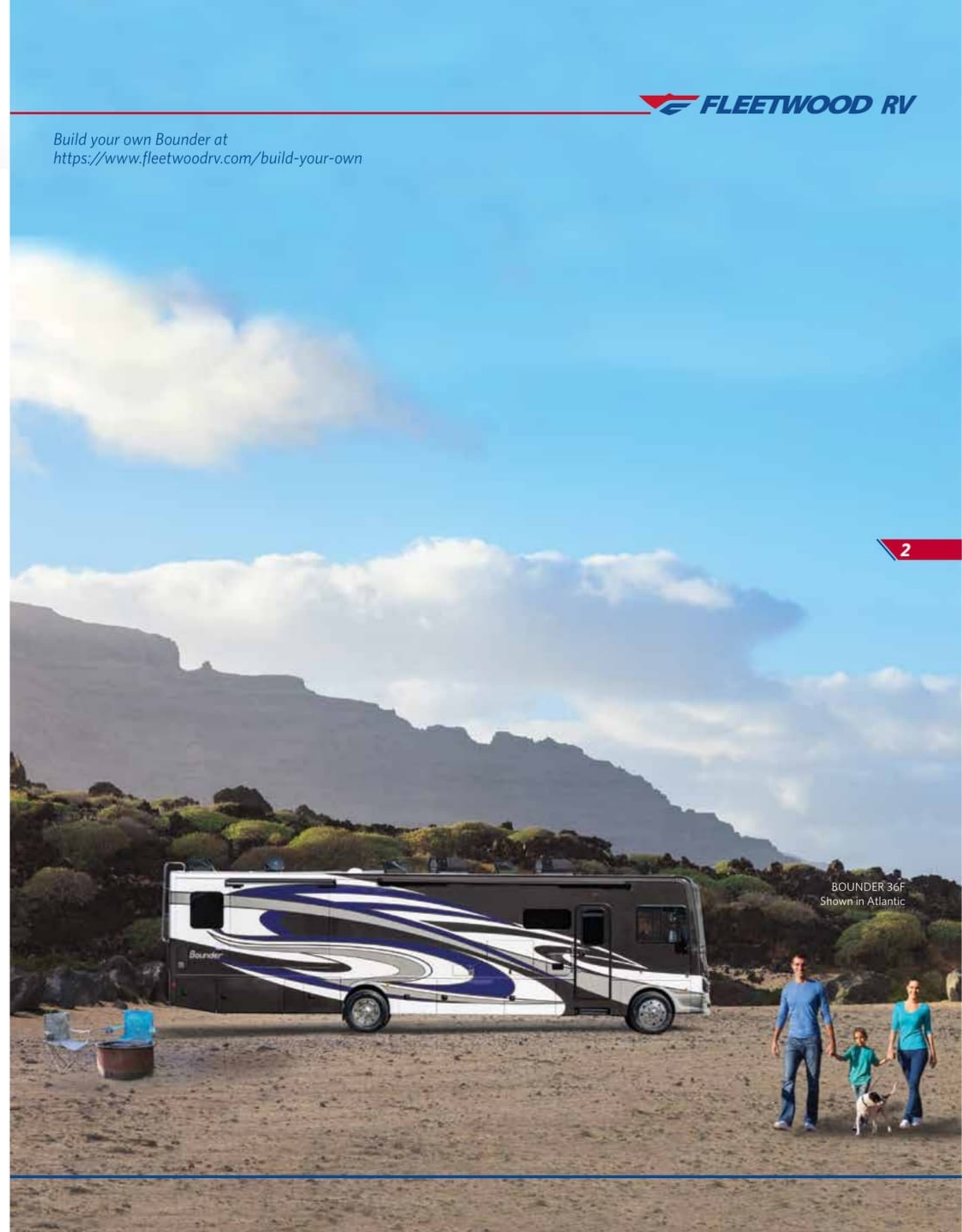
BOUNDER 36F Shown in Atlantic

Build your own Bounder at https://www.fleetwoodrv.com/build-your-own