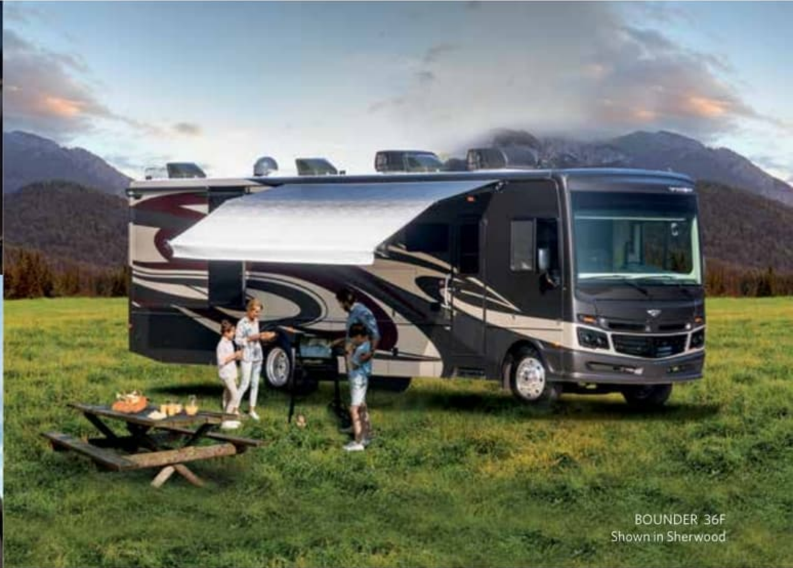
BOUNDER 36F Shown in Sherwood