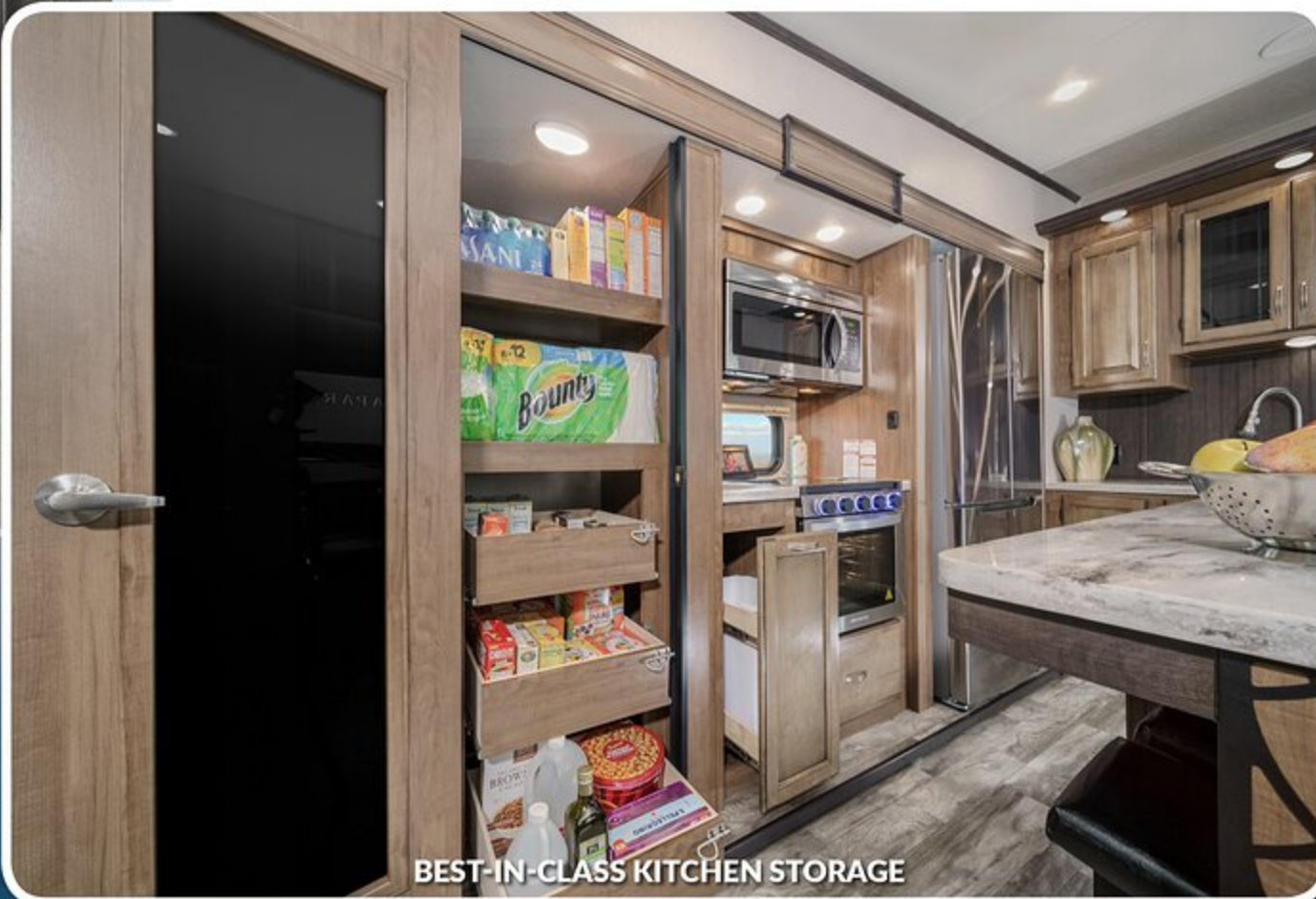
BEST-IN-CLASS KITCHEN STORAGE