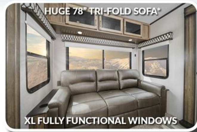
HUGE 78" TRI-FOLD SOFA*