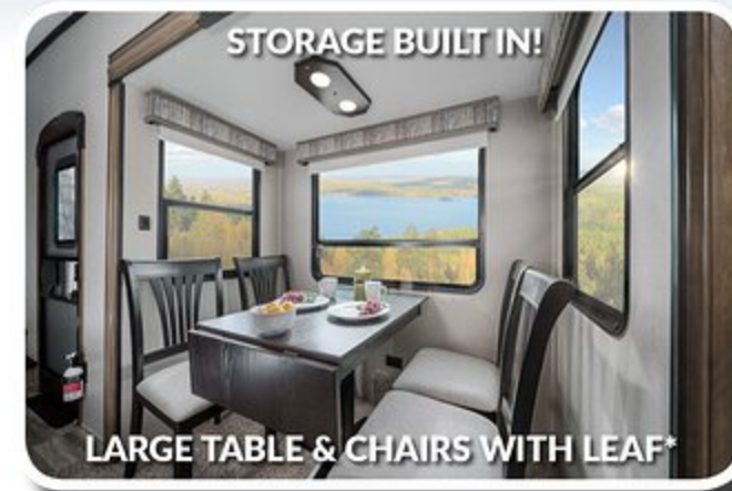
STORAGE BUILT IN!