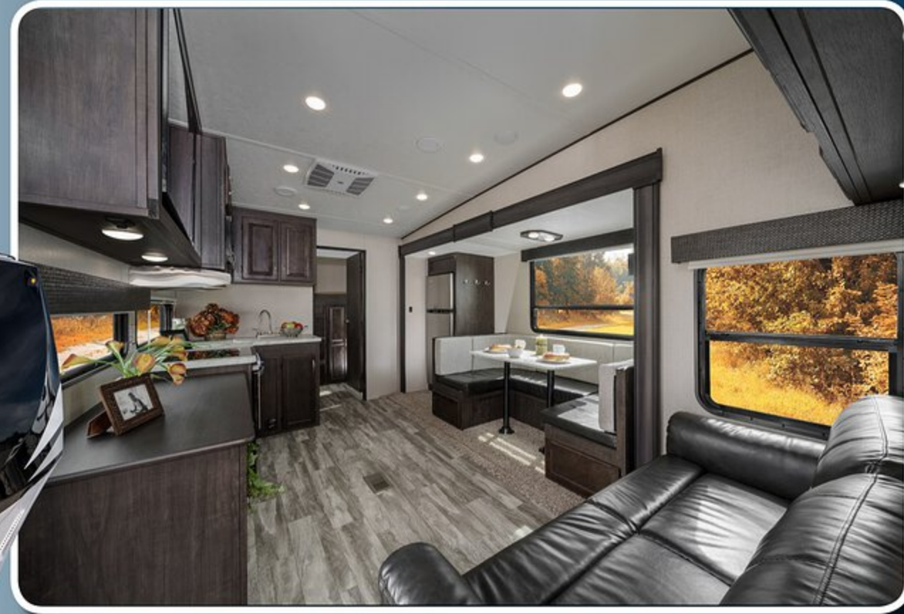
ALL NEW 274X-LITE IN CHARCOAL DECOR