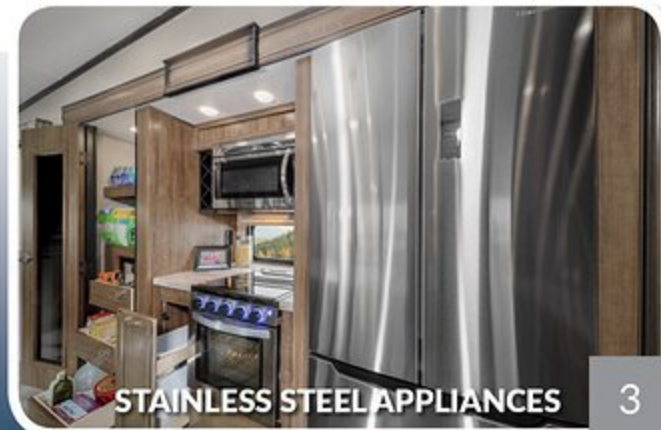
STAINLESS STEEL APPLIANCES