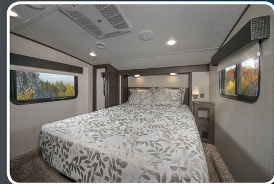
X-LITE 60X80 QUEEN BEDROOM SUITE