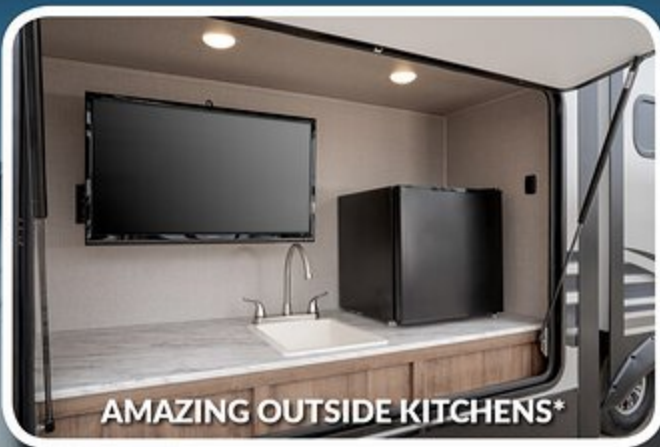
AMAZING OUTSIDE KITCHENS*