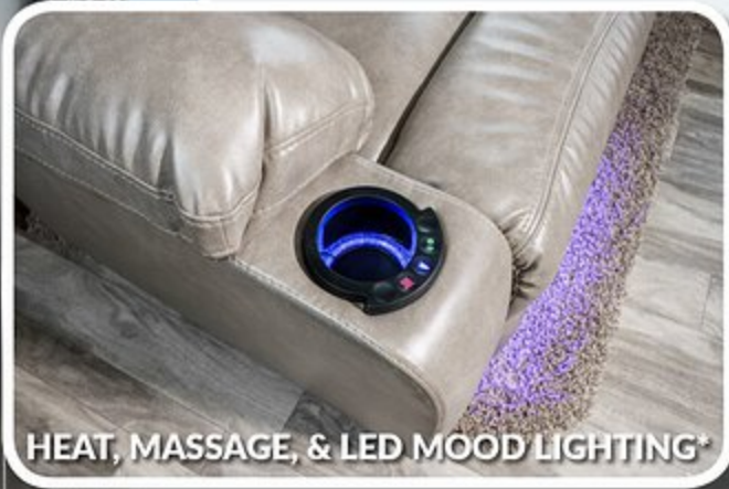
HEAT, MASSAGE, & LED MOOD LIGHTING*