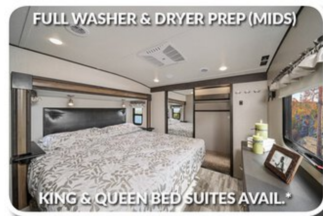
FULL WASHER & DRYER PREP (MIDS)