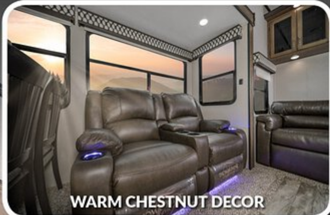
WARM CHESTNUT DECOR

20,000 square feet of quality assurance. The bare essentials for a premium product. This state-of-the-art facility gives immediate daily feedback to production for quality assurance in every unit built.