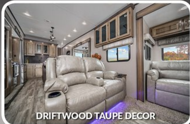
DRIFTWOOD TAUPE DECOR