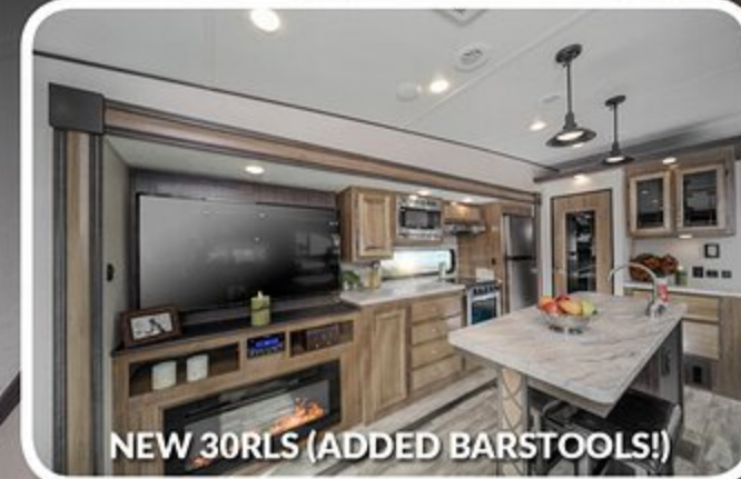
NEW 30RLS (ADDED BARSTOOLS!)

ALL INFORMATION CONTAINED IN THIS BROCHURE IS BELIEVED TO BE ACCURATE AT THE TIME OF PUBLICATION. HOWEVER, DURING THE MODEL YEAR IT MAY BE NECESSARY TO MAKE REVISIONS. FOREST RIVER, INC., RESERVES THE RIGHT TO MAKE ALL SUCH CHANGES WITHOUT NOTICE, INCLUDING PRICES, COLORS, MATERIALS, EQUIPMENT, AND SPECIFICATIONS, AS WELL AS THE ADDITION OF NEW MODELS AND THE DISCONTINUANCE OF MODELS SHOWN IN THIS BROCHURE. THEREFORE, PLEASE CONSULT WITH YOUR FOREST RIVER DEALER AND CONFIRM THE EXISTENCE OF ANY MATERIALS, DESIGN, OR SPECIFICATIONS THAT ARE MATERIAL TO YOUR PURCHASE DECISION. *WHERE APPLICABLE.