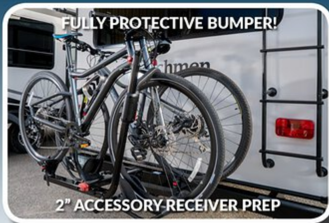
FULLY PROTECTIVE BUMPER!