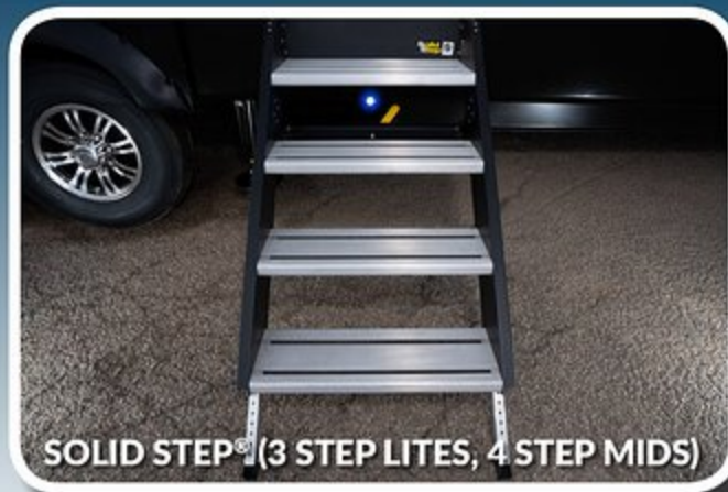
SOLID STEP (3 STEP LITES, 4 STEP MIDS)