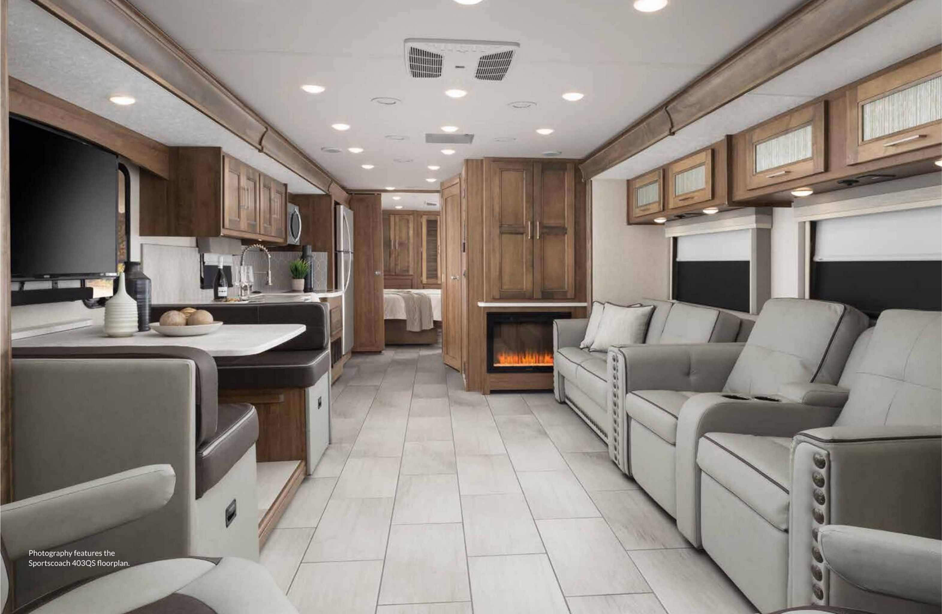
Photography features the Sportscoach 403QS floorplan.