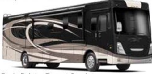
Full Body Paint – Desert Sand