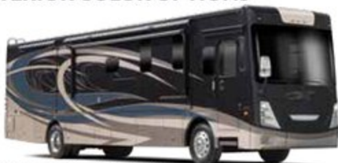
Full Body Paint – Cambridge