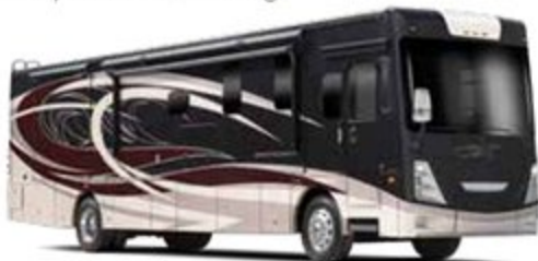
Full Body Paint – Syrah