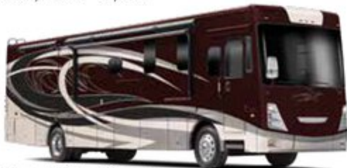
Full Body Paint – Garnet