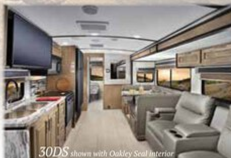
30DS shown with Oakley Seal interior

Theatre Seating (Standard on 33DS and 34DS) Washer/Dryer Combo (N/A 32DS)