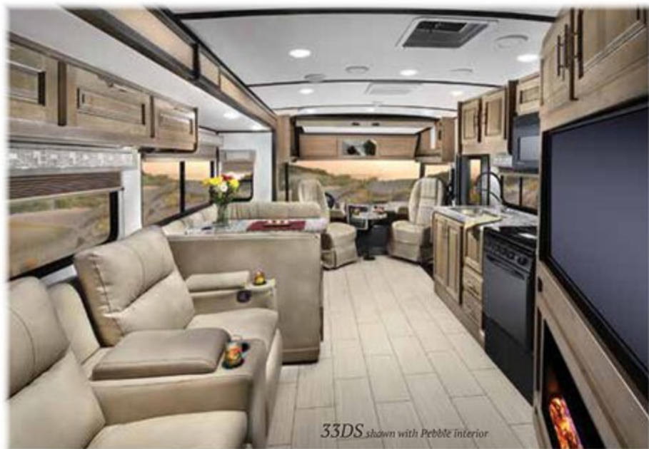
33DS shown with Pebble interior

for more photos and the latest model standards and options, visit forestriverinc.com/fr3