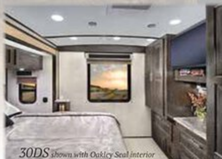
30DS shown with Oakley Seal interior

for more photos and the latest model standards and options, visit forestriverinc.com/fr3