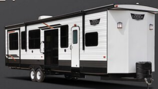
DLX | LODGE | GRAND LODGE