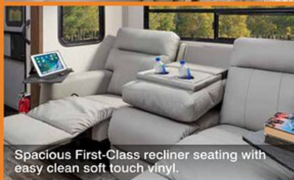
Spacious First-Class recliner seating with easy clean soft touch vinyl.