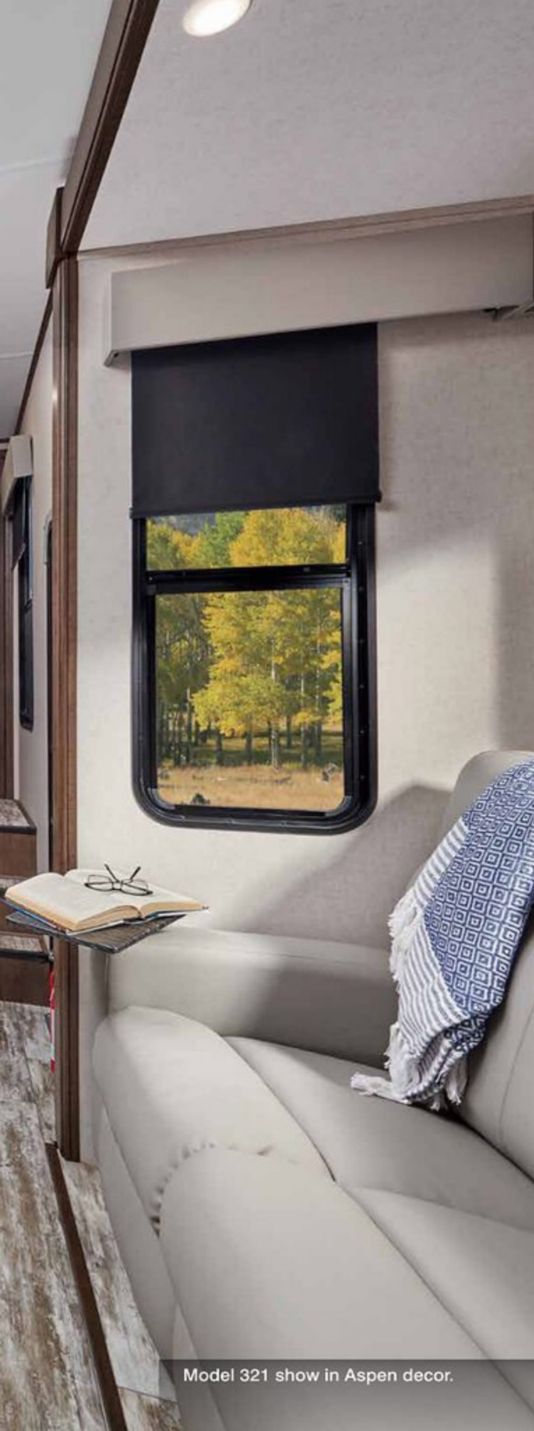
Model 321 show in Aspen decor.