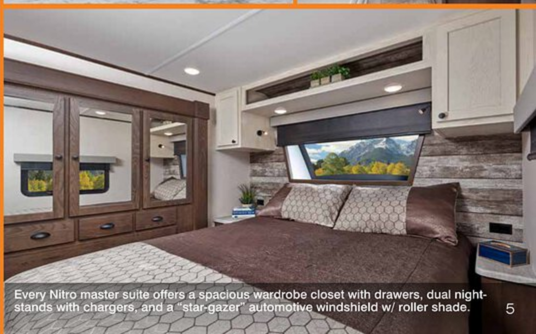
Every Nitro master suite offers a spacious wardrobe closet with drawers, dual nightstands with chargers, and a "star-gazer" automotive windshield w/ roller shade.