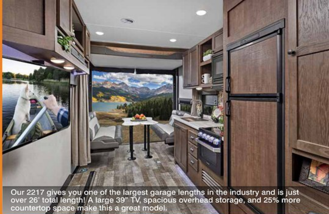
Our 2217 gives you one of the largest garage lengths in the industry and is just over 26' total length! A large 39" TV, spacious overhead storage, and 25% more countertop space make this a great model.