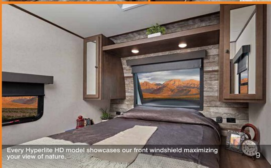
Every Hyperlite HD model showcases our front windshield maximizing your view of nature.