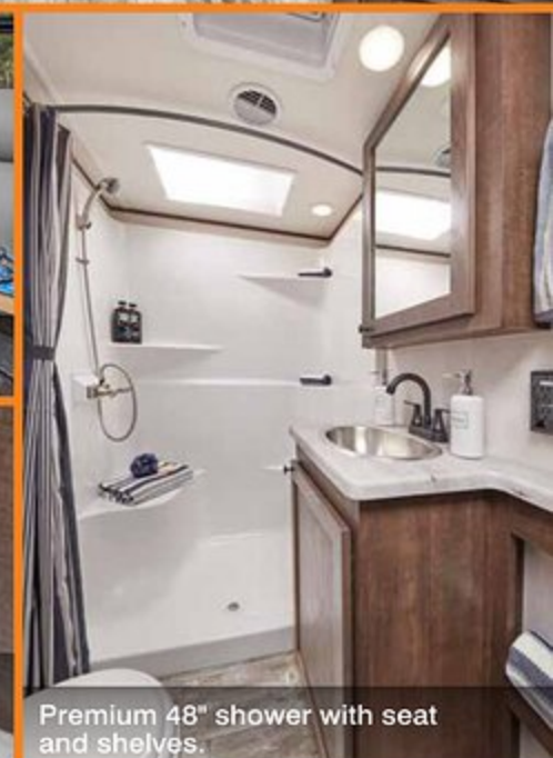
Premium 48" shower with seat and shelves.