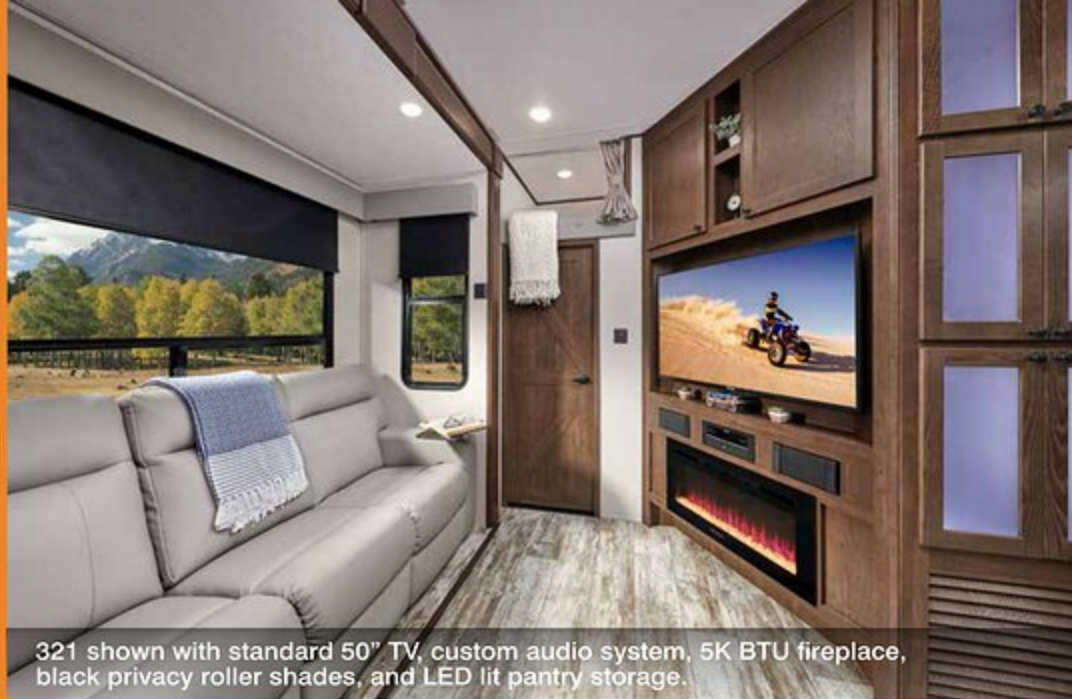
321 shown with standard 50" TV, custom audio system, 5K BTU fireplace, black privacy roller shades, and LED lit pantry storage.