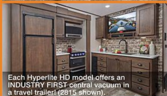
Each Hyperlite HD model offers an INDUSTRY FIRST central vacuum in a travel trailer! (2815 shown).