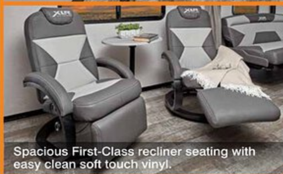
Spacious First-Class recliner seating with easy clean soft touch vinyl.