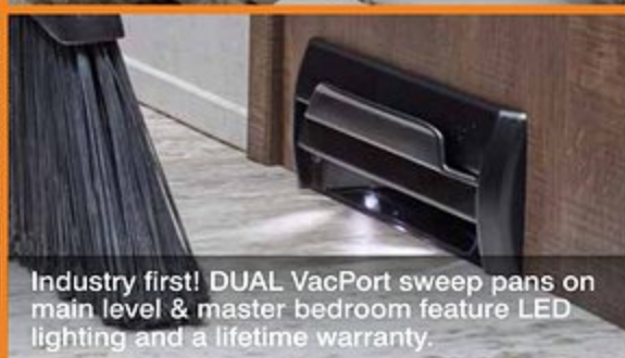
Industry first! DUAL VacPort sweep pans on main level & master bedroom feature LED lighting and a lifetime warranty.