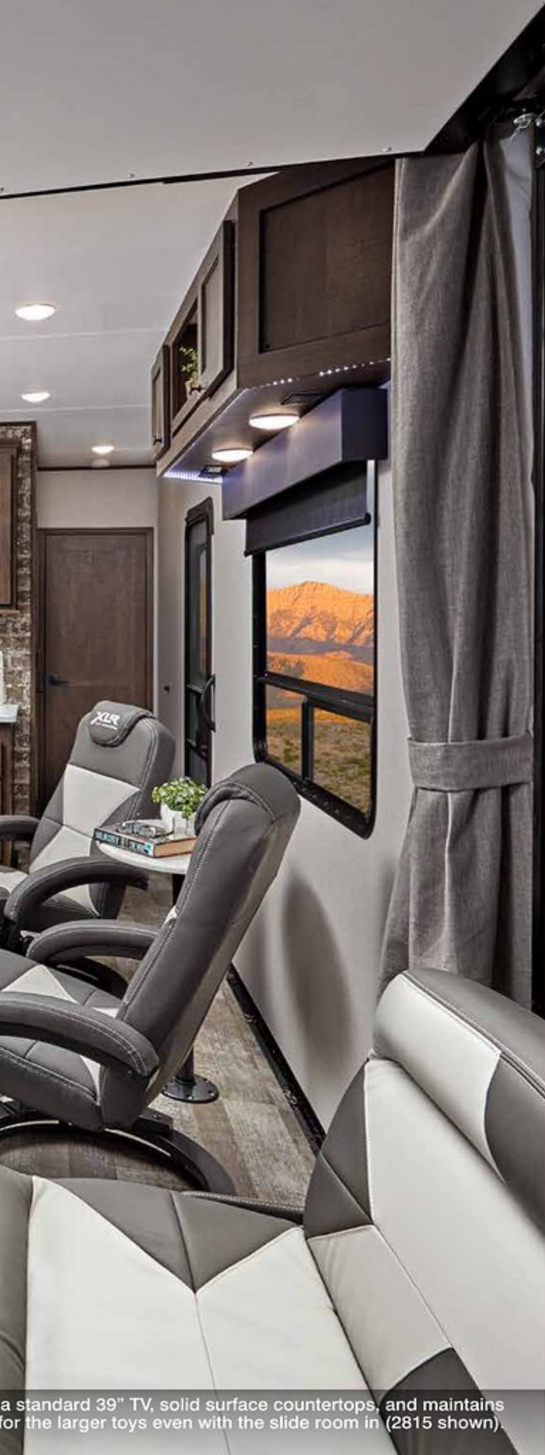
a standard 39" TV, solid surface countertops, and maintains for the larger toys even with the slide room in (2815 shown).