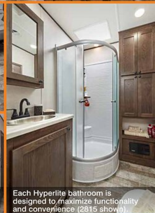
Each Hyperlite bathroom is designed to maximize functionality and convenience (2815 shown).