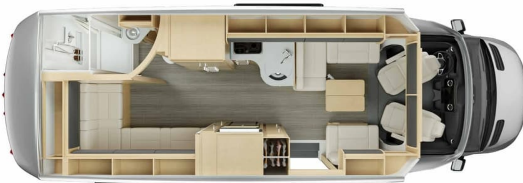
Optional Rear Power Trifold Sofa/Bed