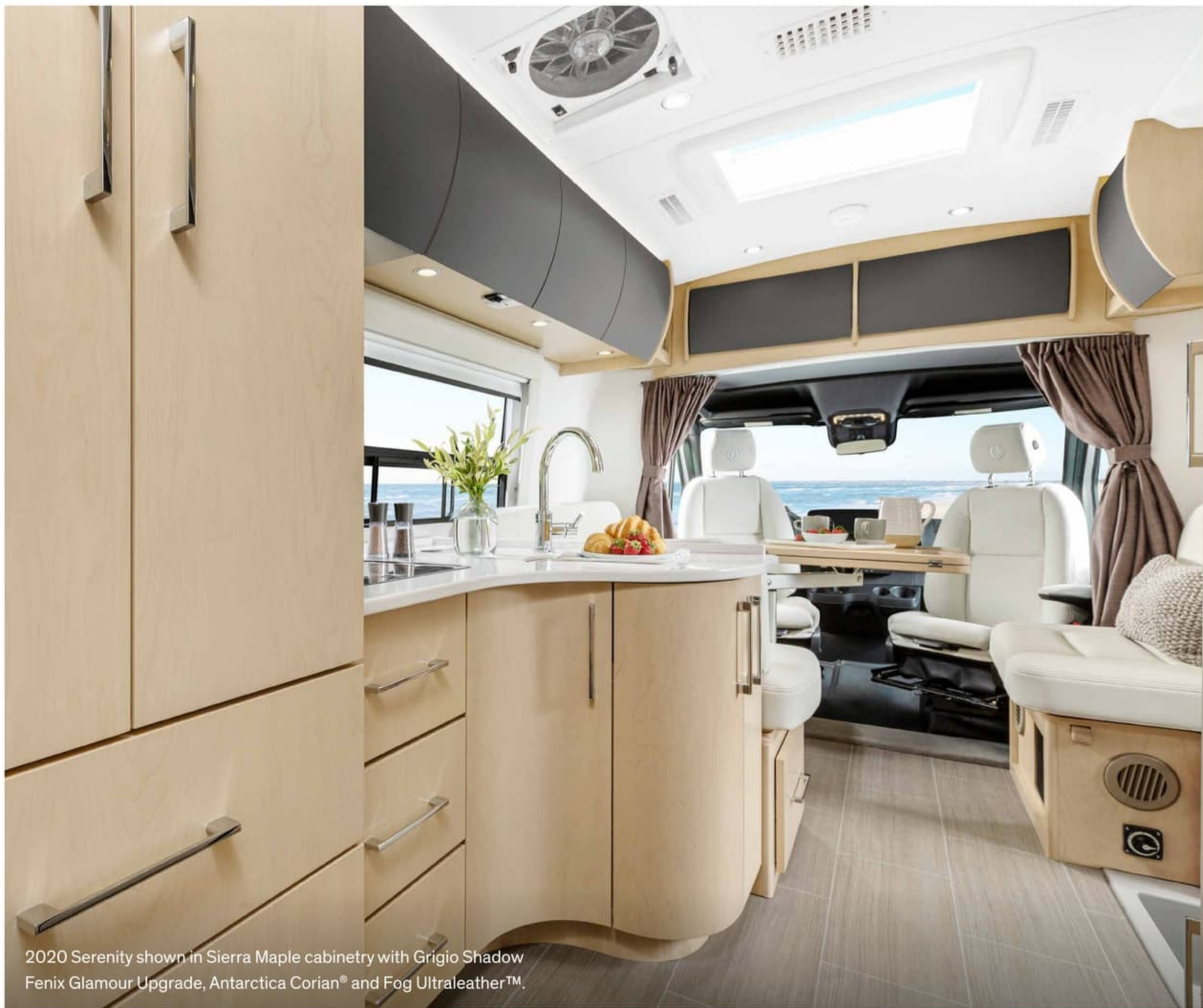
2020 Serenity shown in Sierra Maple cabinetry with Grigio Shadow Fenix Glamour Upgrade, Antarctica Corian® and Fog Ultraleather™.