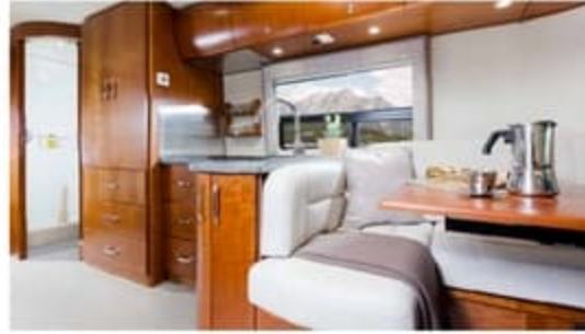
Chestnut Cherry Available w/ Glamour Upgrade Previous Year Model Shown