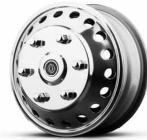
Steel Standard – With Wheel Simulators