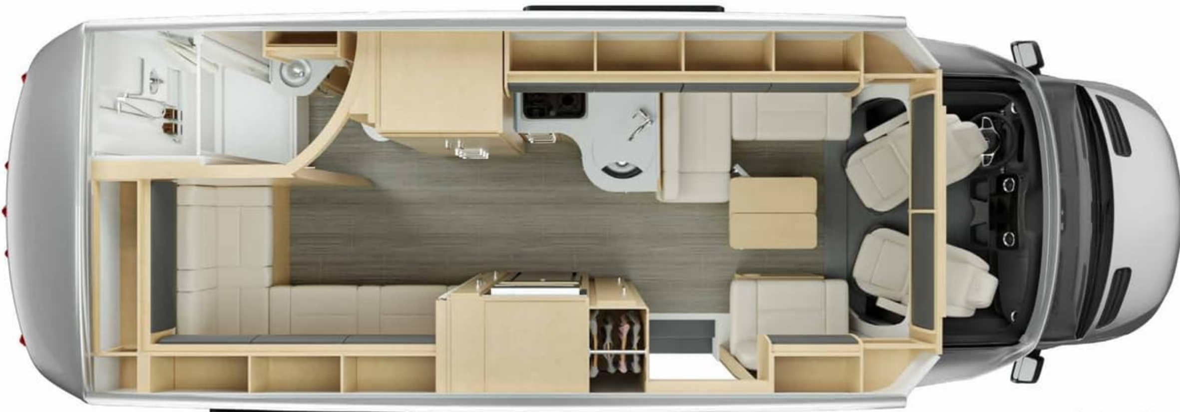
Optional Rear Power Trifold Sofa/Bed