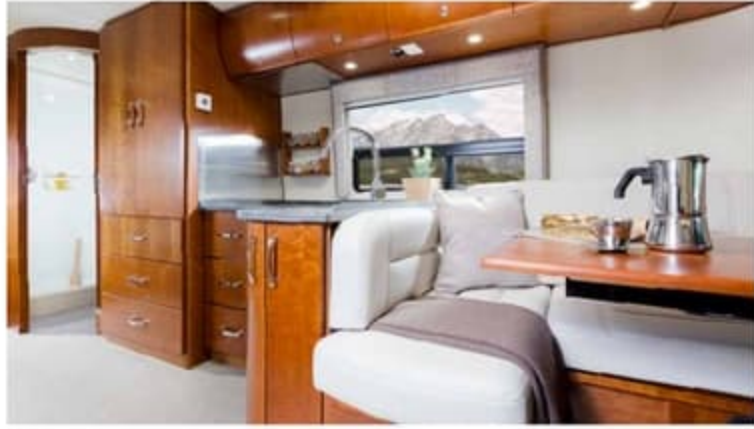
Chestnut Cherry Available w/ Glamour Upgrade Previous Year Model Shown