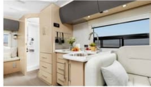
Sierra Maple Shown w/ Glamour Upgrade