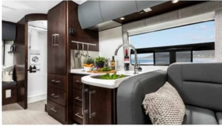
Espresso Brown Shown w/Glamour Upgrade Previous Year Model Shown