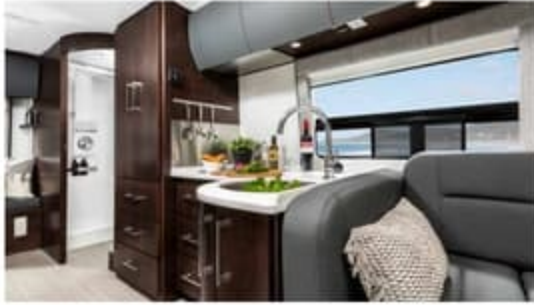
Espresso Brown Shown w/ Glamour Upgrade Previous Year Model Shown