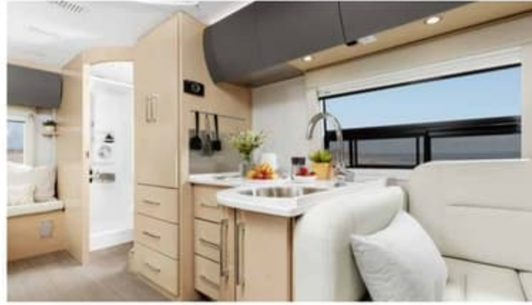
Sierra Maple Shown w/ Glamour Upgrade