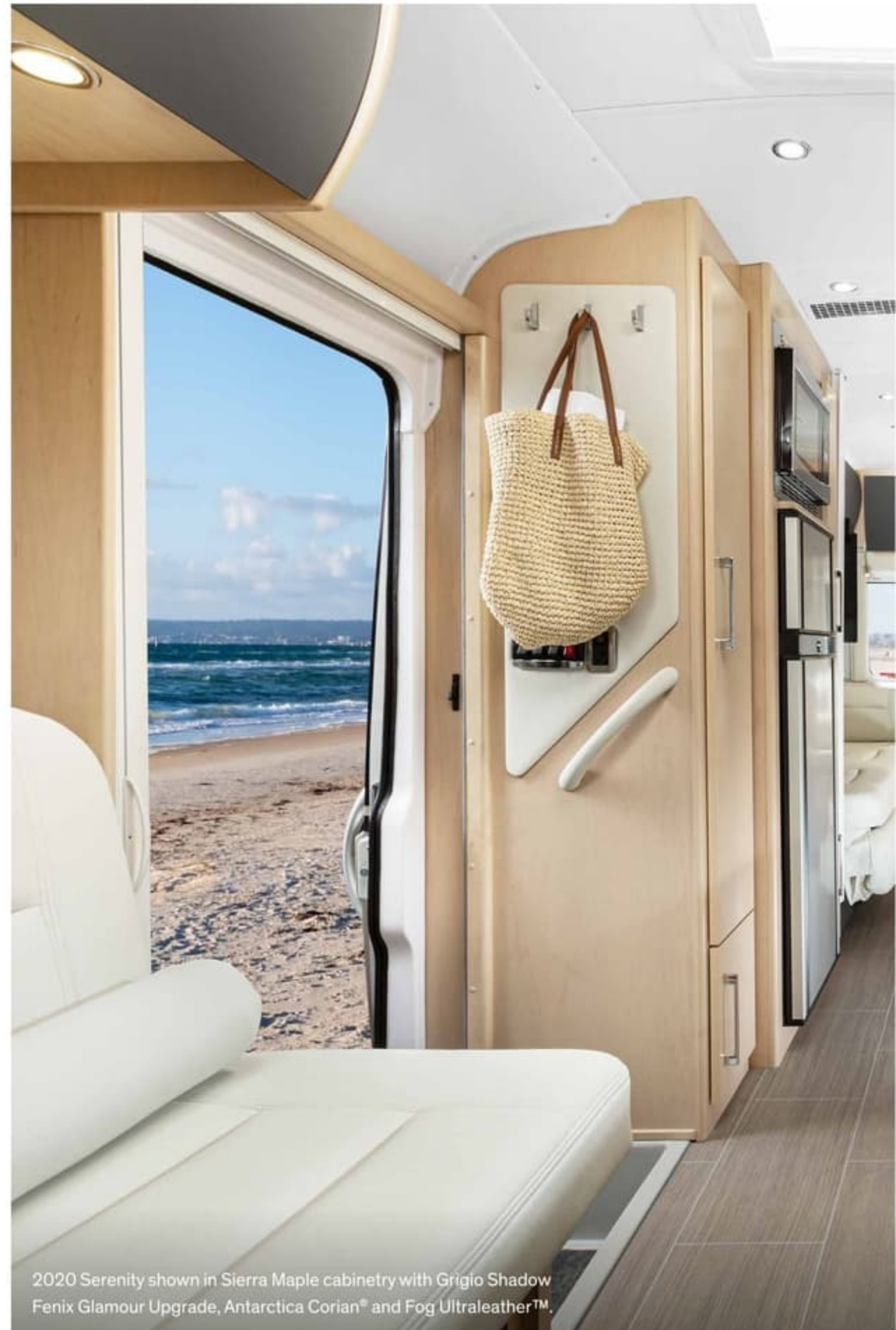
2020 Serenity shown in Sierra Maple cabinetry with Grigio Shadow Fenix Glamour Upgrade, Antarctica Corian® and Fog Ultraleather™.