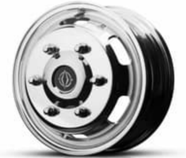
Alcoa Dura-Bright® Aluminum Optional – All 6 Aluminum Wheels, 4 Dura-Bright® Wheels