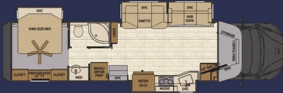
38 LDG (ON COVER)