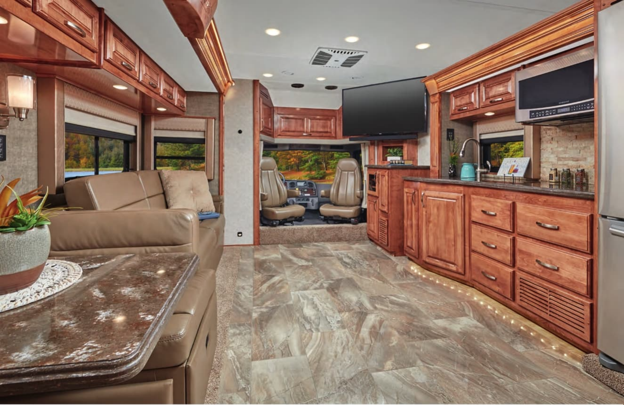
VERONA LE 38LDG SHOWN IN VANILLA FROST DÉCOR WITH NUTMEG CABINETS IN OPTIONAL HIGH GLOSS FINISH.

Verona LE, with its large opposing slideouts, offers a spacious living area with amazing storage and luxurious features. Beautiful hardwood cabinetry, gleaming polished porcelain tile floors, and sumptuous Ultraleather upholstered furniture let you know you have arrived in style.