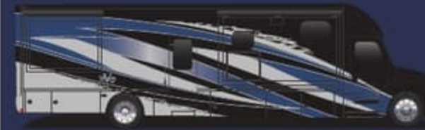
MARITIME (ON COVER)