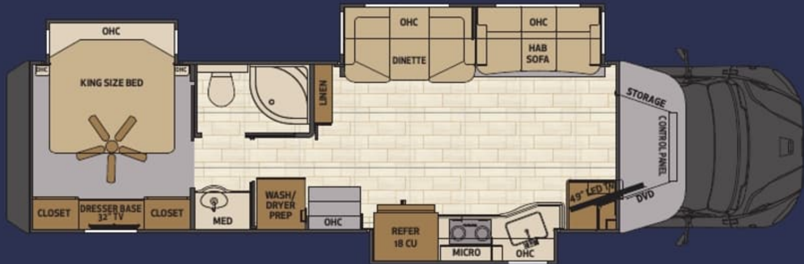
38 LDG (ON COVER)