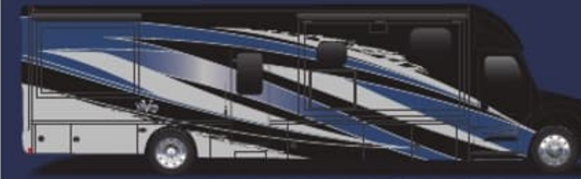
MARITIME (ON COVER)