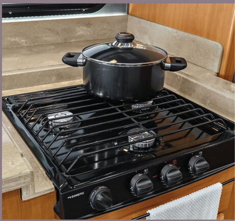
Top to bottom: Sink; 3-burner cooktop.