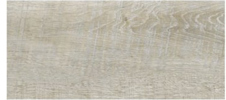
SAND CASTLE (S)