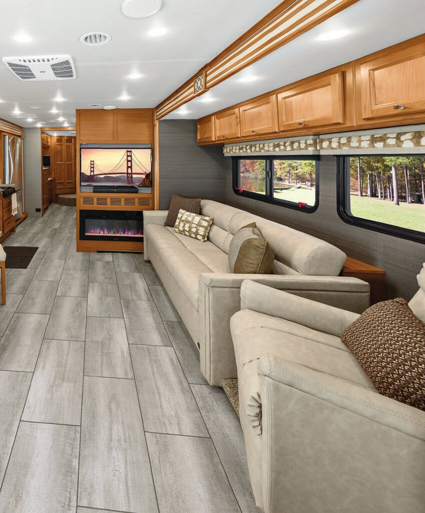
Top to bottom: Living Area; Sofa with optional Fireplace; Sofa bed expanded.