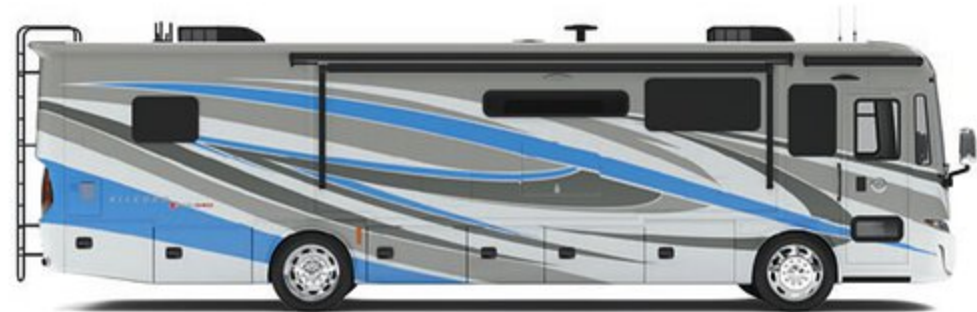
G1 GLACIER BLUE