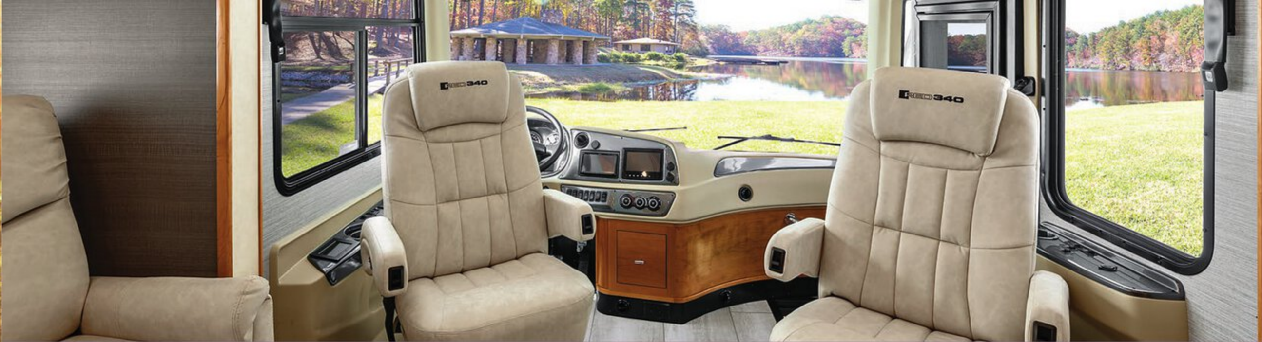
Clockwise from top: Cockpit; Passenger Side Dinette; Dashboard; Master Bed. All interiors shown are Natural Alder cabinets, Sand Bar II décor.