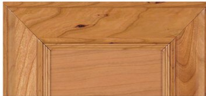
NATURAL ALDER (O)