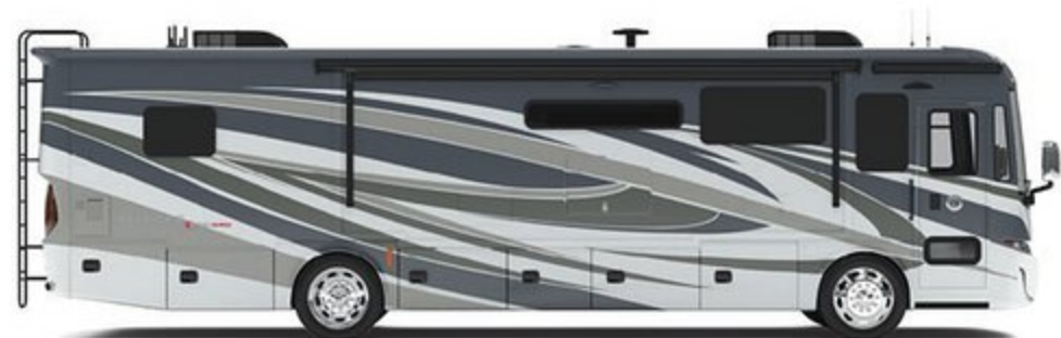
G1 SLATE GRAY