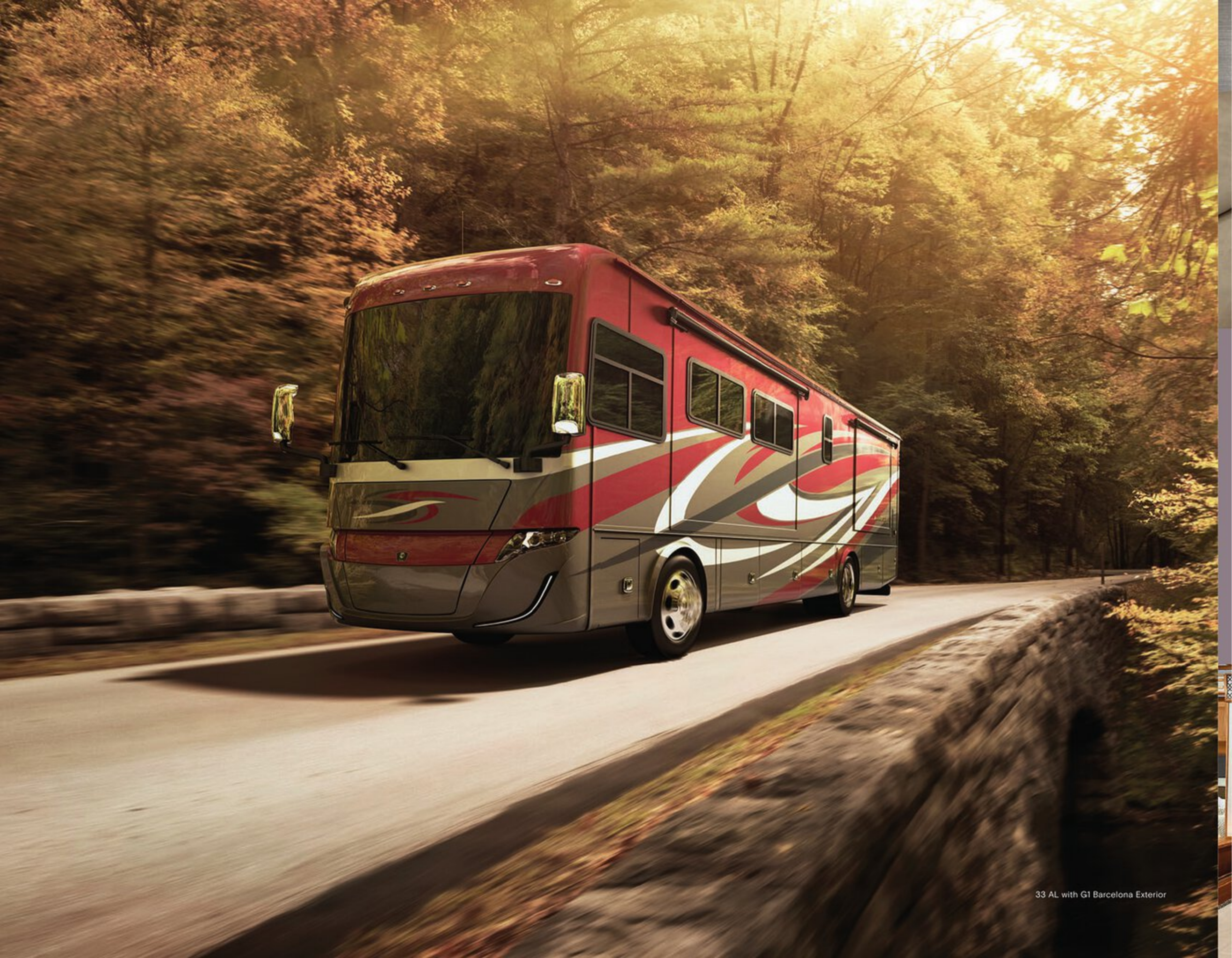
33 AL with G1 Barcelona Exterior