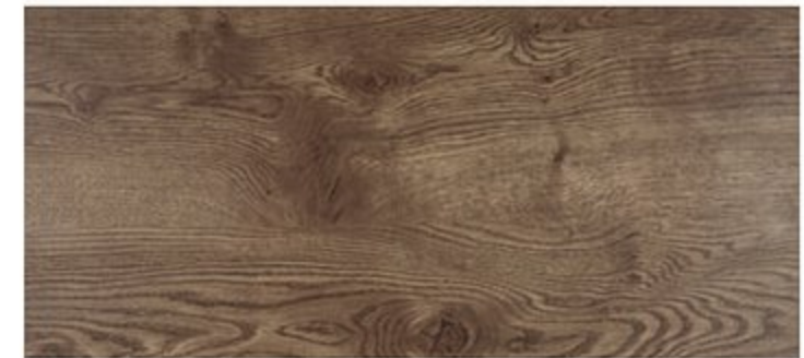
SEA OAT (O)