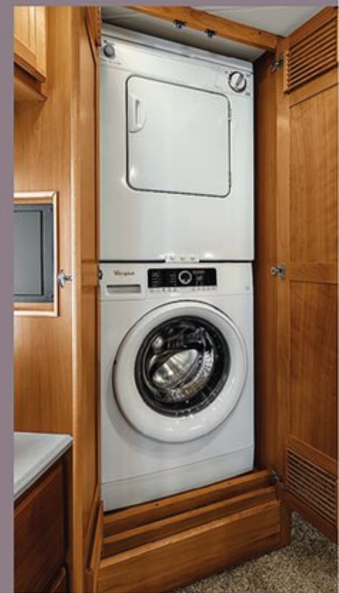
Clockwise from top: Master Bathroom vanity; Optional Stacked Washer and Dryer; Shower.