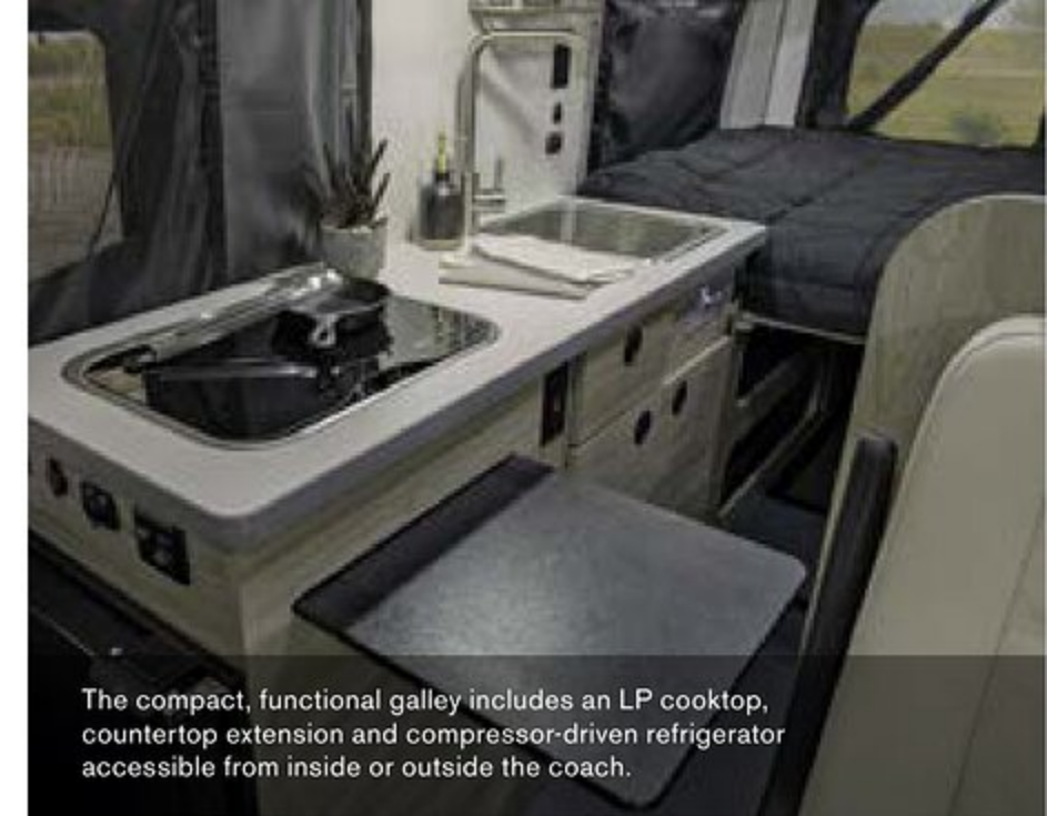
The compact, functional galley includes an LP cooktop, countertop extension and compressor-driven refrigerator accessible from inside or outside the coach.