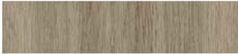
Wood - Weathered Teak