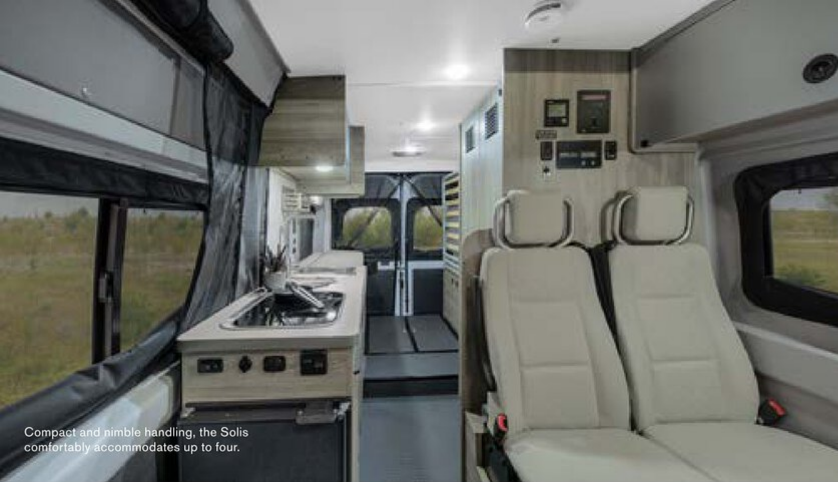
Compact and nimble handling, the Solis comfortably accommodates up to four.