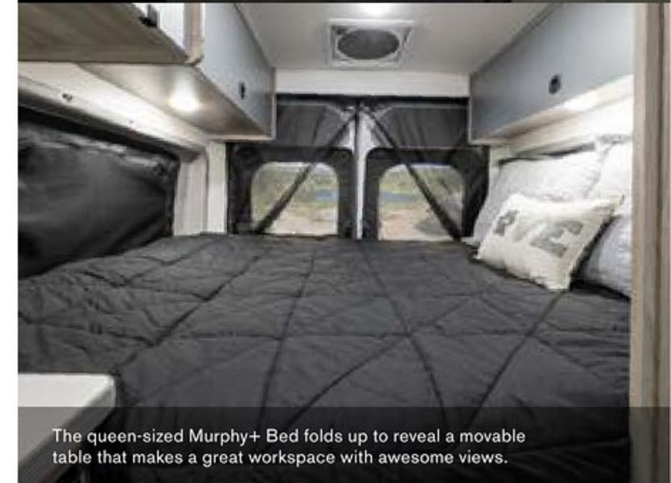
The queen-sized Murphy+ Bed folds up to reveal a movable table that makes a great workspace with awesome views.