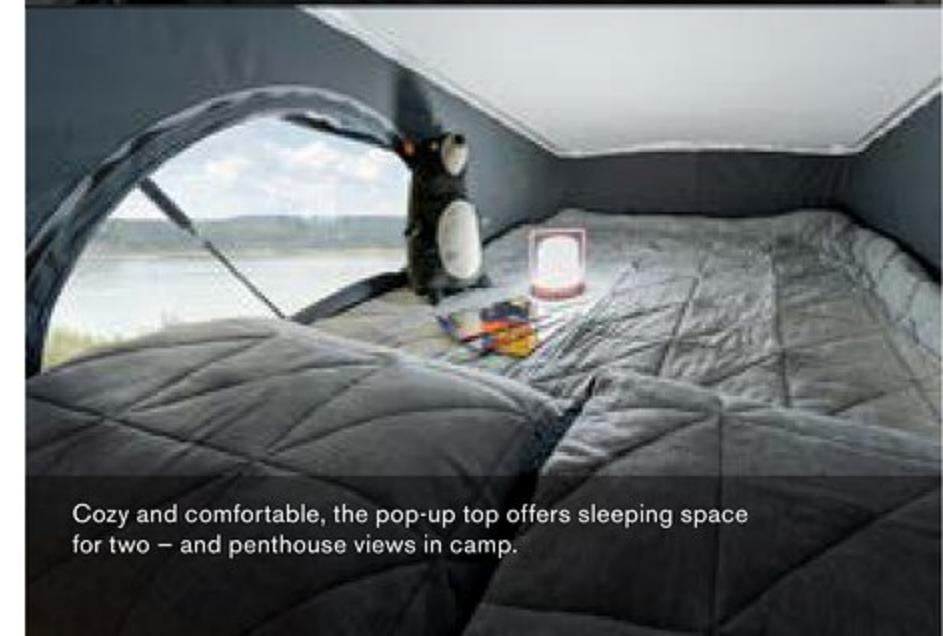
Cozy and comfortable, the pop-up top offers sleeping space for two – and penthouse views in camp.