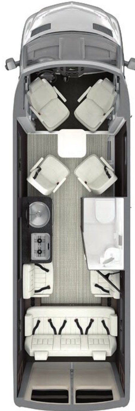
Interstate 24GL 4x2

In the Interstate 24GL, the fun doesn't have to wait to begin until you arrive at your destination, the fun begins the moment you step inside.