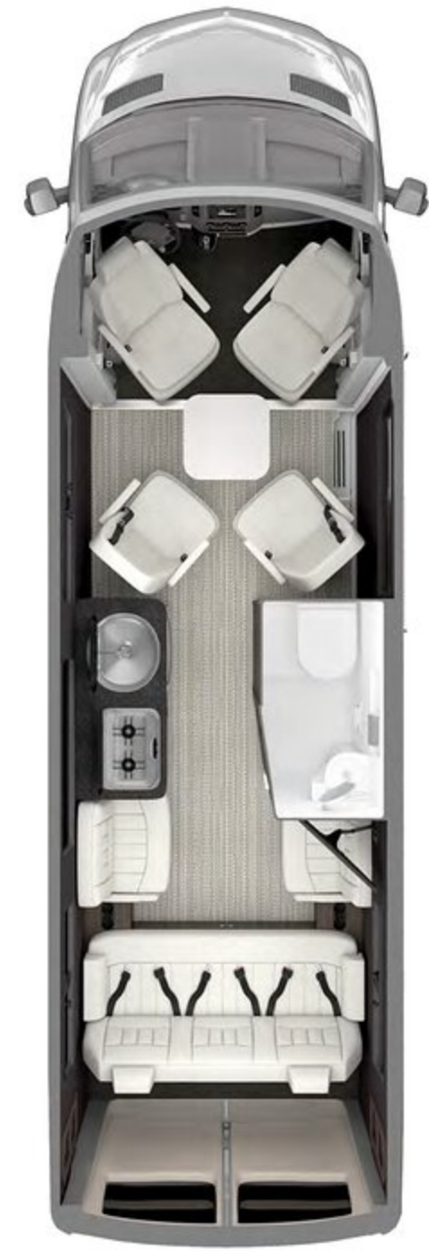
Interstate 24GL 4x4