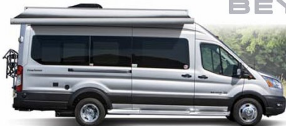
Optional bike rack shown