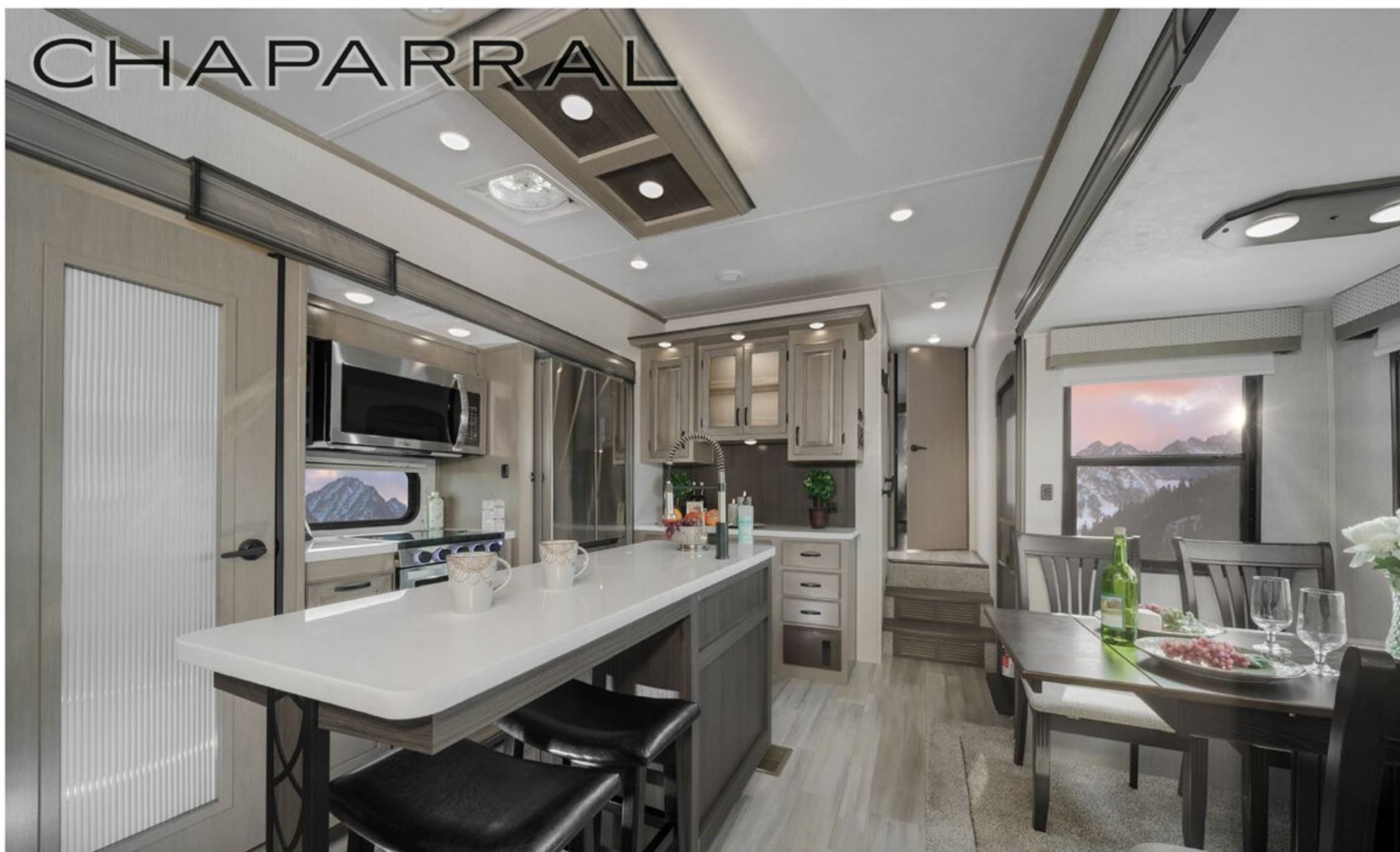
Kitchen & Dining Area, 336TSIK