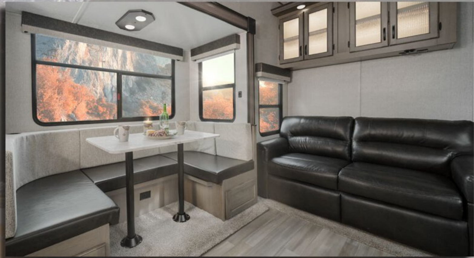
Mahogany Bay Decor

Chaparral's 2nd decor option maintains our beautiful Dove Grey L.E.D. back lit cabinetry* with a darker ebony seating & valance choice called Mahogany Bay. The contrast between the cabinetry & seating areas provides a stunning, modern look, in a more family friendly (even husband-friendly) color palette.