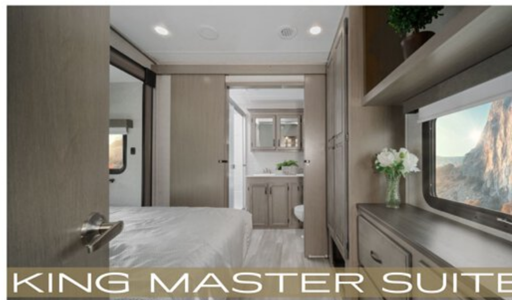
KING MASTER SUITE