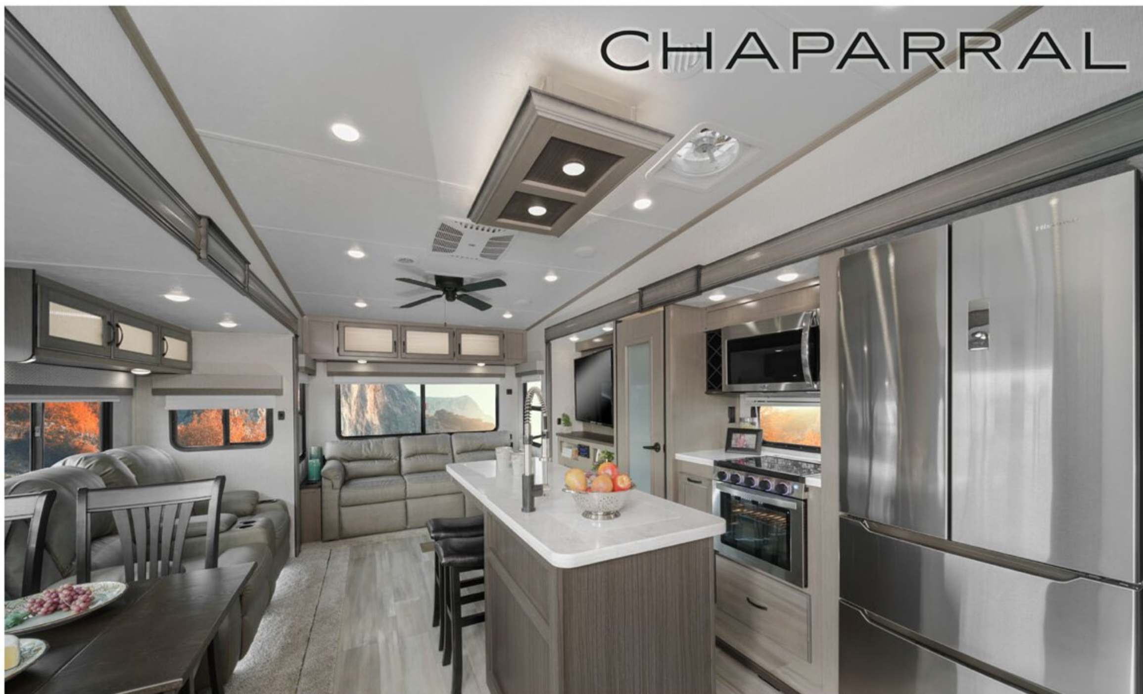
Kitchen & Living Area, 336TSIK