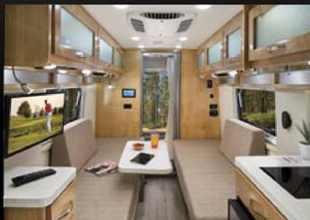
The versatile 20RB twin bed model has contemporary hardwood cabinetry and a spacious rear bath with a one-piece fiberglass shower. Nova's side windows open to increase ventilation.