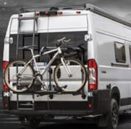
Optional bike rack