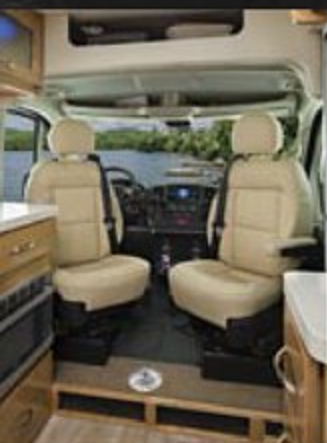
Swivel Captains chairs with removable table