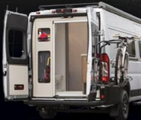
Easy to access rear bath and storage