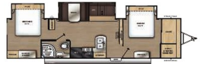
2 ND QUEEN