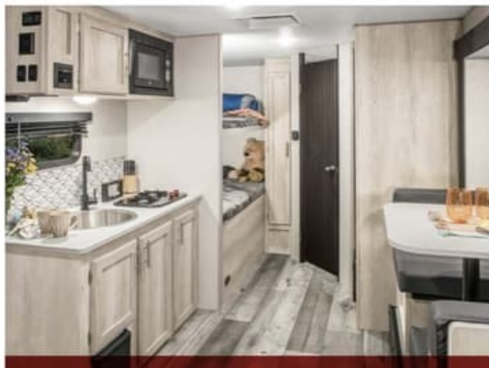
191BHK | Ashwood décor