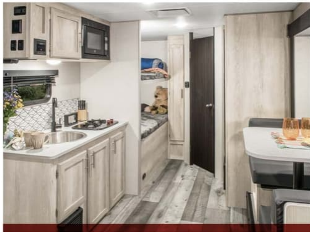
191BHK | Ashwood décor