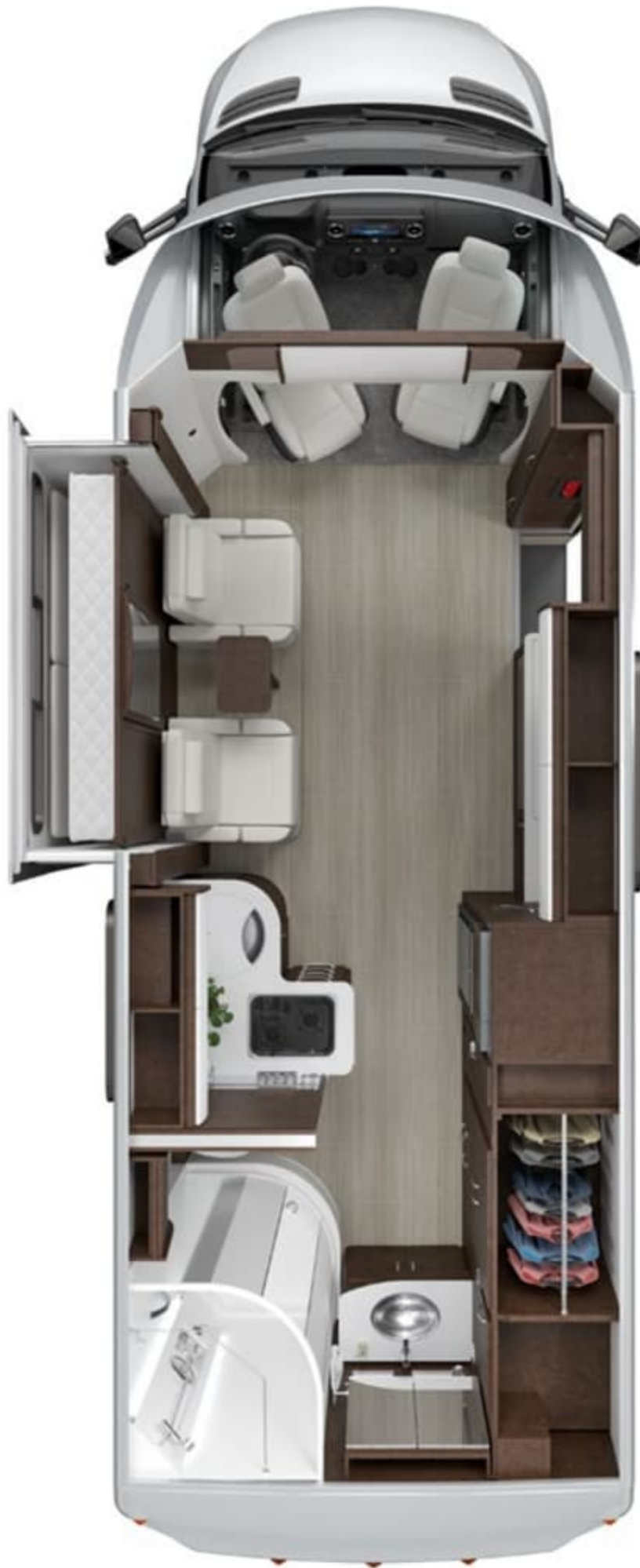
U24MB | Murphy Bed (Shown with optional Leisure Lounge Plus)