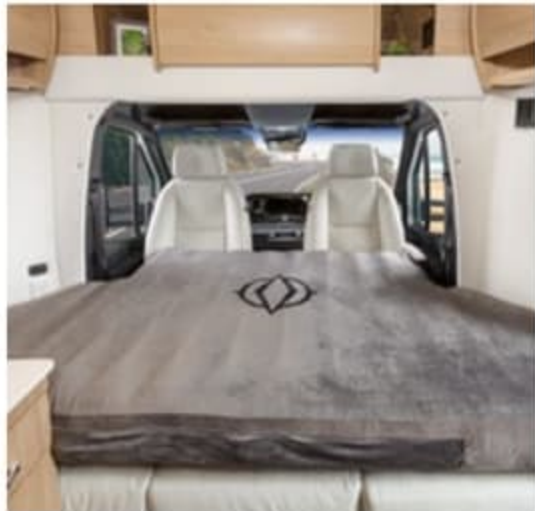
Inflatable Bed for Front Dinette 45" x 88" Sleeping Area (U24RL, U24IB, U24TB only)