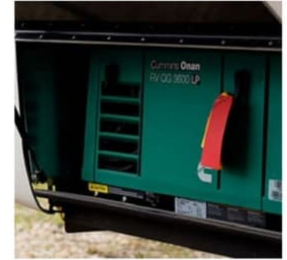
Generator – 3.6 KW LP c/w Auto Start and Auto Changeover Switch