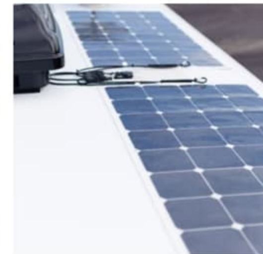
200 or 400W Flex Solar Panel Low Profile c/w Control Panel