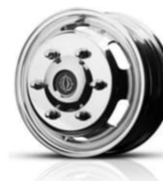
Optional Alcoa Dura-Bright® Aluminum Wheels All 6 Aluminum Wheels, 4 Dura-Bright® Wheels