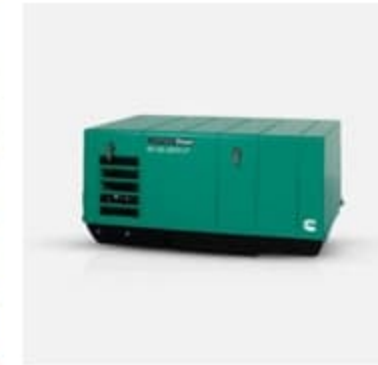
Generator – 3.2 KW Diesel c/w Auto Changeover Switch (Not available on U24RL)