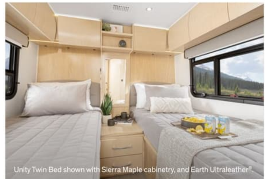
Unity Twin Bed shown with Sierra Maple cabinetry, and Earth Ultraleather®.