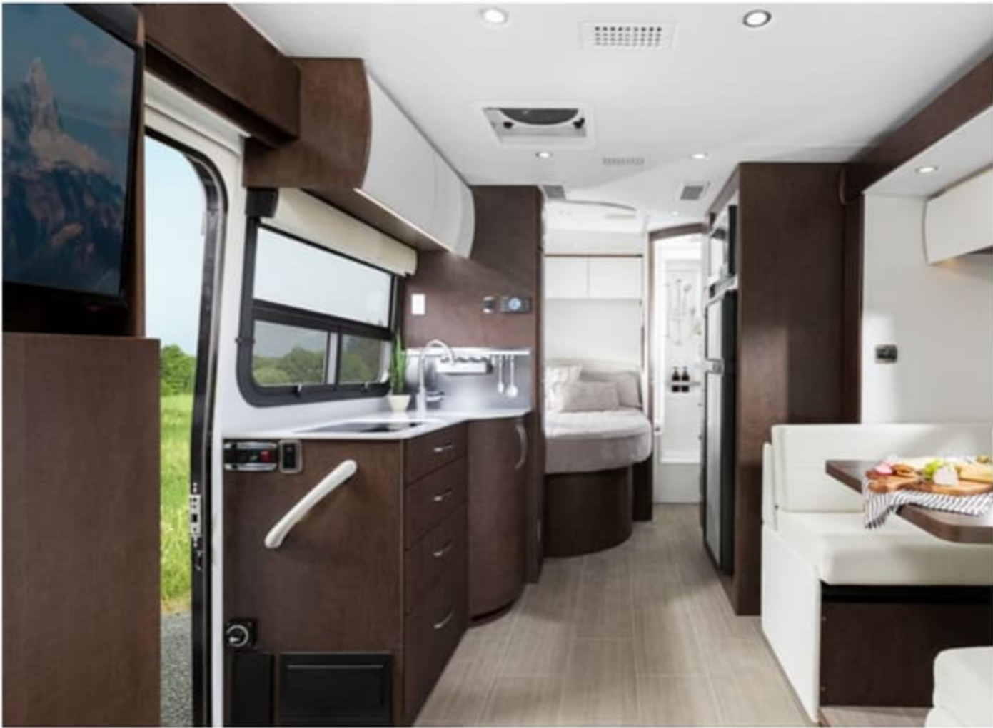
Espresso Brown Shown with Bianco White Overhead Cabinet Door Upgrade