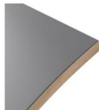
Grigio Shadow FENIX NTM®