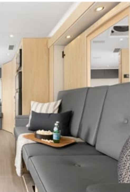
Cabinet Door Upgrade