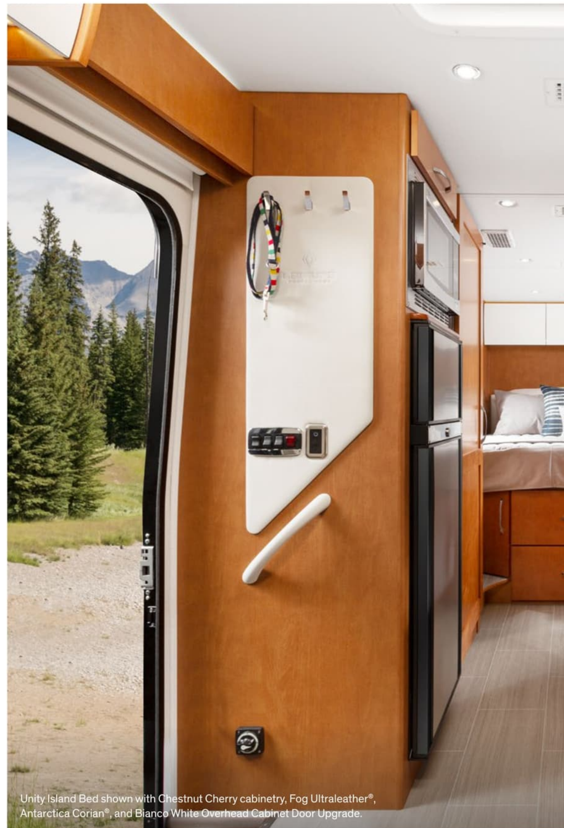
Unity Island Bed shown with Chestnut Cherry cabinetry, Fog Ultraleather®, Antarctica Corian®, and Bianco White Overhead Cabinet Door Upgrade.