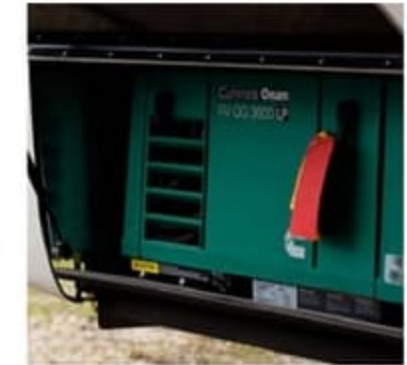
Generator – 3.6 KW LP c/w Auto Start and Auto Changeover Switch