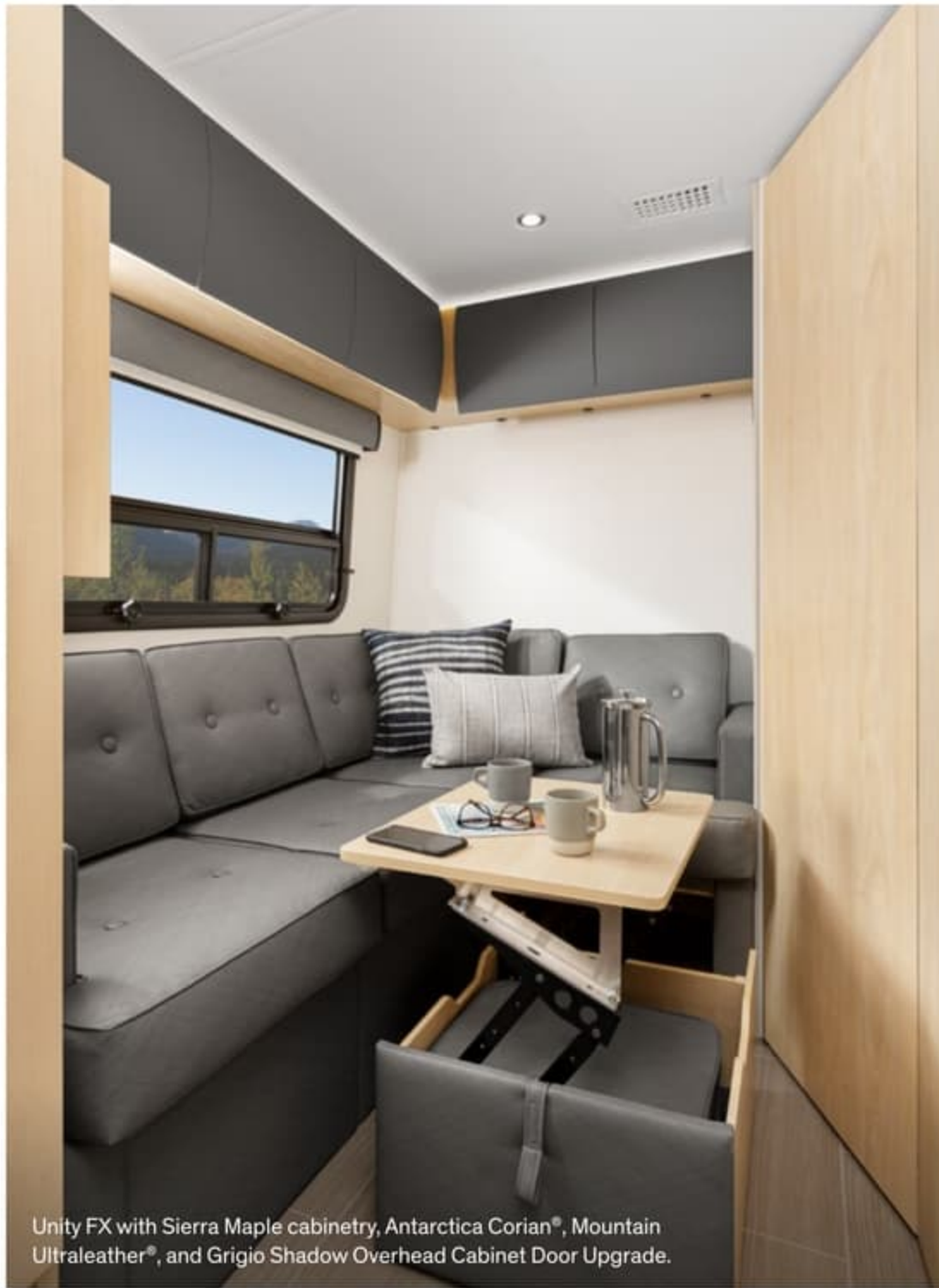
Unity FX with Sierra Maple cabinetry, Antarctica Corian®, Mountain Ultraleather®, and Grigio Shadow Overhead Cabinet Door Upgrade.