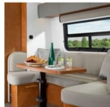
U-Lounge Dinette c/w Easy Lift Table, 40" x 69" Sleeping Area (U24CB only)