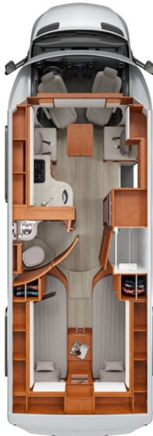
U24TB | Twin Bed