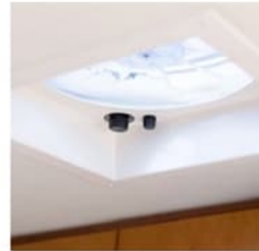
Fan Upgrade Thermal Controlled Fans with Rain Sensor in Galley & Lav (Not available on U24RL)