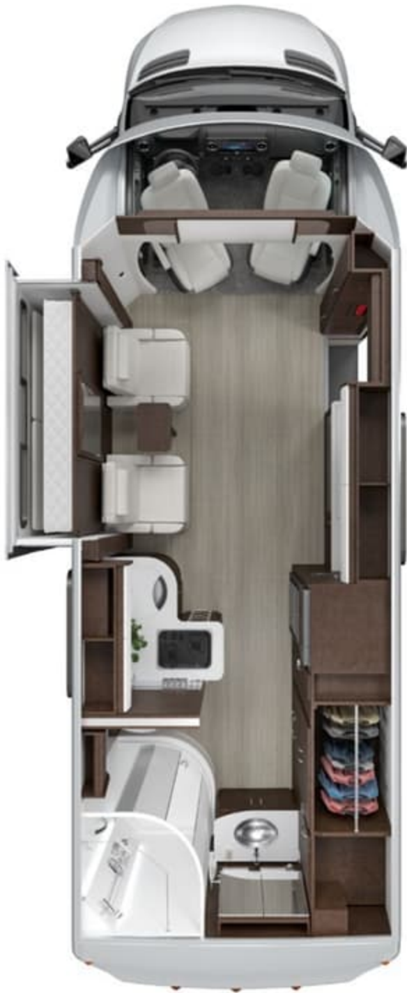
U24MB | Murphy Bed (Shown with optional Leisure Lounge Plus)