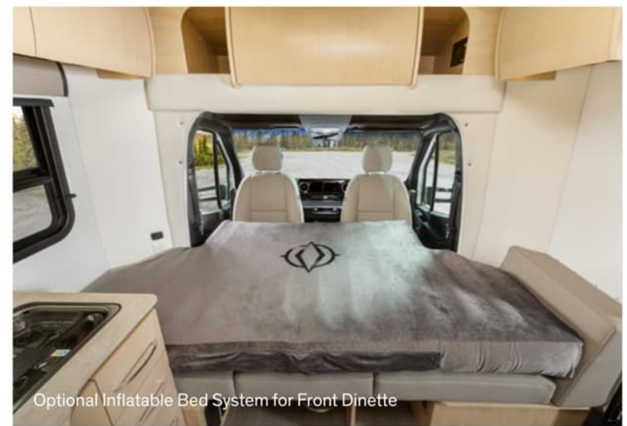
Optional Inflatable Bed System for Front Dinette