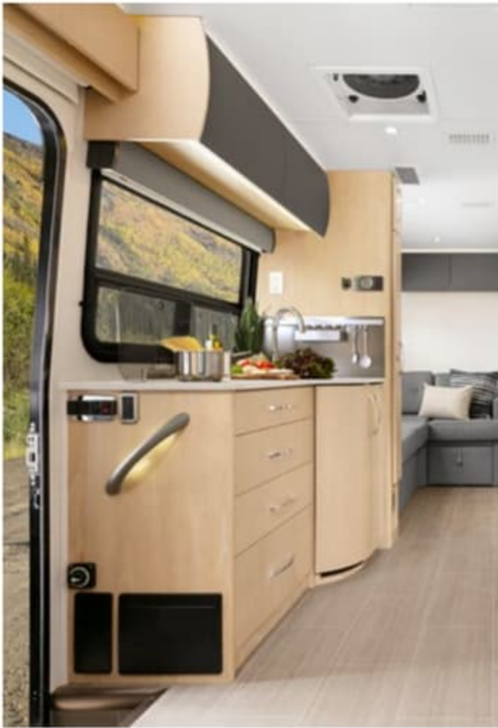
Sierra Maple Shown with Grigio Shadow Overhead Cabinet Door Upgrade