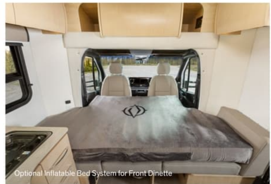
Optional Inflatable Bed System for Front Dinette