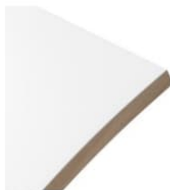
Bianco White FENIX NTM®