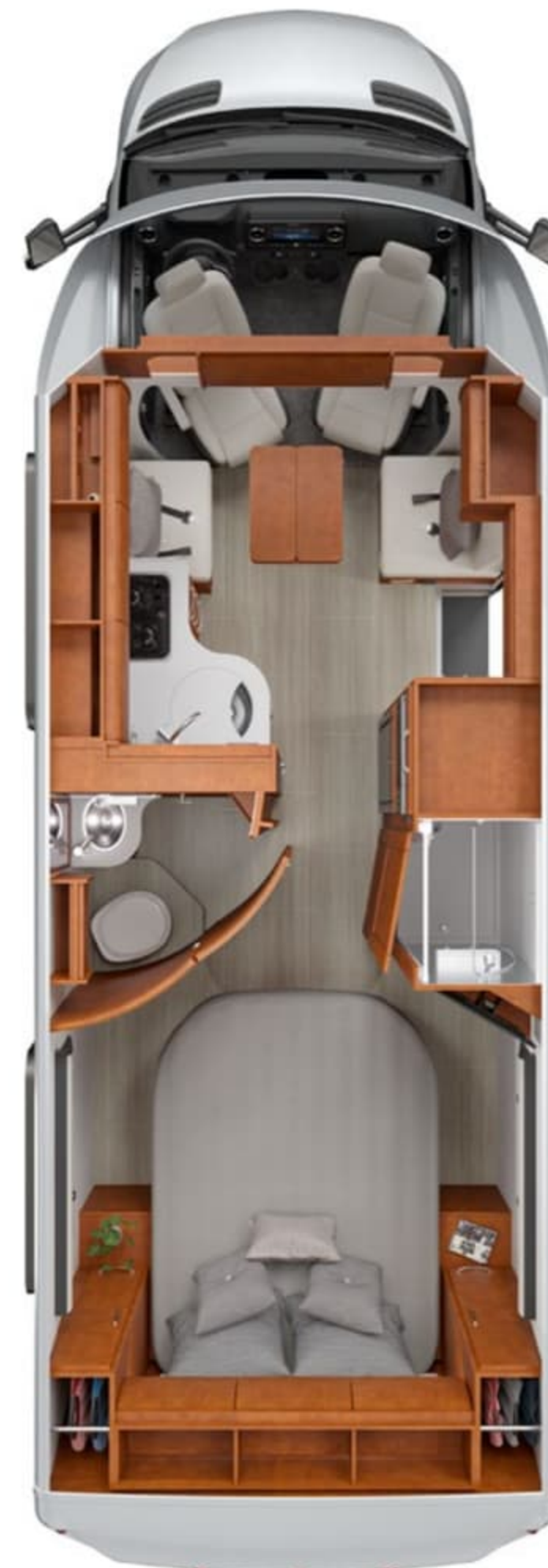
U24IB | Island Bed