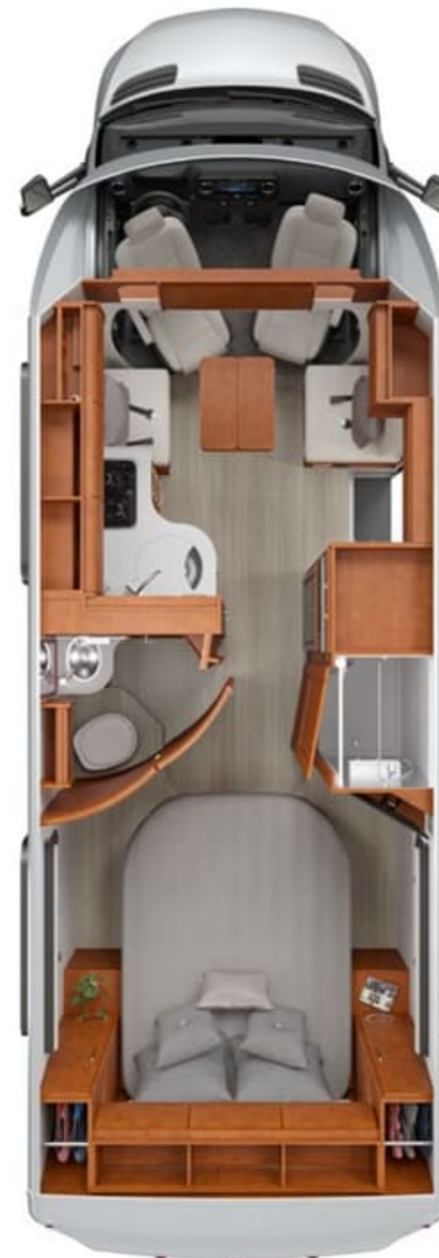
U24IB | Island Bed