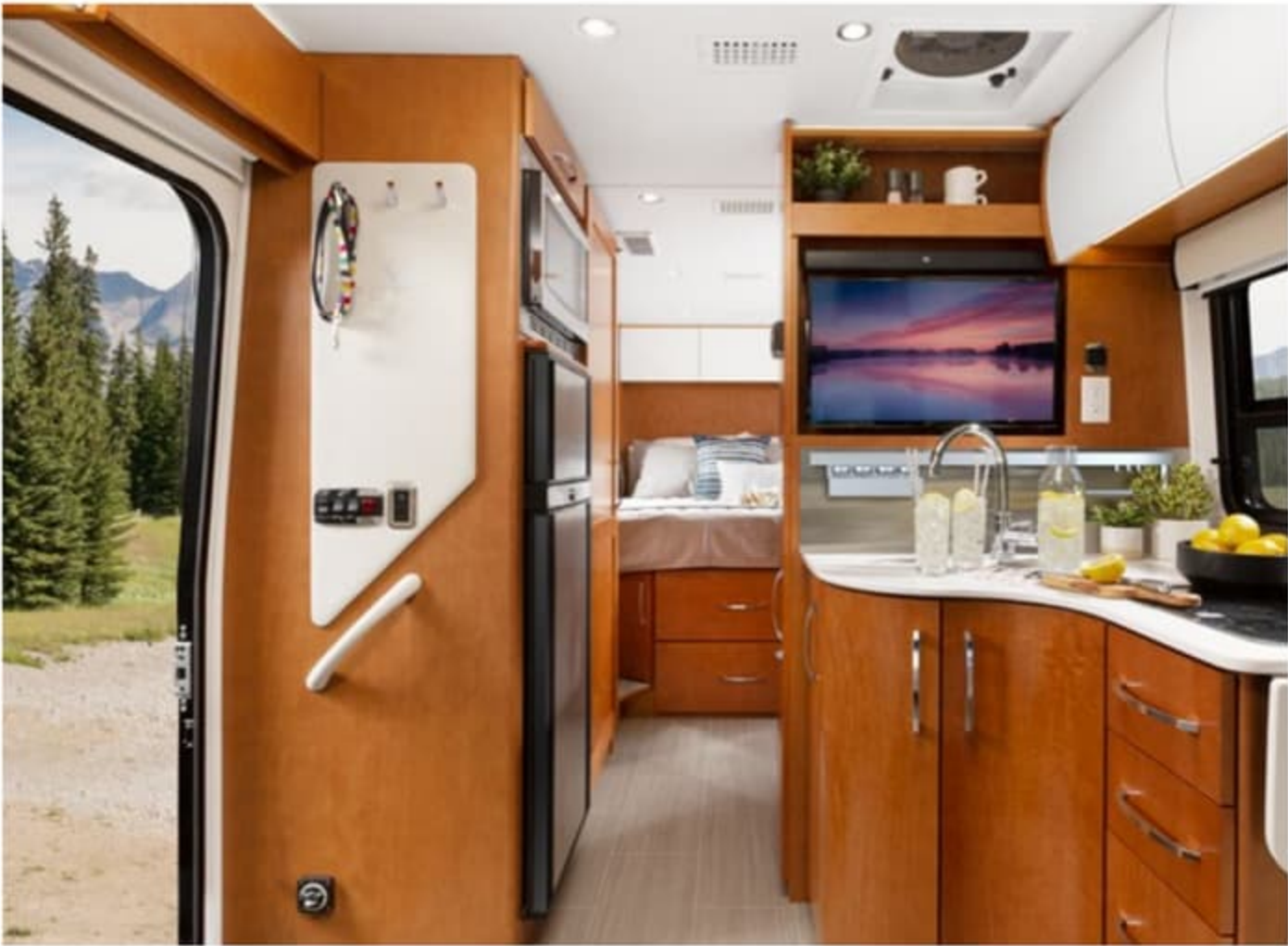
Chestnut Cherry Shown with Bianco White Overhead Cabinet Door Upgrade