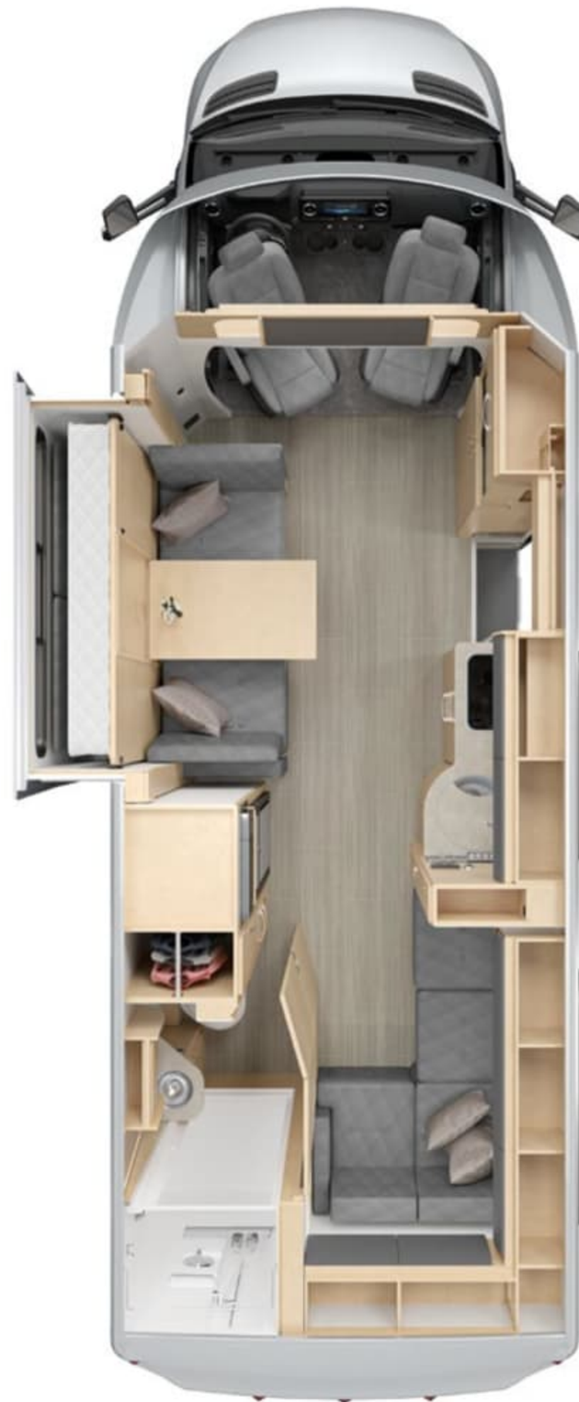
U24FX | FX