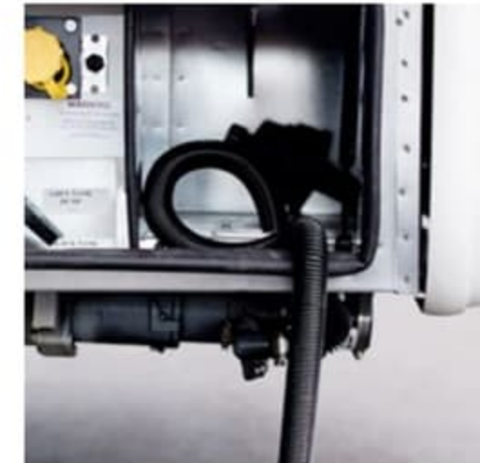
Macerator Sewage Discharge c/w Manual Disconnect