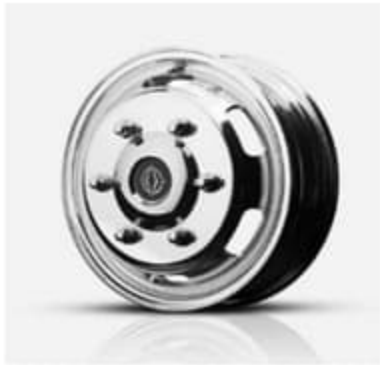
Alcoa Dura Bright® Aluminum Wheels 4 Wheels Dura-Bright®, All 6 Aluminum