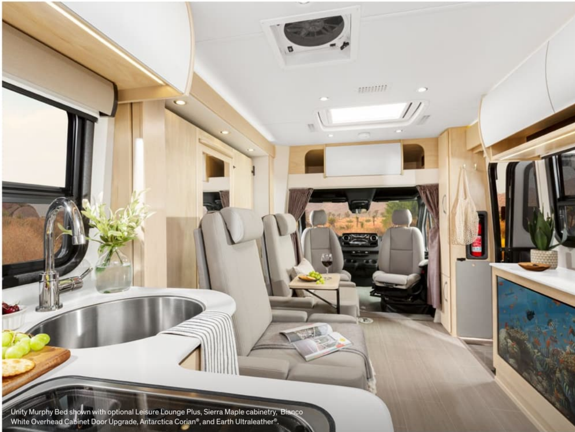
Unity Murphy Bed shown with optional Leisure Lounge Plus, Sierra Maple cabinetry, Bianco White Overhead Cabinet Door Upgrade, Antarctica Corian®, and Earth Ultraleather®.