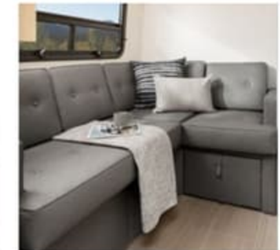
Rear Sofa Ultraleather® Upgrade c/w Hidden Table and Ottoman (U24FX only)