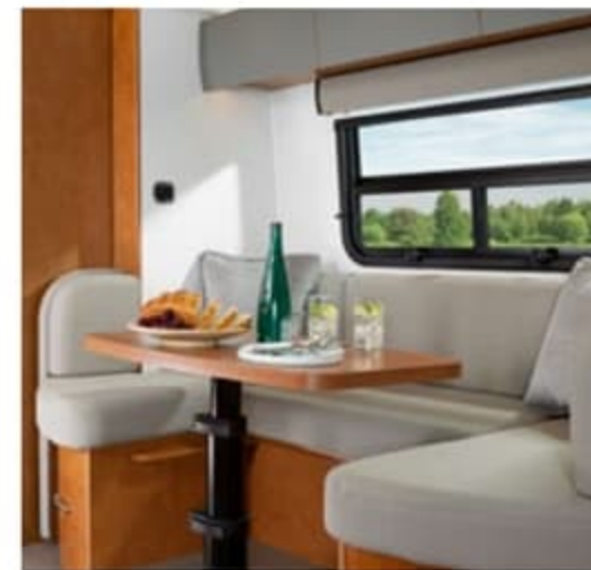
U-Lounge Dinette c/w Easy Lift Table, 40" x 69" Sleeping Area (U24CB only)