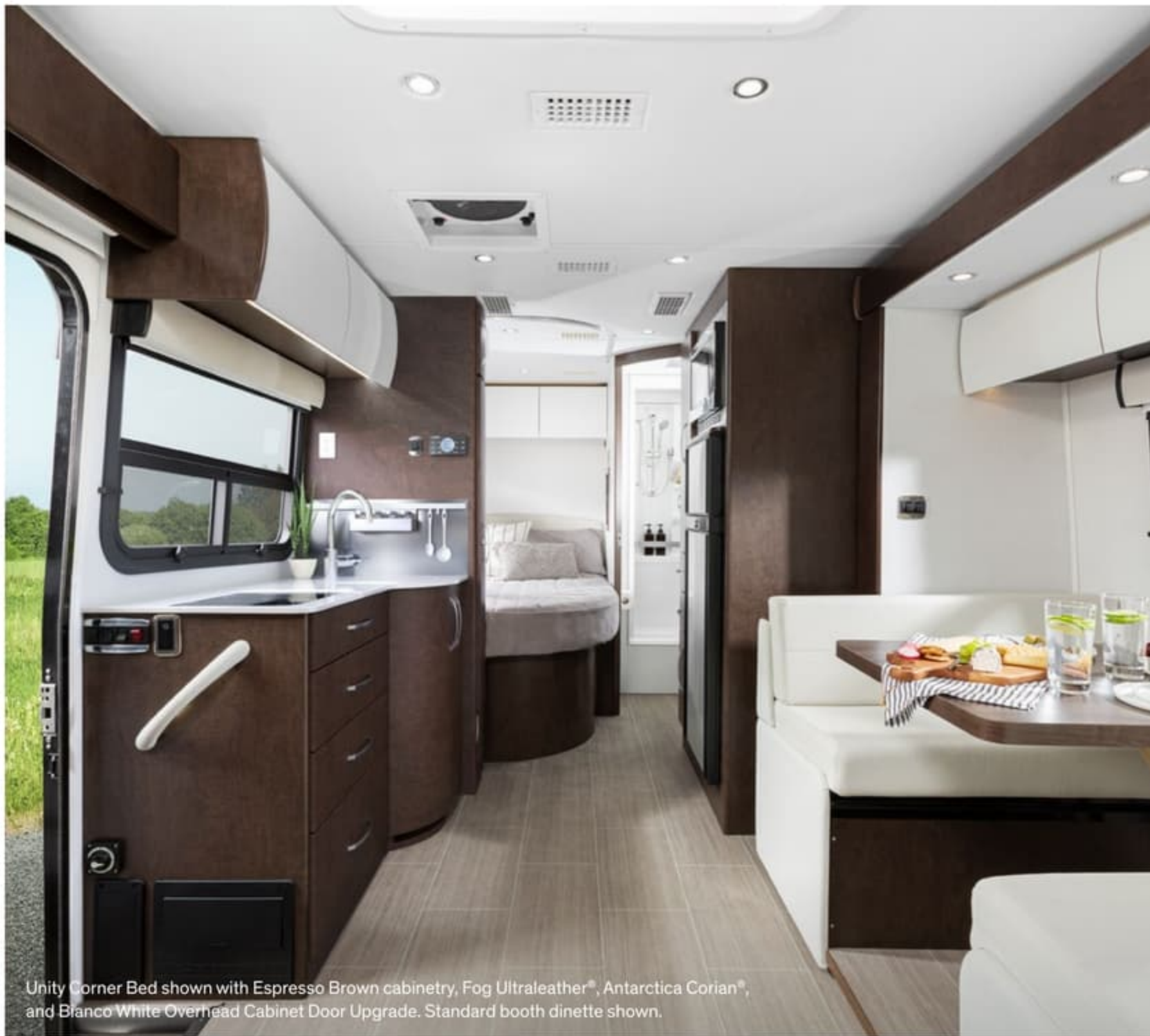
Unity Corner Bed shown with Espresso Brown cabinetry, Fog Ultraleather®, Antarctica Corian®, and Blanco White Overhead Cabinet Door Upgrade. Standard booth dinette shown.