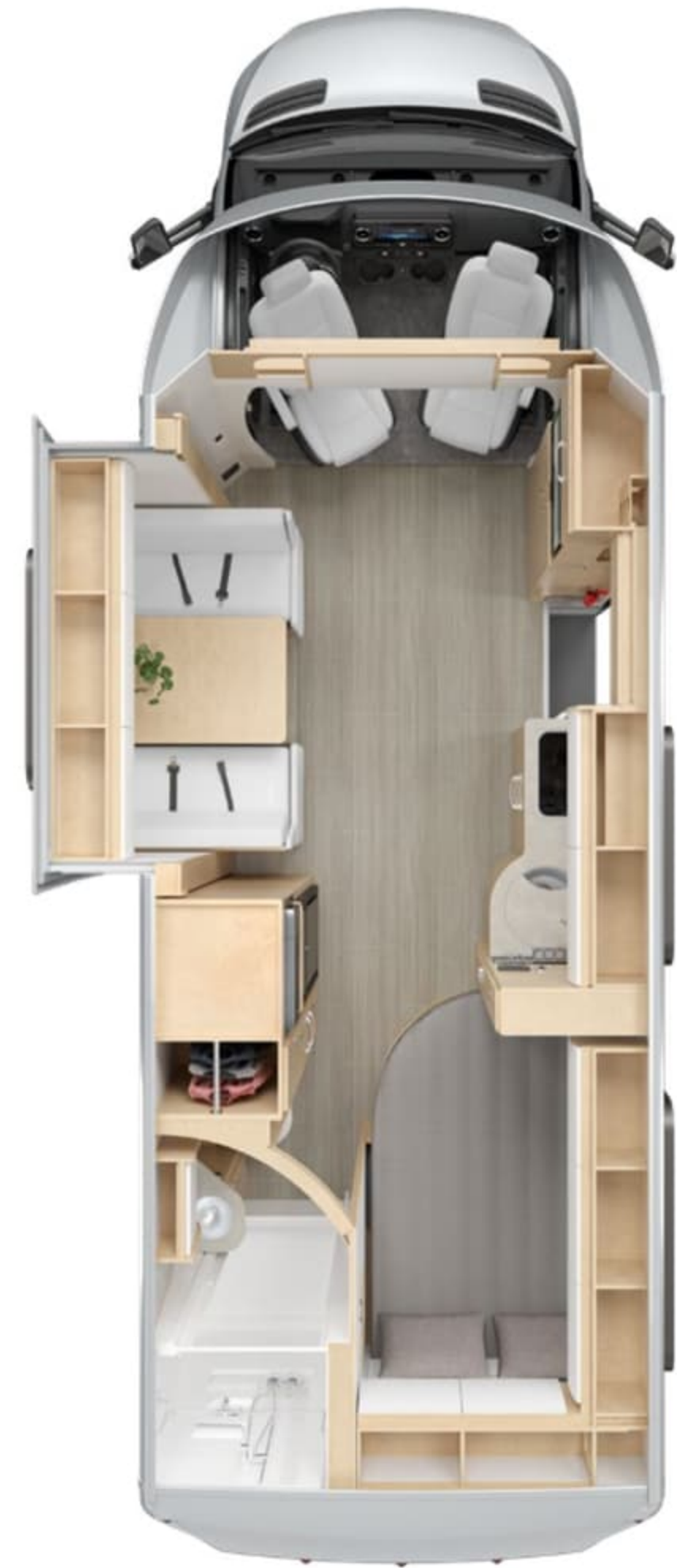
U24CB | Corner Bed (Shown with Standard Dinette)