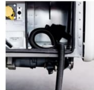
Macerator Sewage Discharge c/w Manual Disconnect