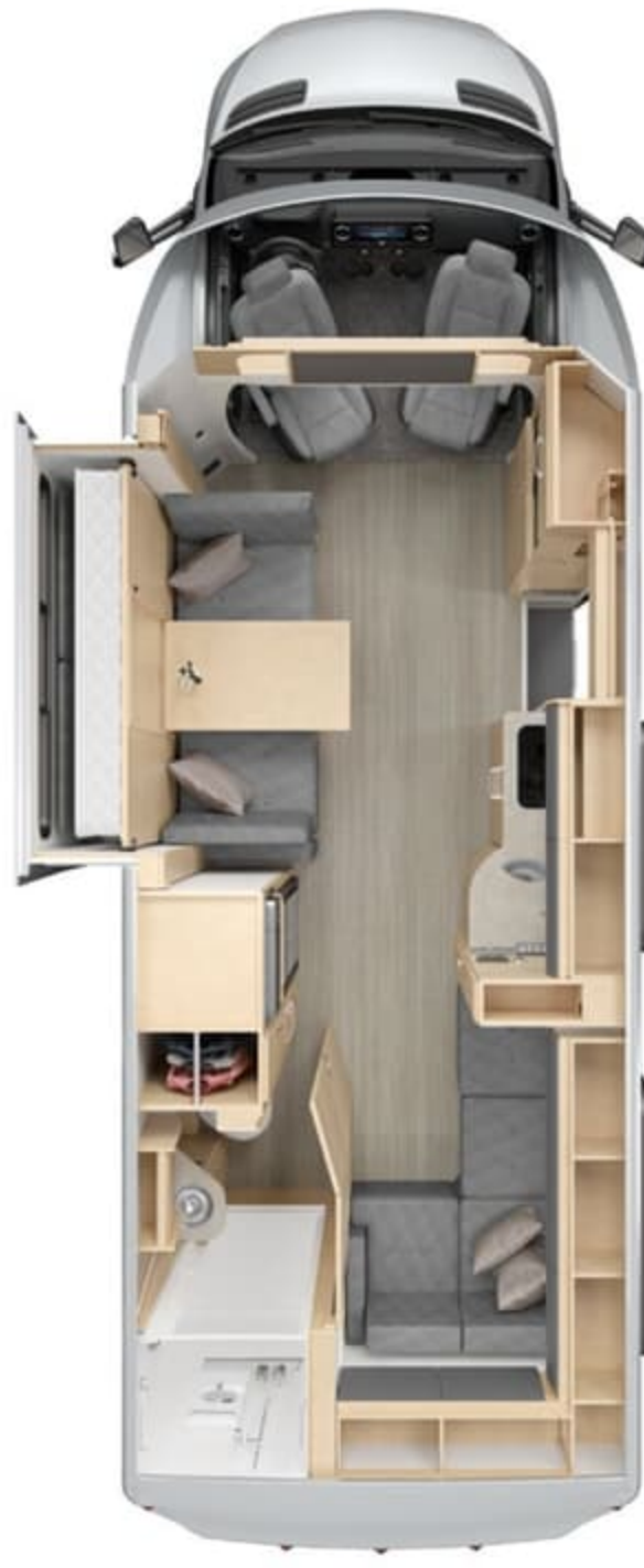
U24FX | FX