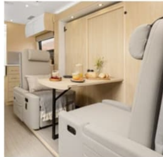
Leisure Lounge Plus Dinette c/w 2 Rotating Power Recliners (U24MB only)