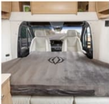
Inflatable Bed for Front Dinette 45" x 88" Sleeping Area (U24RL, U24IB, U24TB only)