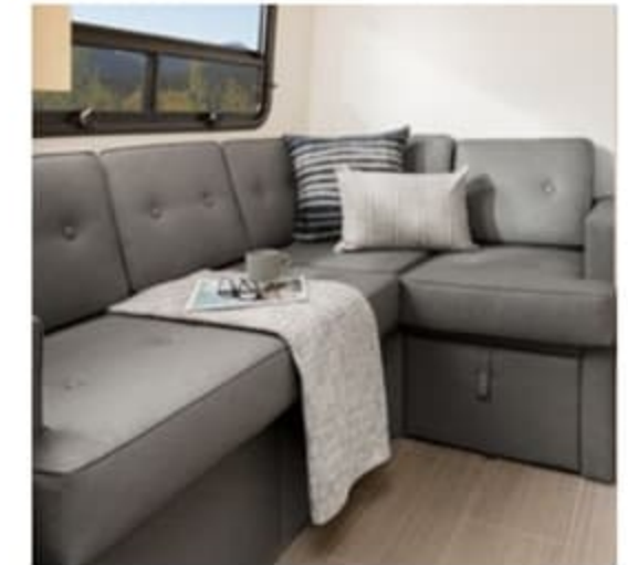
Rear Sofa Ultraleather® Upgrade c/w Hidden Table and Ottoman (U24FX only)