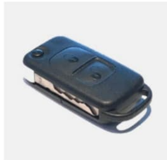
Keyless Entrance Door