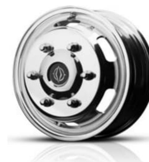
Optional Alcoa Dura-Bright® Aluminum Wheels All 6 Aluminum Wheels, 4 Dura-Bright® Wheels