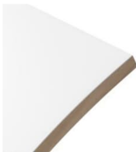
Bianco White FENIX NTM®