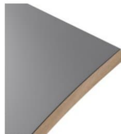
Grigio Shadow FENIX NTM®