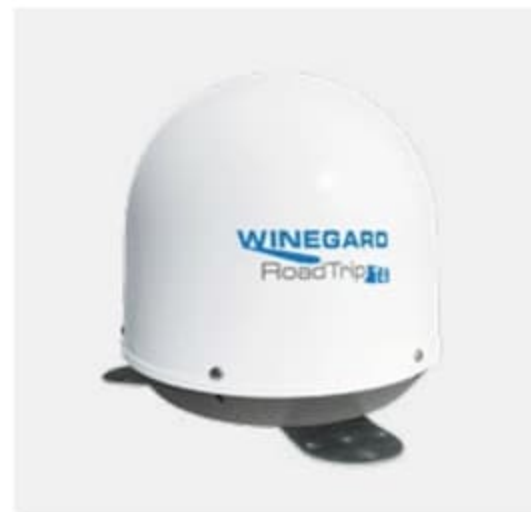
Satellite Dish Auto Acquisition