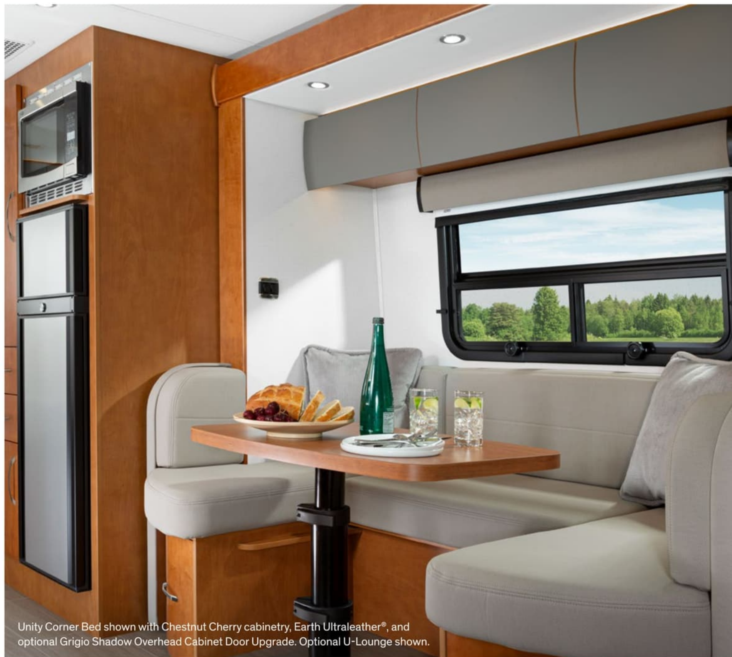
Unity Corner Bed shown with Chestnut Cherry cabinetry, Earth Ultraleather®, and optional Grigio Shadow Overhead Cabinet Door Upgrade. Optional U-Lounge shown.