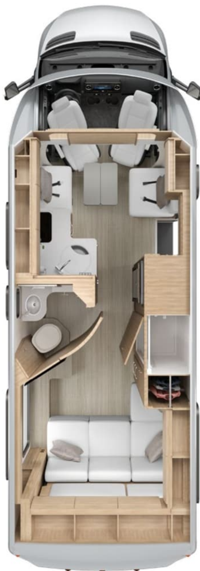
U24RL | Rear Lounge