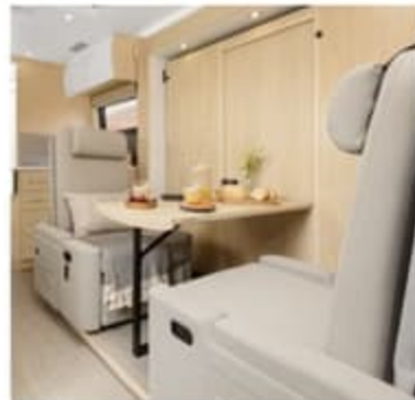
Leisure Lounge Plus Dinette c/w 2 Rotating Power Recliners (U24MB only)