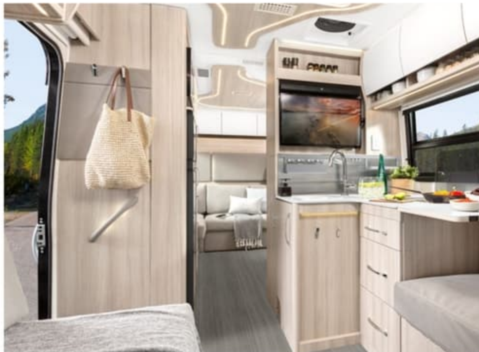
Cashmere (Exclusive to the Unity Rear Lounge) Shown with Bianco White Overhead Cabinet Door Upgrade