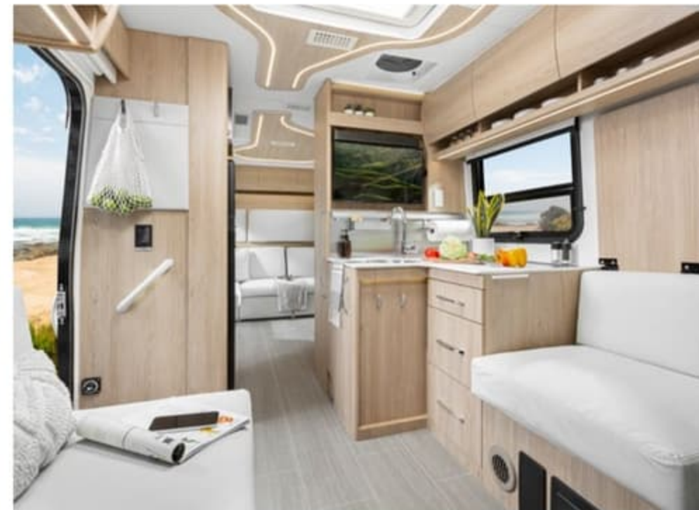
Natural Rift (Exclusive to the Unity Rear Lounge)