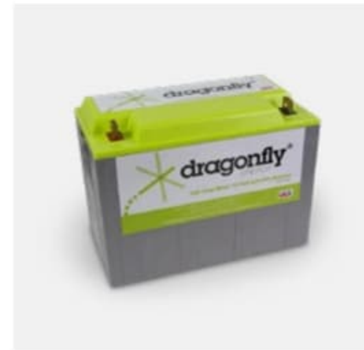
Lithium Coach Batteries Dual 12V Batteries