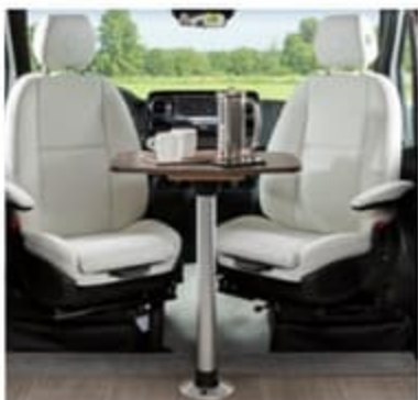
Removable Front Table Between Captain Chairs (U24CB, U24MB & U24FX only)