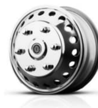
Standard Steel Wheels With Wheel Simulators