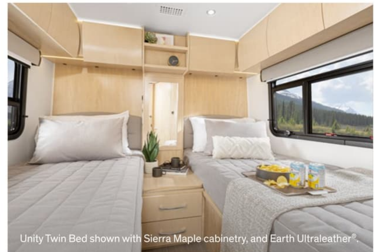
Unity Twin Bed shown with Sierra Maple cabinetry, and Earth Ultraleather®.