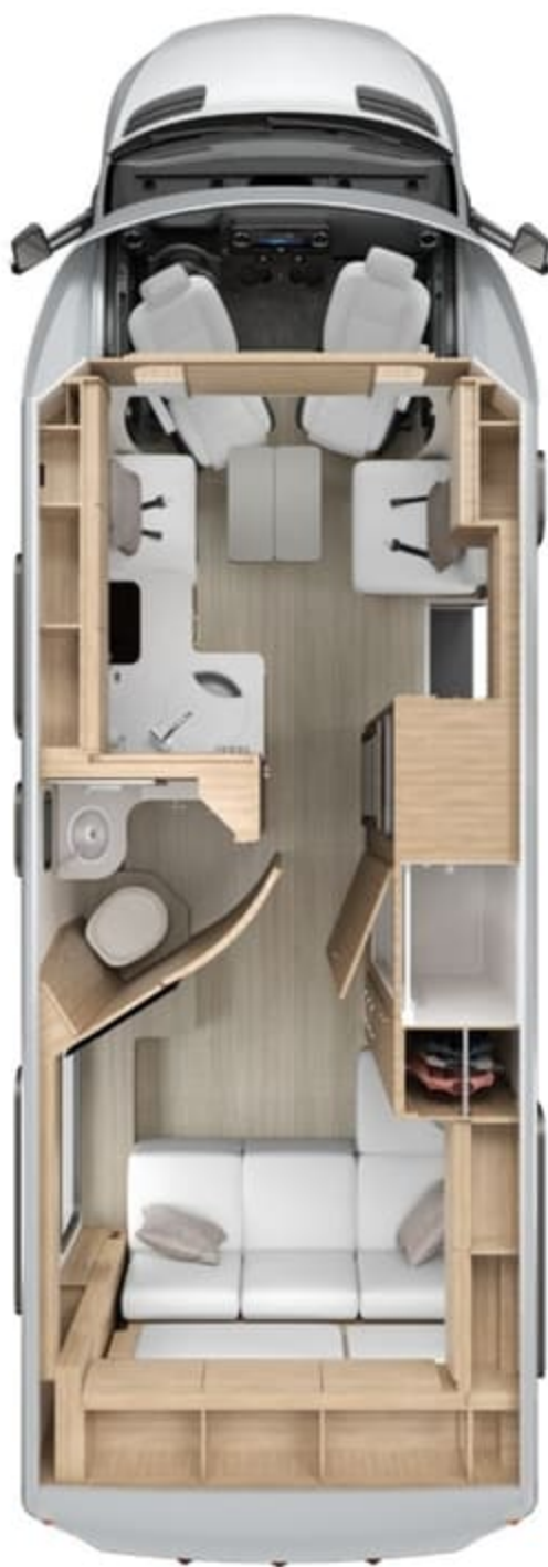
U24RL | Rear Lounge