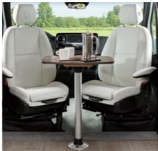
Removable Front Table Between Captain Chairs (U24CB, U24MB & U24FX only)