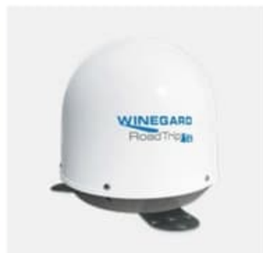
Satellite Dish Auto Acquisition