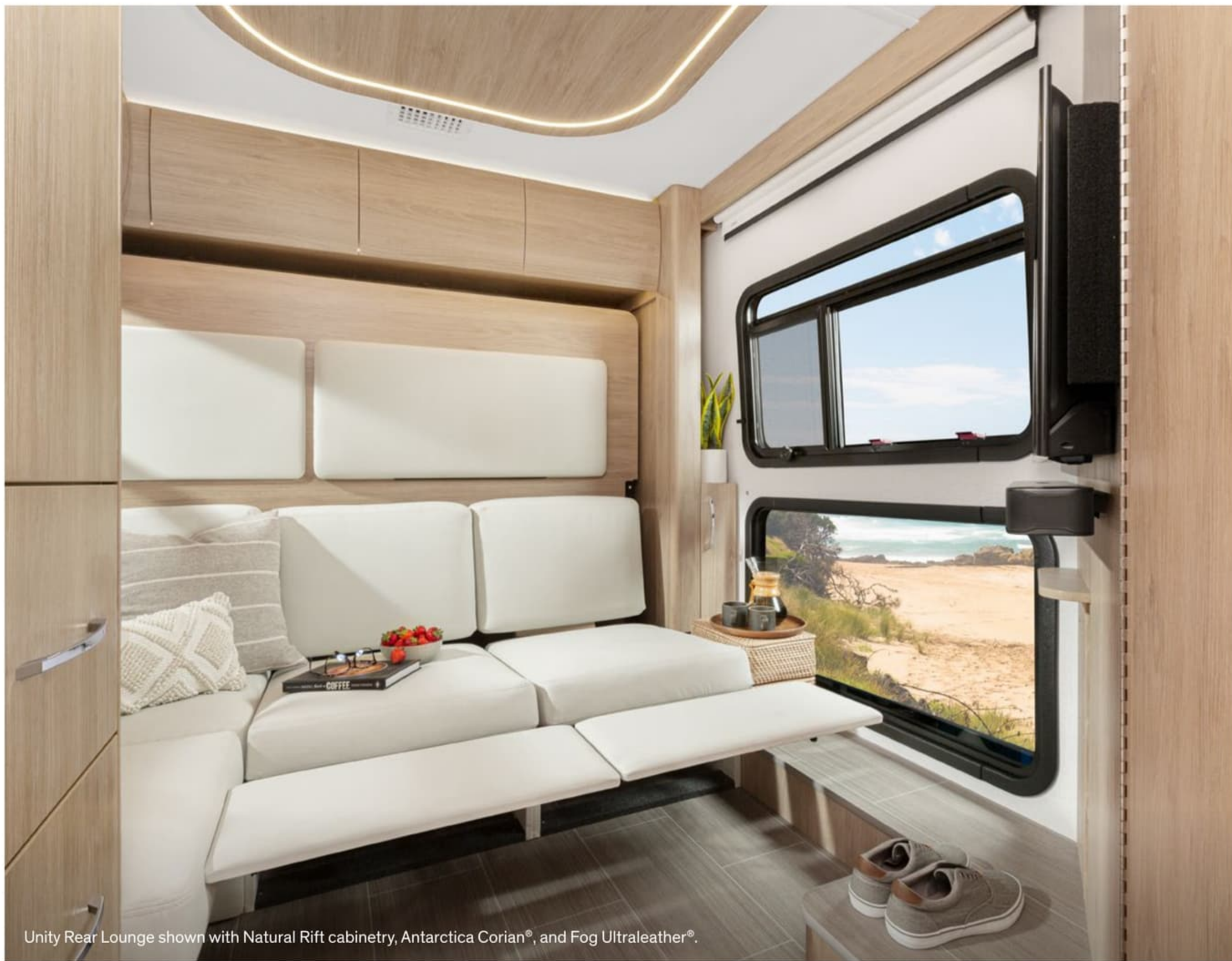
Unity Rear Lounge shown with Natural Rift cabinetry, Antarctica Corian®, and Fog Ultraleather®.