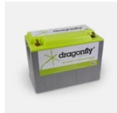
Lithium Coach Batteries Dual 12V Batteries