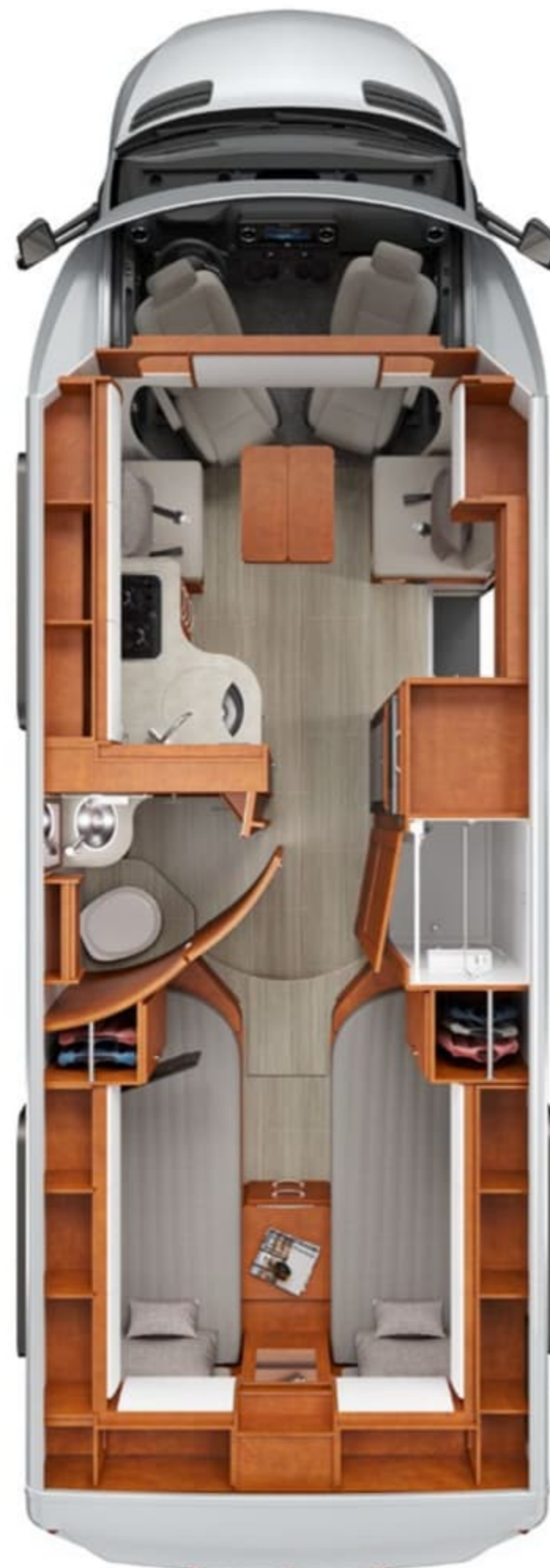
U24TB | Twin Bed