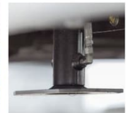
4-Point Self-Leveling Jacks