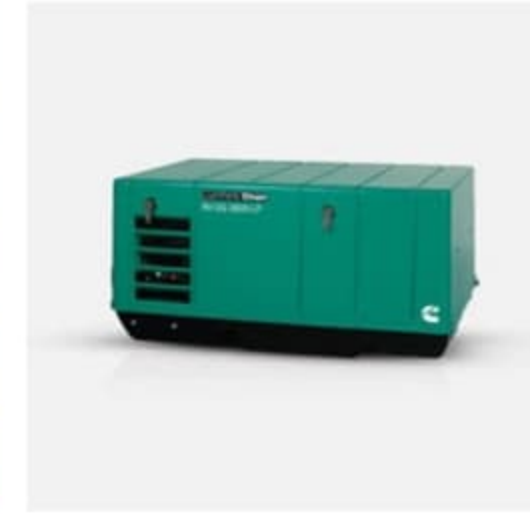
Generator – 3.2 KW Diesel c/w Auto Changeover Switch (Not available on U24RL)