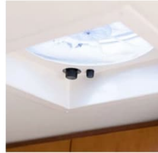
Fan Upgrade Thermal Controlled Fans with Rain Sensor in Galley & Lav (Not available on U24RL)