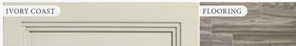
OPTIONAL HOME COLLECTION