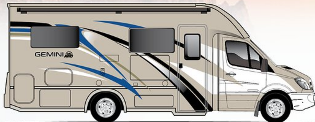
ELECTRIC BLUE QHD-MAX