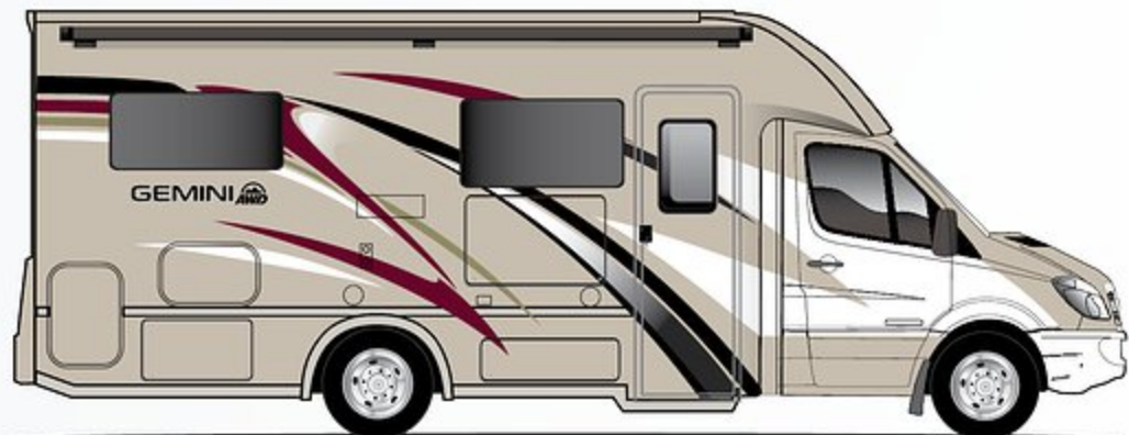
SEMINOLE RED QHD-MAX