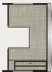
Cab Over Bunk