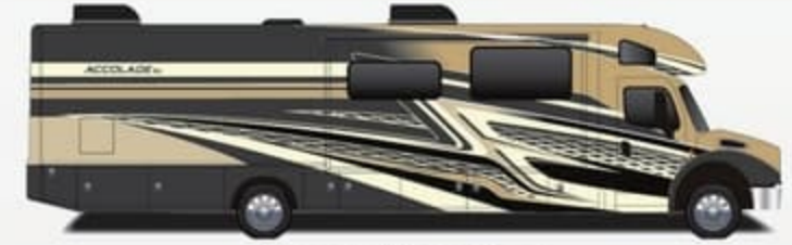
Beige Lightning Paint