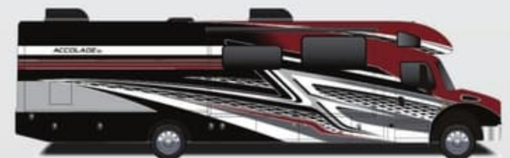
Red Lightning Paint