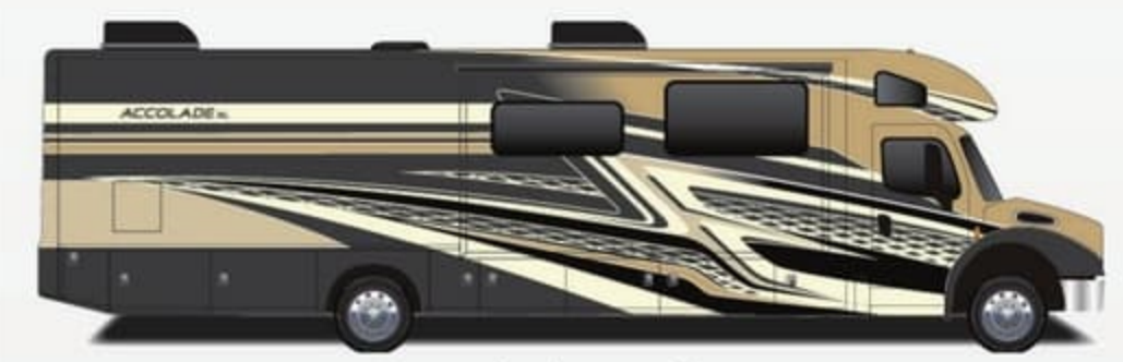
Beige Lightning Paint