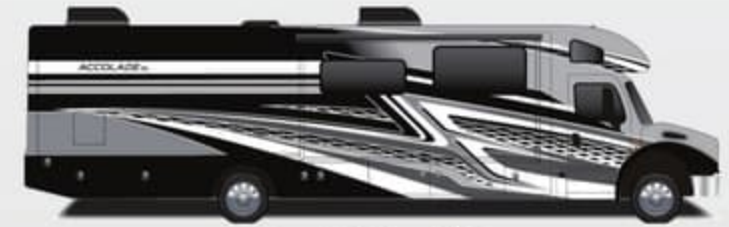
Grey Lightning Paint