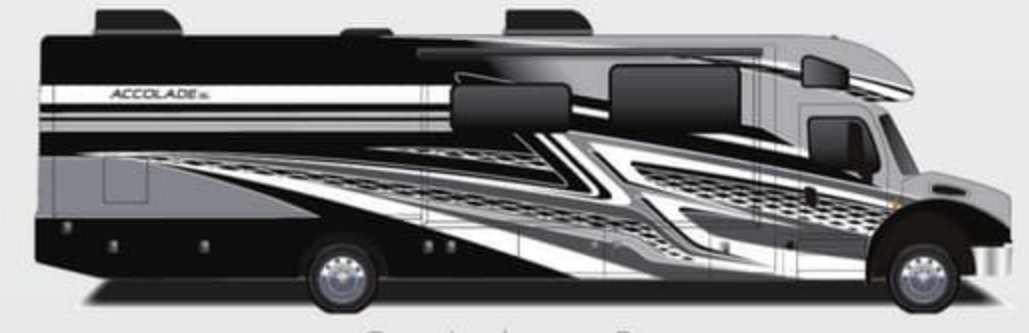
Grey Lightning Paint