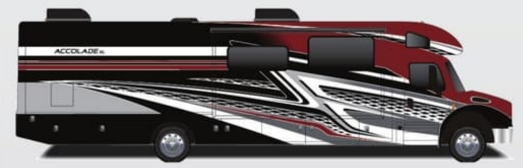
Red Lightning Paint