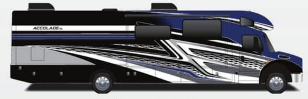
Blue Lightning Paint