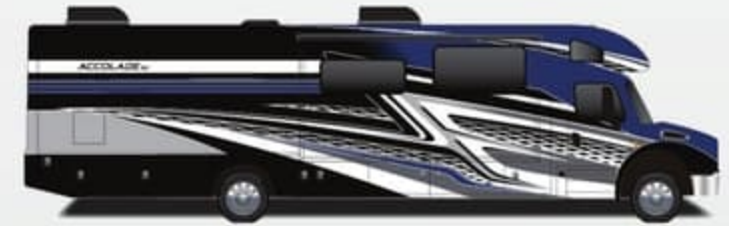
Blue Lightning Paint