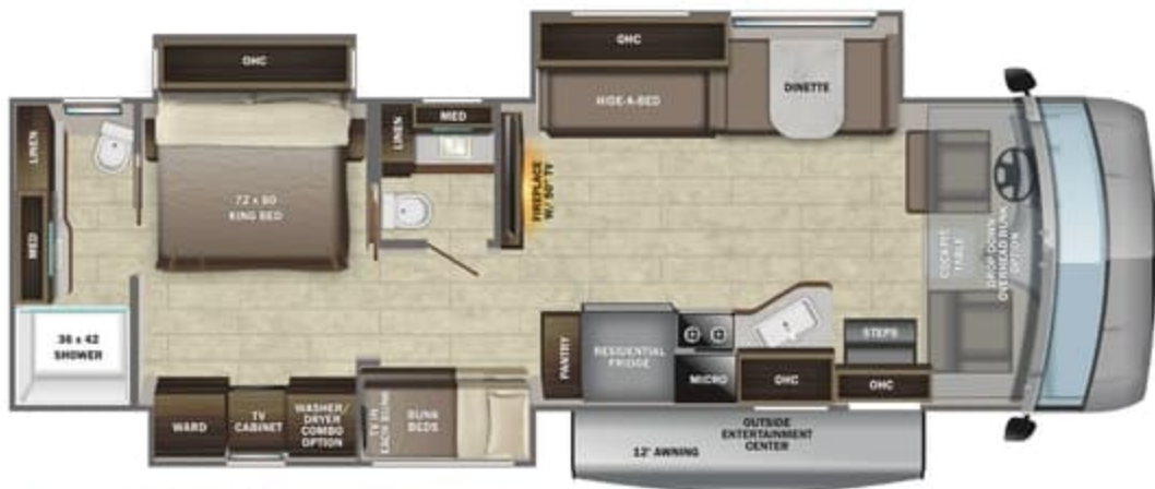
36T OPTIONS C AND E