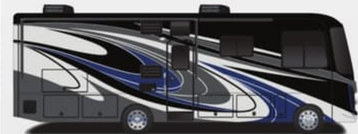
Juniper Full-Body Paint