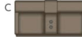
Theater Sofa Option