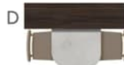
Freestanding Dinette Option