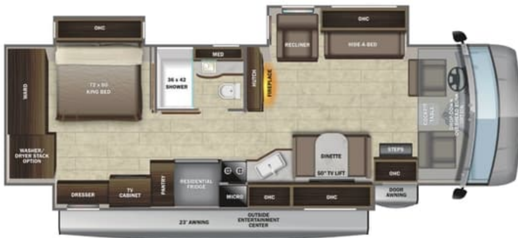
36H OPTIONS A, C AND E