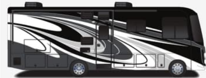
Black Walnut Full-Body Paint