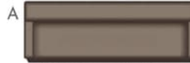
120" Reclining Sofa Option