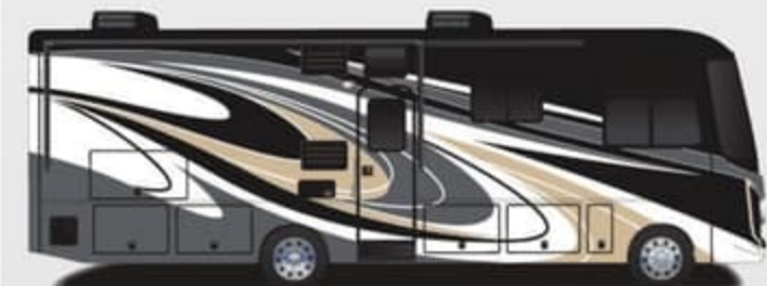
Salak Full-Body Paint