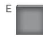
12 Cu. Ft. Fridge Option