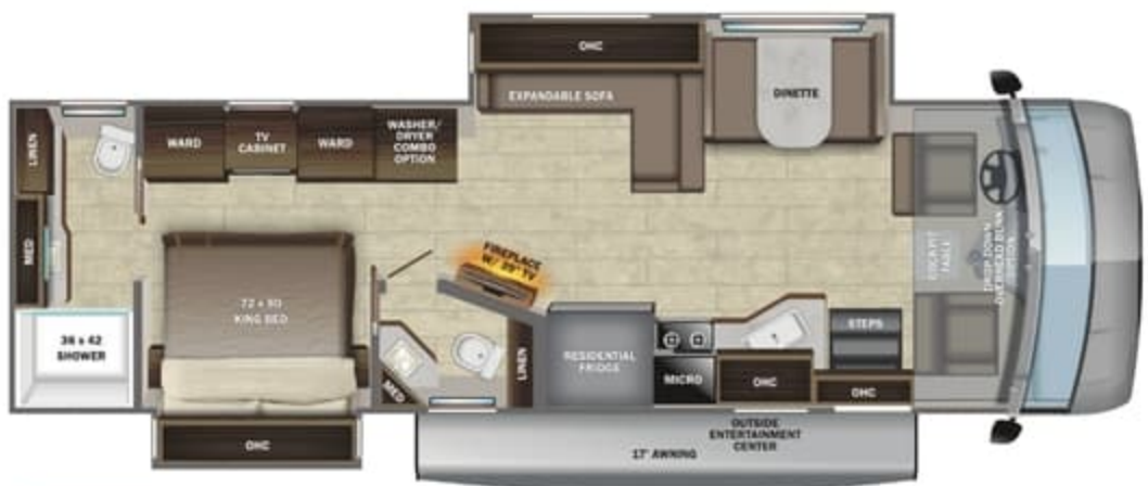
36U OPTIONS B, D AND E