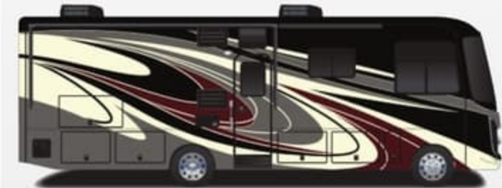
Cloudberry Full-Body Paint