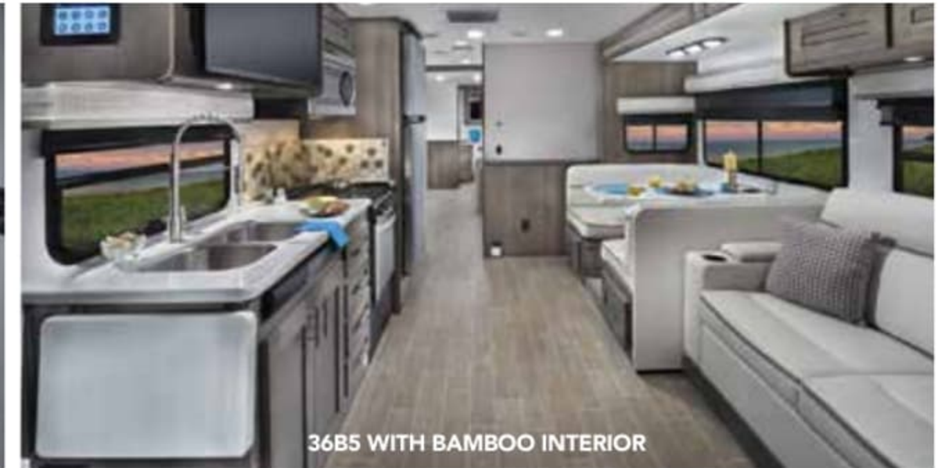
36B5 WITH BAMBOO INTERIOR