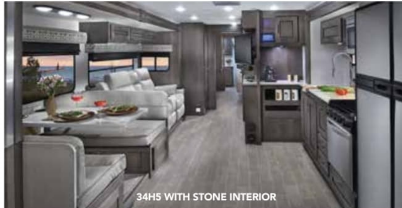
34H5 WITH STONE INTERIOR