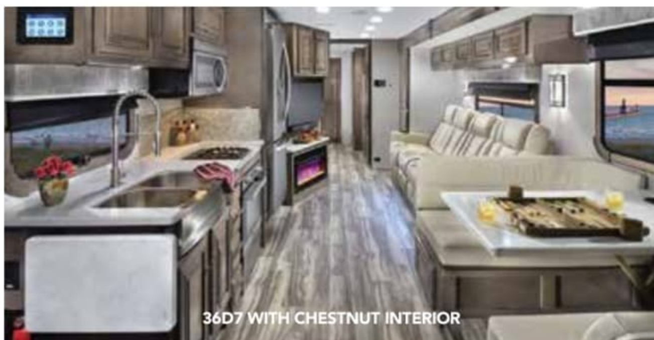
36D7 WITH CHESTNUT INTERIOR