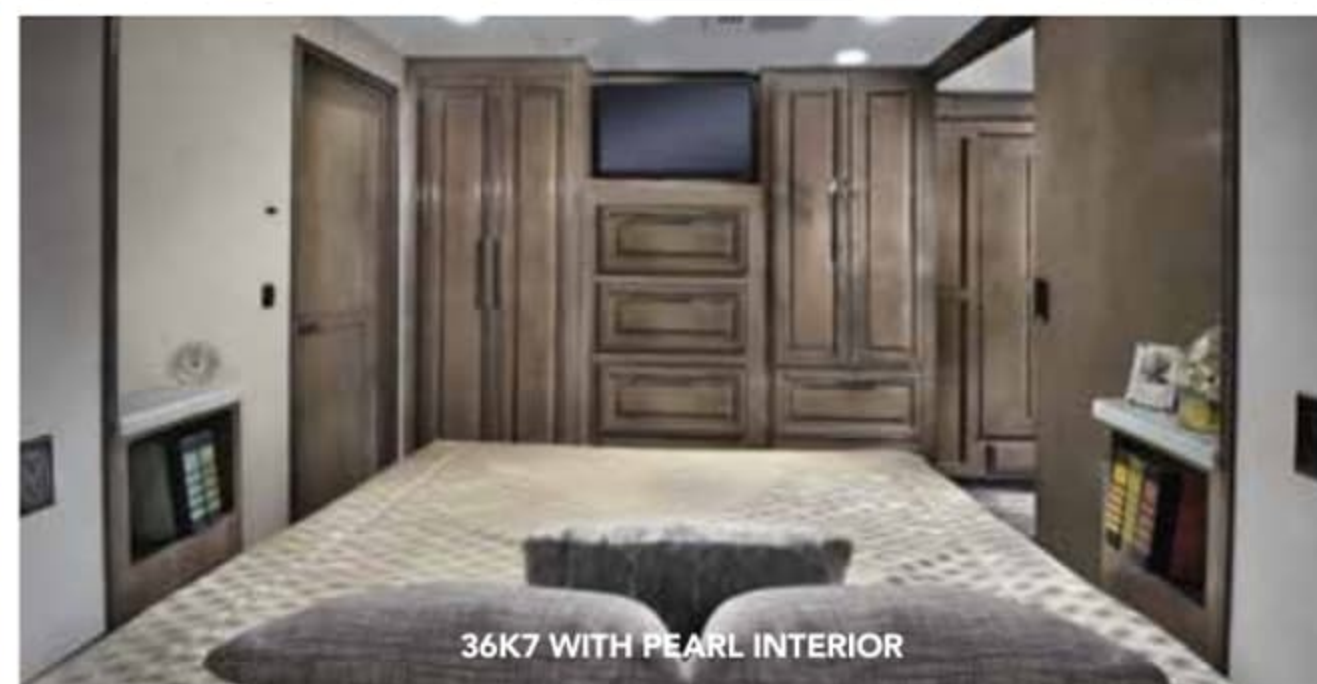
36K7 WITH PEARL INTERIOR