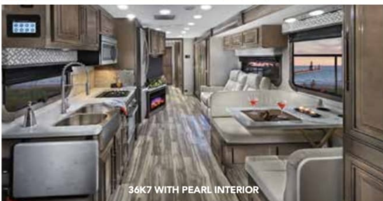
36K7 WITH PEARL INTERIOR