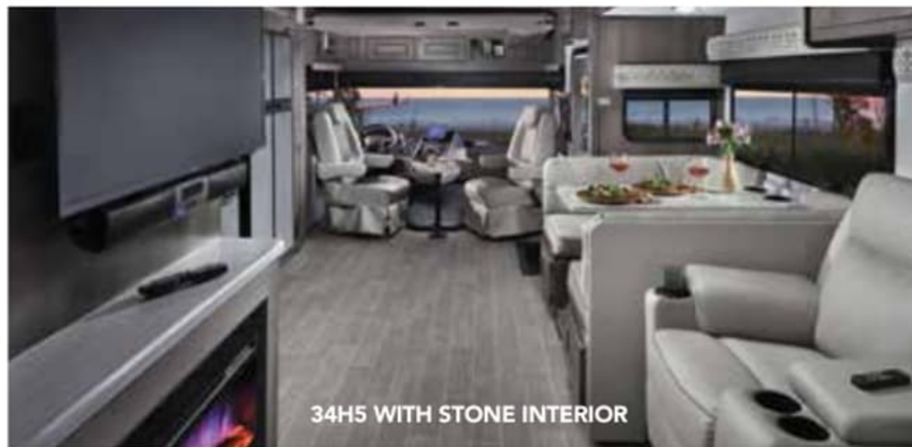
34H5 WITH STONE INTERIOR