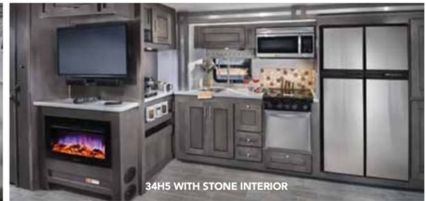
34H5 WITH STONE INTERIOR