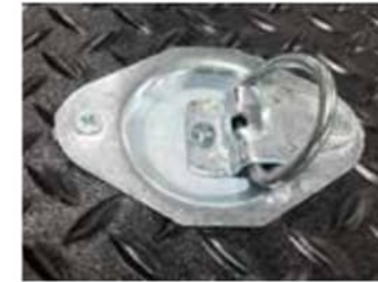
Secure Tie Downs