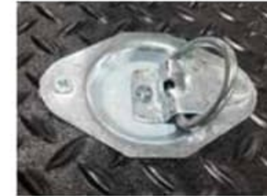
Secure Tie Downs