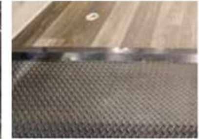
Durable Diamond Floors