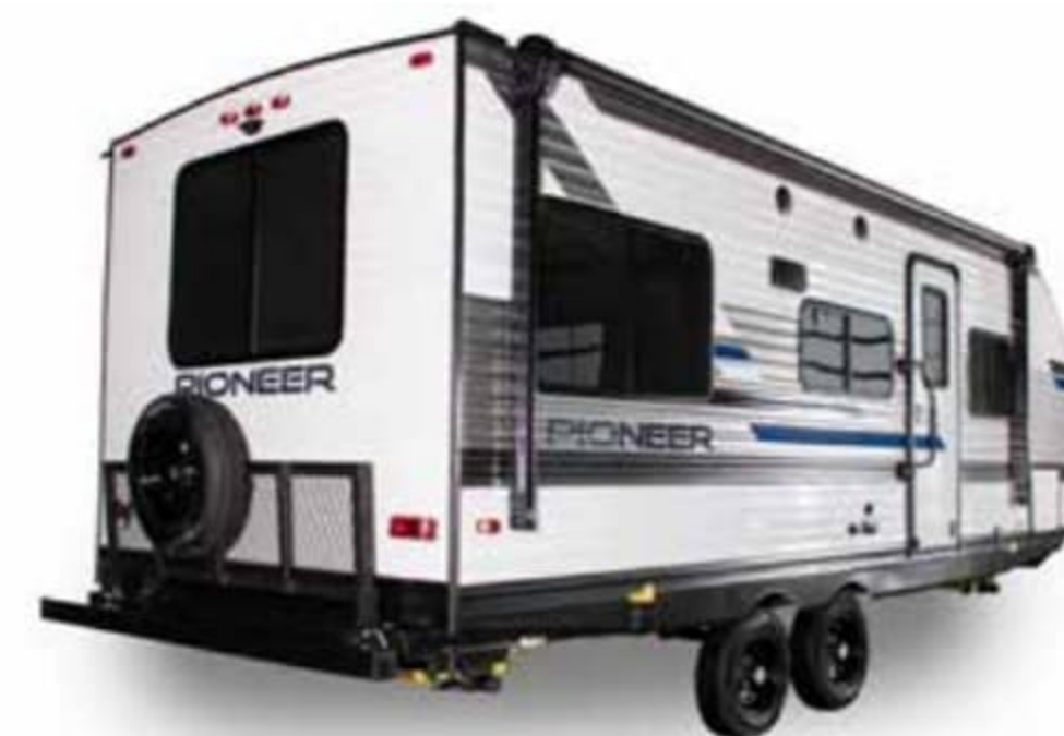
SPECIAL FEATURE - Flip Down Storage Rack