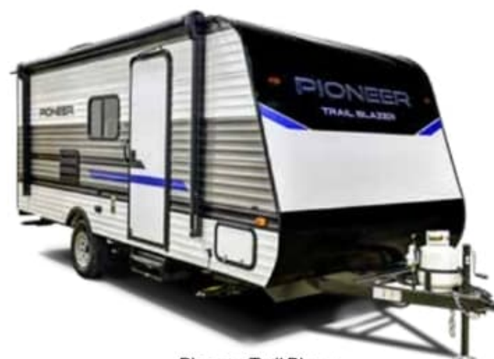
Pioneer Trail Blazer (BH170, SS171, BH185) Single Axle Unit