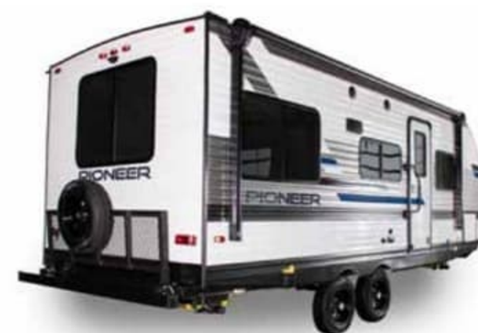
SPECIAL FEATURE - Flip Down Storage Rack