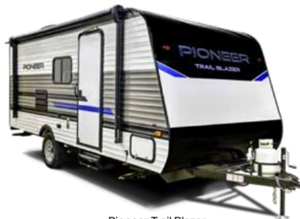
Pioneer Trail Blazer (BH170, SS171, BH185) Single Axle Unit