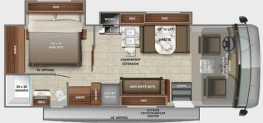
27A OPTIONS: A