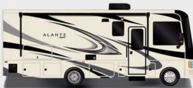
Standard Graphics Package