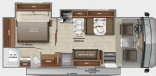
27A OPTIONS: A