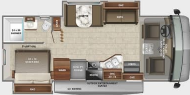
26X OPTIONS: C