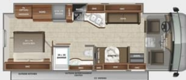
29S OPTIONS: A, B