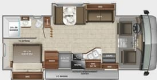
26X OPTIONS: C