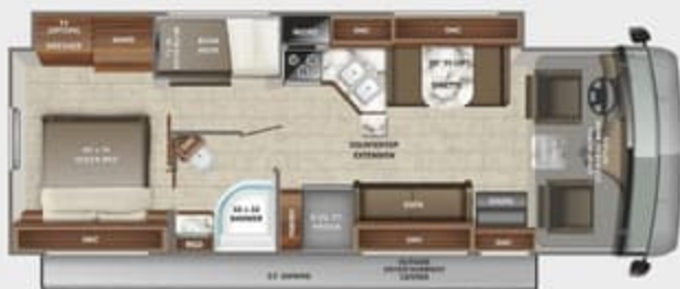
29F OPTIONS: A