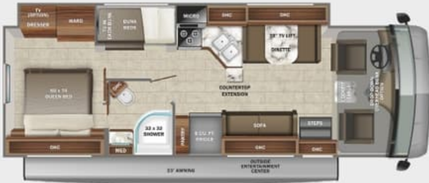
29F OPTIONS: A