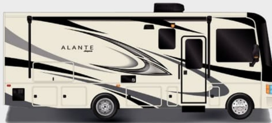
Standard Graphics Package