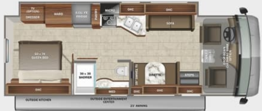
29S OPTIONS: A, B