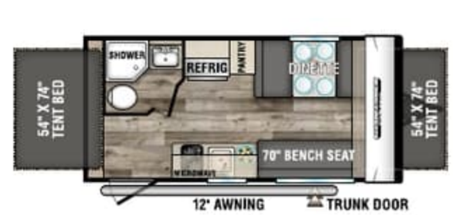
160RBT UVW - 2,740 | Exterior Length - 19' 2" | Sleeps - 6