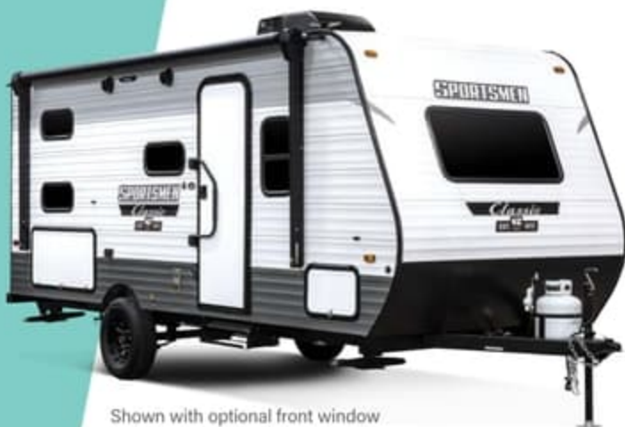
Shown with optional front window

Sportsmen Classic is true to its name. It has been a customer favorite for decades, and there is no question as to why. Sportsmen Classic offers standard features fit to equip you and your family to explore the great outdoors together!