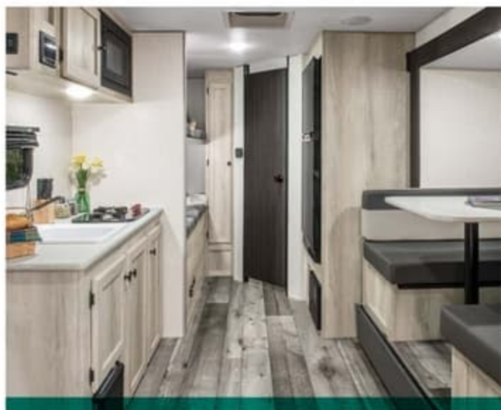
191BHK | Ashwood décor

Sportsmen Classic is true to its name. It has been a customer favorite for decades, and there is no question as to why. Sportsmen Classic offers standard features fit to equip you and your family to explore the great outdoors together!