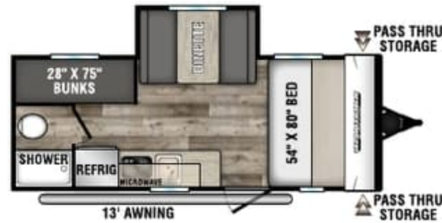
181BH UVW - 2,980 | Exterior Length - 21' 5" | Sleeps - 5