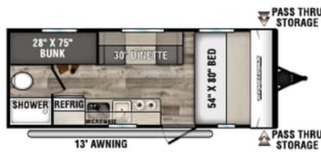
180BH UVW - 2,690 | Exterior Length - 21' 5" | Sleeps - 4