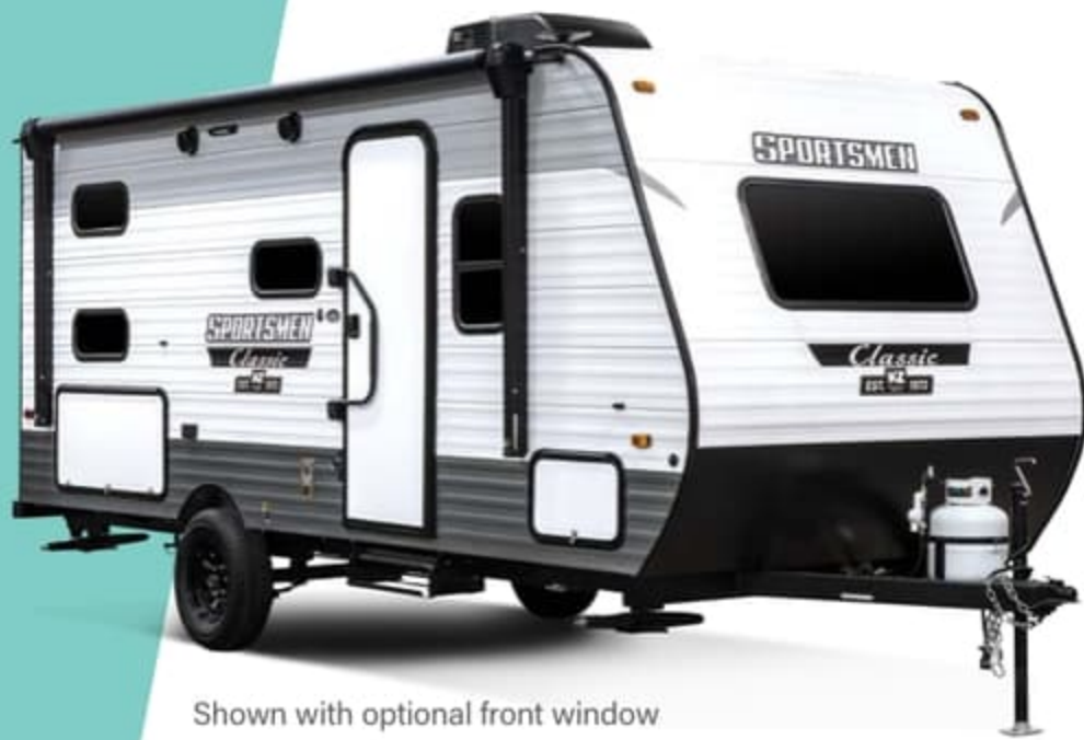
Shown with optional front window

Sportsmen Classic is true to its name. It has been a customer favorite for decades, and there is no question as to why. Sportsmen Classic offers standard features fit to equip you and your family to explore the great outdoors together!