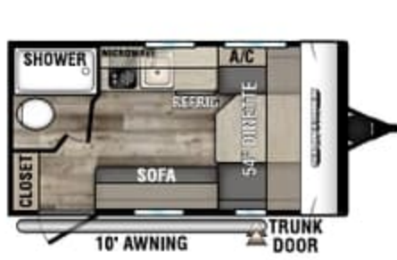
130RB UVW - 2,240 | Exterior Length - 16' 9" | Sleeps - 2

NOTE: Options and packages can be found on the website