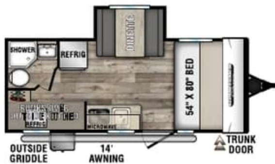
191BHK UVW - 3,420 | Exterior Length - 22' 1" | Sleeps - 5