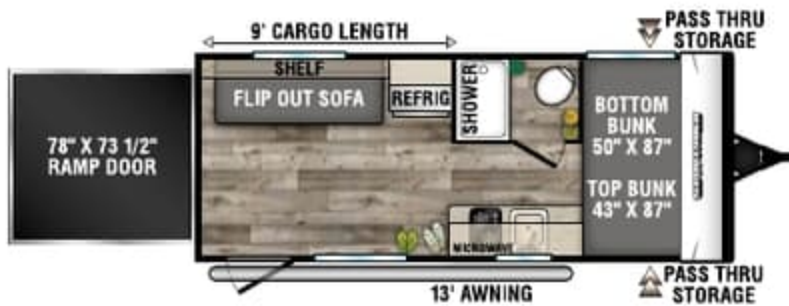
180TH TOY HAULER UVW - 3,260 | Exterior Length - 21' 8" | Sleeps - 4