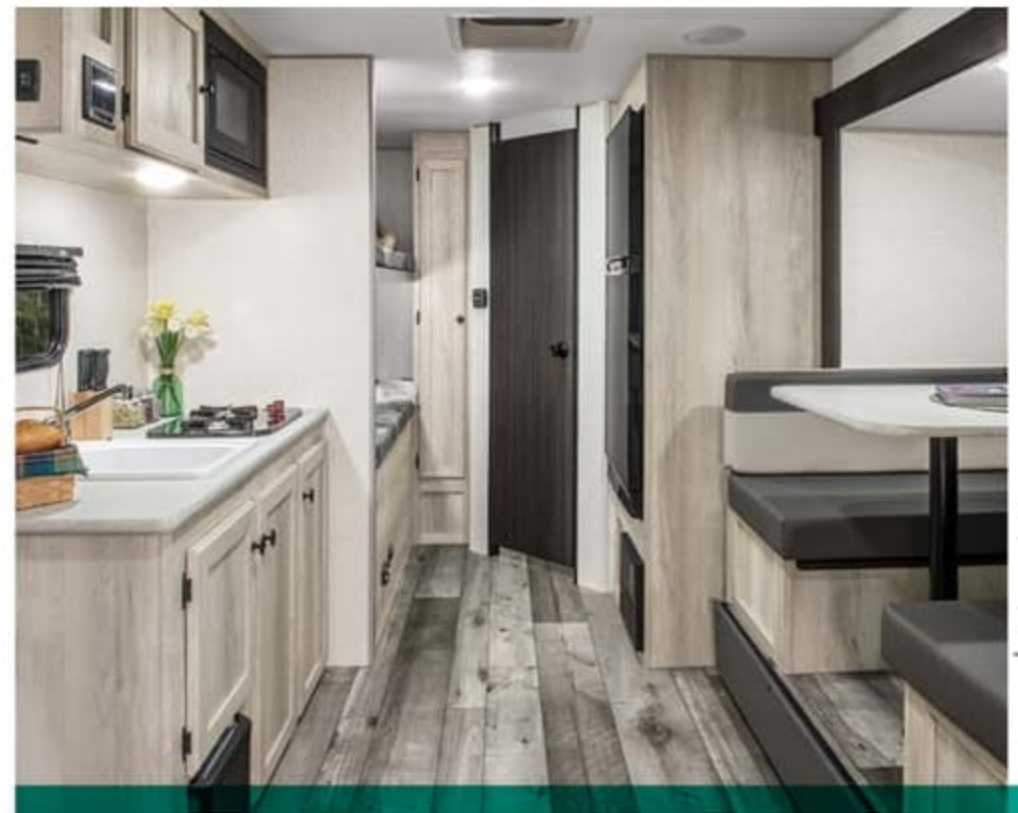
191BHK | Ashwood décor

Sportsmen Classic is true to its name. It has been a customer favorite for decades, and there is no question as to why. Sportsmen Classic offers standard features fit to equip you and your family to explore the great outdoors together!