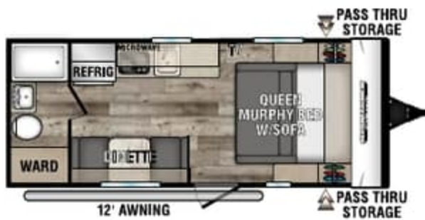
170MB UVW - 2,870 | Exterior Length - 22' | Sleeps - 3