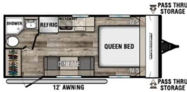
160QB UVW - 2,900 | Exterior Length - 22' | Sleeps - 3