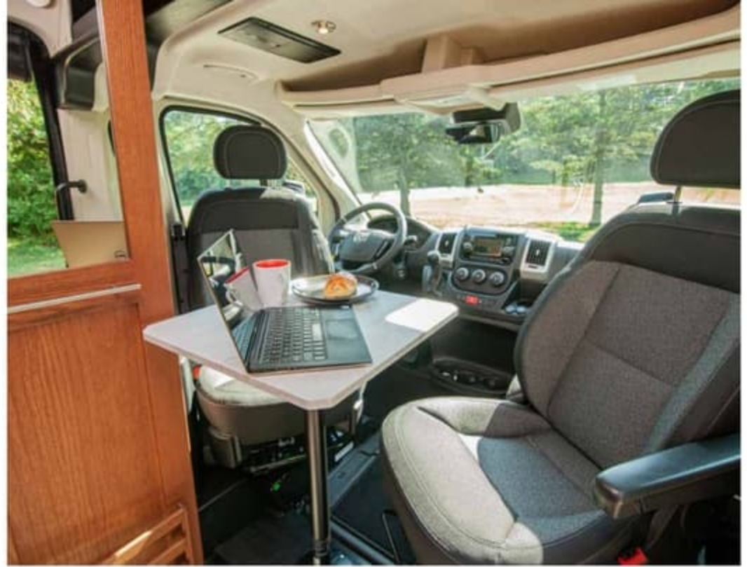
Spacious front dining area comfortably seats two.