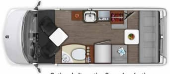
Optional alternative floor plan daytime