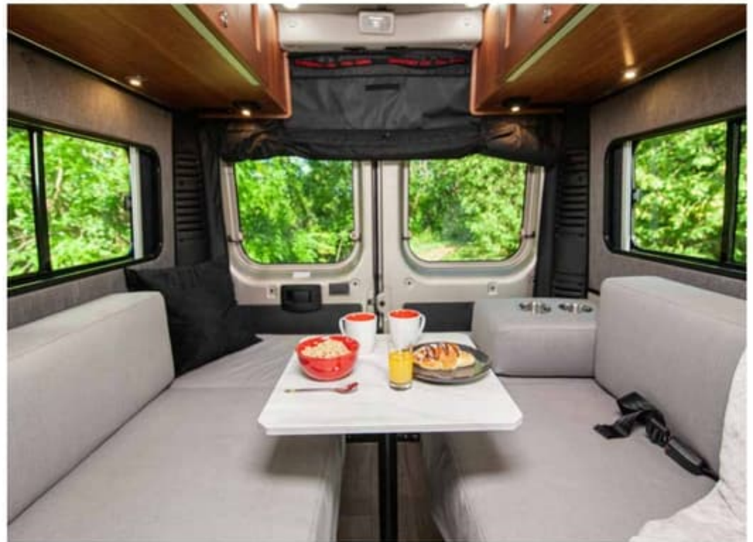
Rear lounge and twin bed area offers a great place to relax, work or dine and easily transforms into a king sized bed.