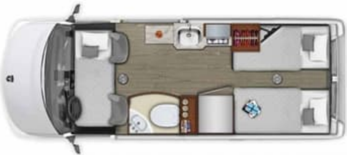
Interior floorplan evening with twin bed set up. (Shown with optional front folding mattress.)