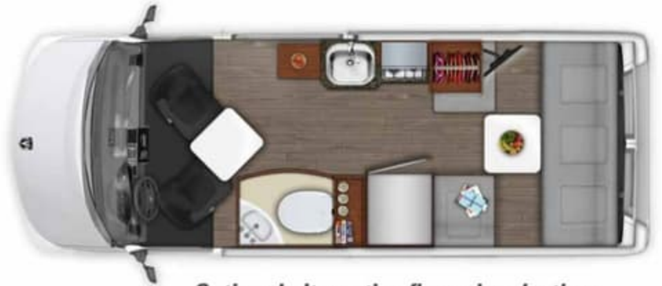
Optional alternative floor plan daytime