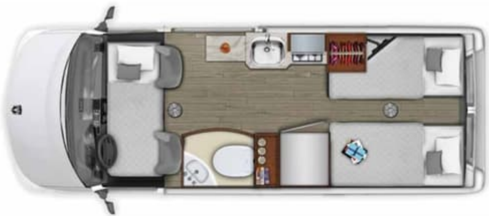
Interior floorplan evening with twin bed set up. (Shown with optional front folding mattress.)