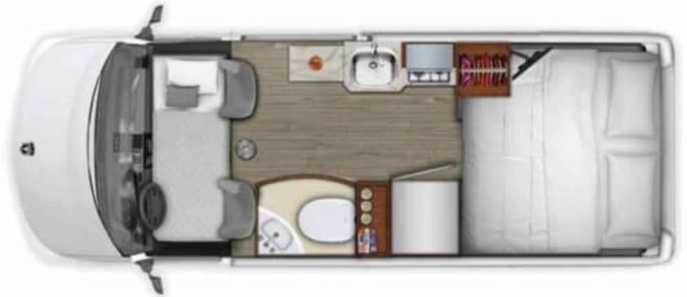
Interior floorplan evening with king bed set up. (Shown with optional front folding mattress.)