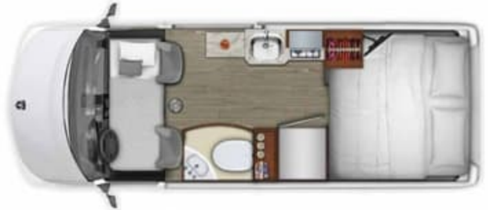
Interior floorplan evening with king bed set up. (Shown with optional front folding mattress.)