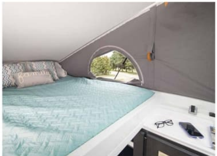
Pop top area provides a large comfortable bed, three windows and a convenient storage tray with charging ports.