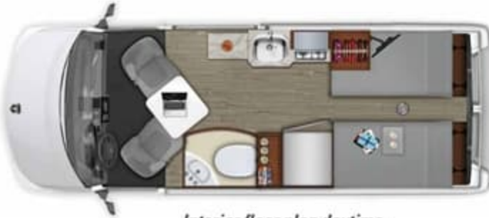
Interior floor plan daytime.