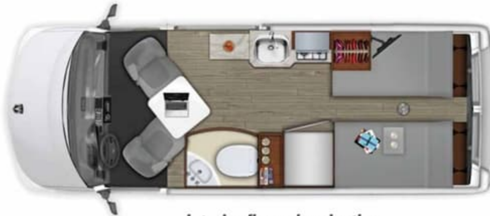
Interior floor plan daytime.