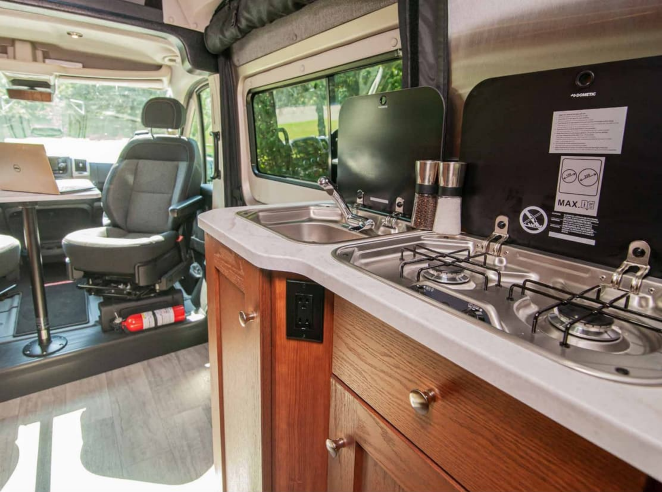
Kitchen galley includes a 5.0 cu.ft refrigerator, microwave oven, two burner propane stove, stainless steel sink and flip up counter extension.