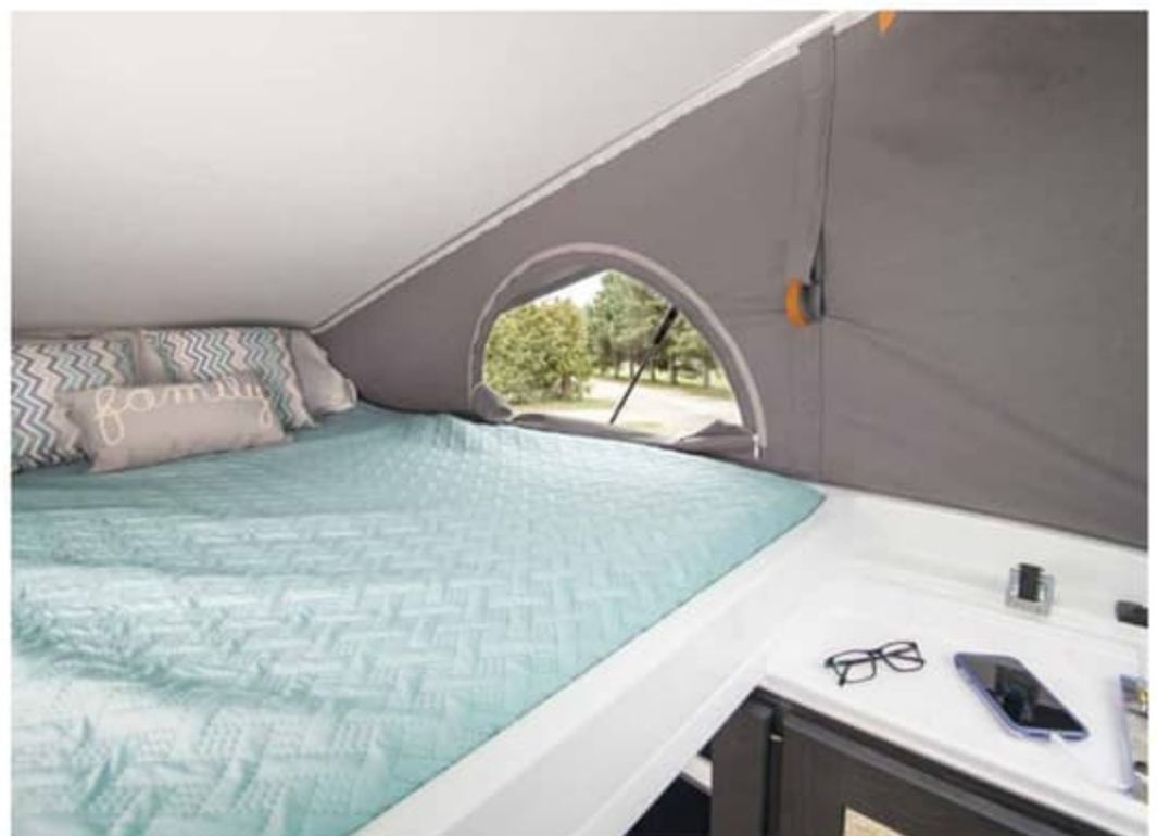
Pop top area provides a large comfortable bed, three windows and a convenient storage tray with charging ports.