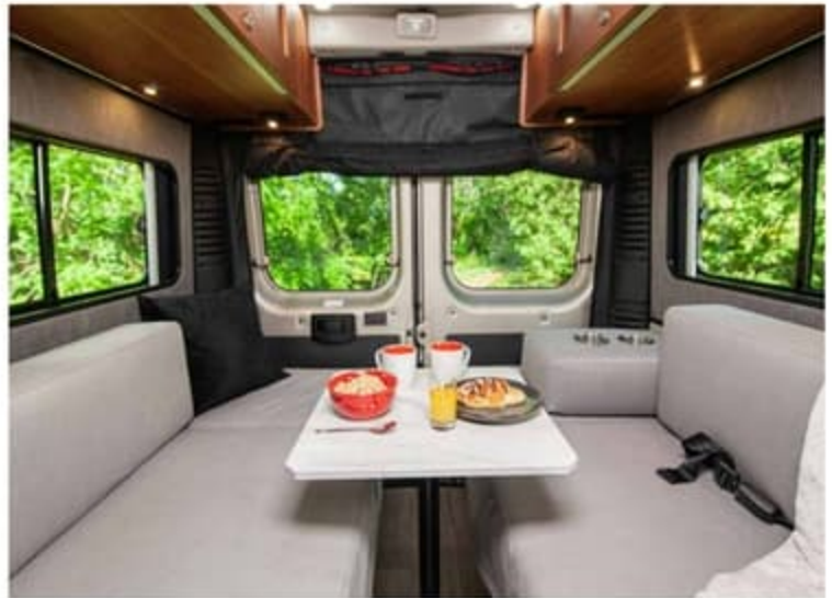
Rear lounge and twin bed area offers a great place to relax, work or dine and easily transforms into a king sized bed.