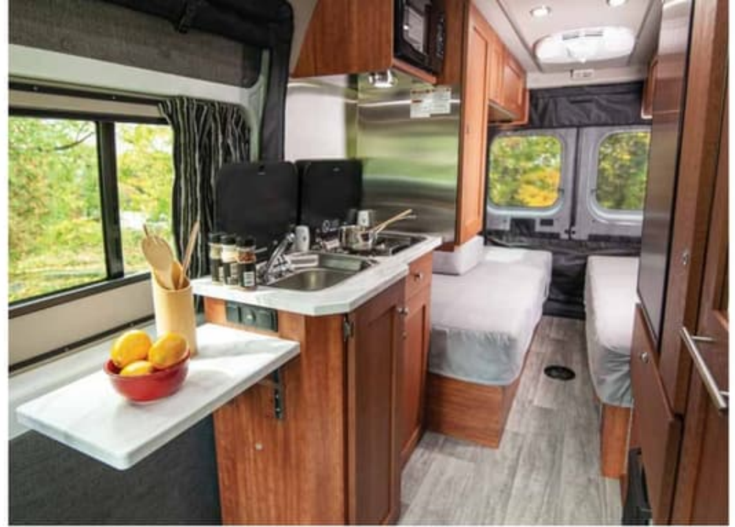
Kitchen galley includes a 5.0 cu.ft. refrigerator, microwave oven, two-burner propane stove, stainless steel sink and flip up counter extension.