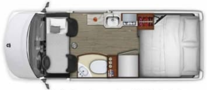
Interior floorplan evening with king bed set up. (Shown with optional front folding mattress.)