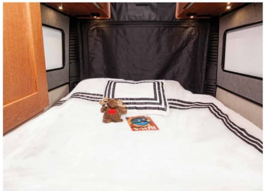
Rear lounge area easily transforms into a sleeping area with a comfortable king size bed.