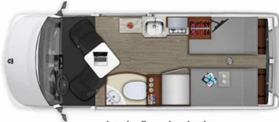
Interior floor plan daytime.