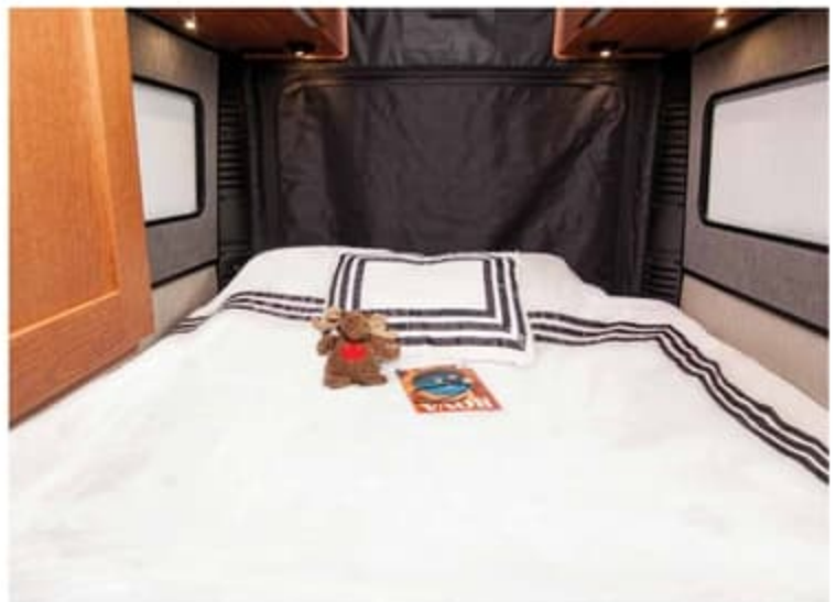
Rear lounge area easily transforms into a sleeping area with a comfortable king size bed.