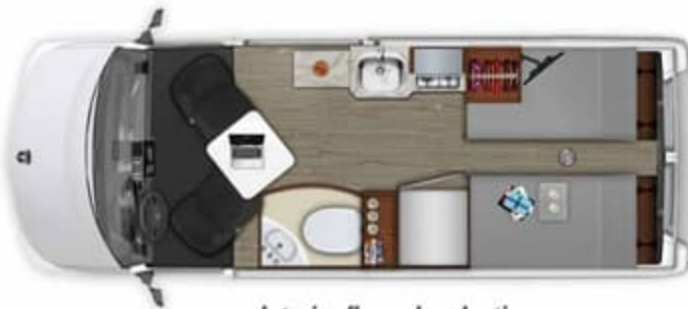
Interior floor plan daytime.