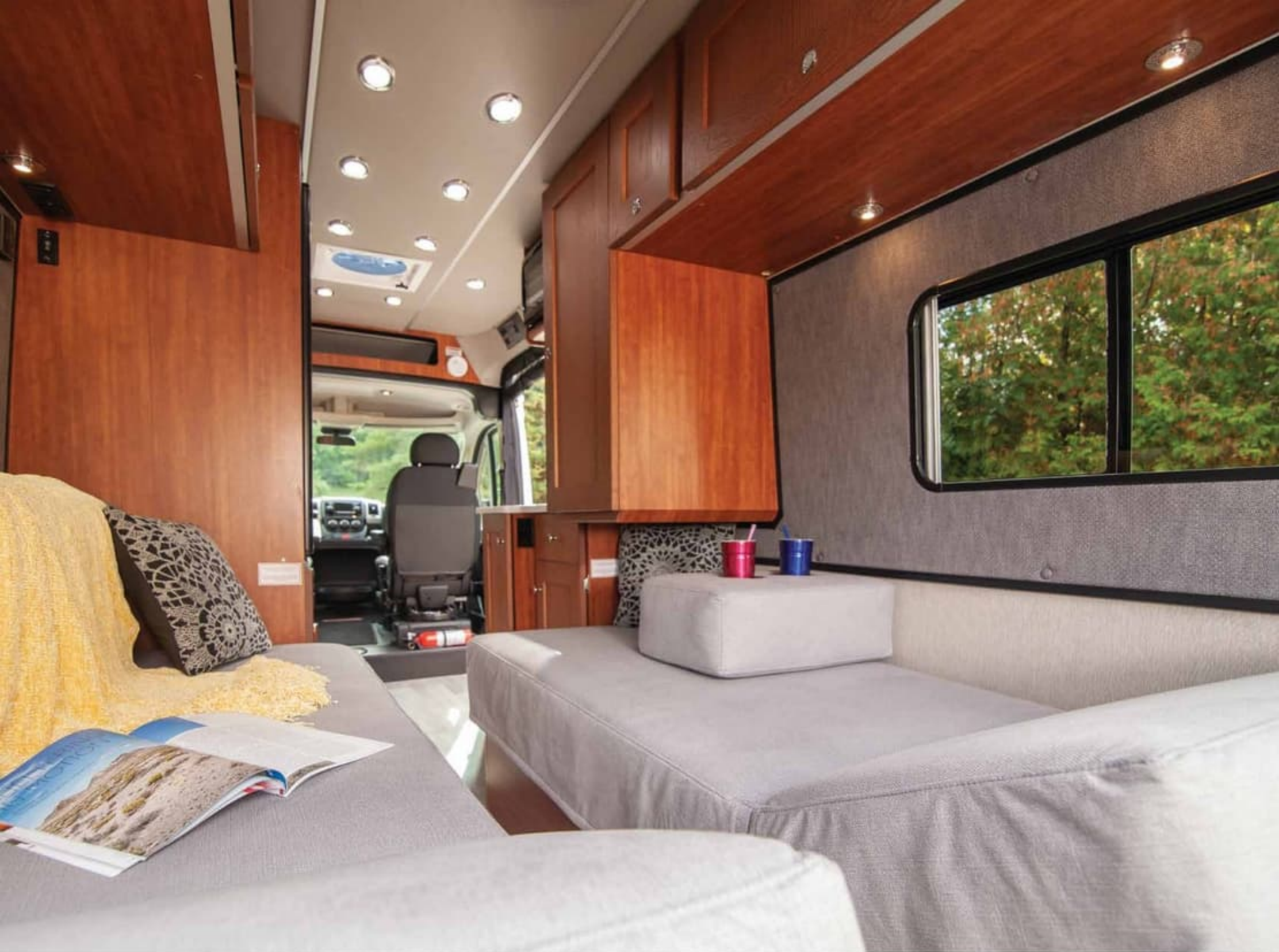
Open aisle floor plan allows for flexibility in sleeping accommodations and storage of large items.