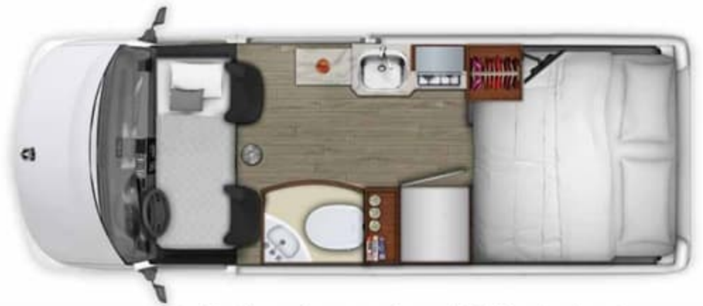
Interior floorplan evening with king bed set up. (Shown with optional front folding mattress.)