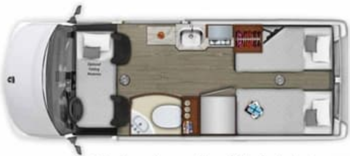
Interior floorplan evening with twin bed set up. (Shown with optional front folding mattress.)