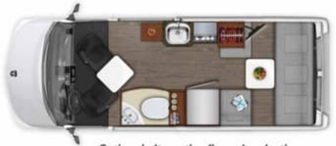
Optional alternative floor plan daytime