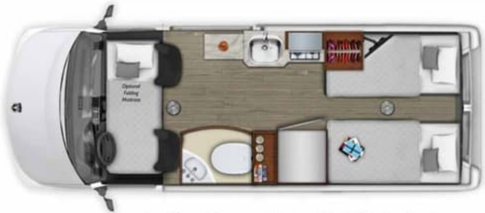
Interior floorplan evening with twin bed set up. (Shown with optional front folding mattress.)