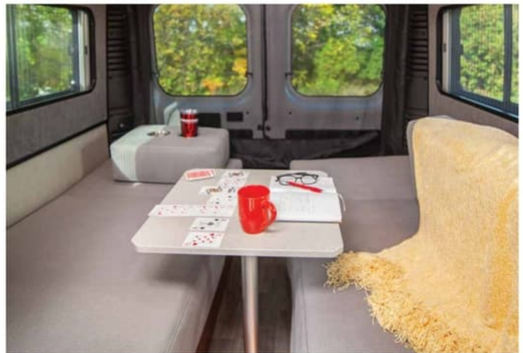
Rear lounge and twin bed area offers a great place to relax, work or dine.