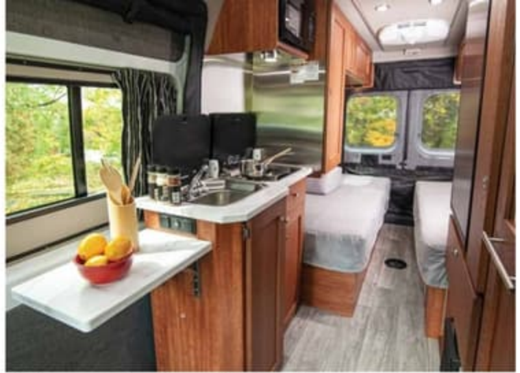
Kitchen galley includes a 5.0 cu.ft. refrigerator, microwave oven, two-burner propane stove, stainless steel sink and flip up counter extension.