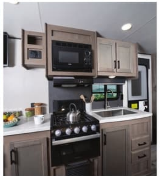
2022 Autumn Ridge 20FBS