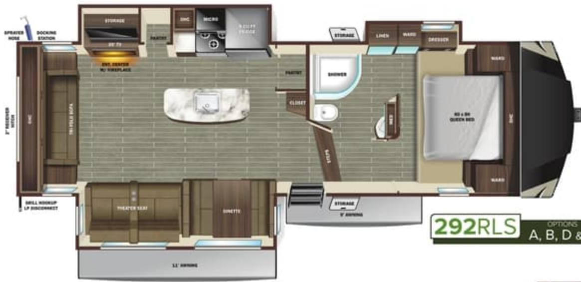
292RLS OPTIONS A, B, D & G