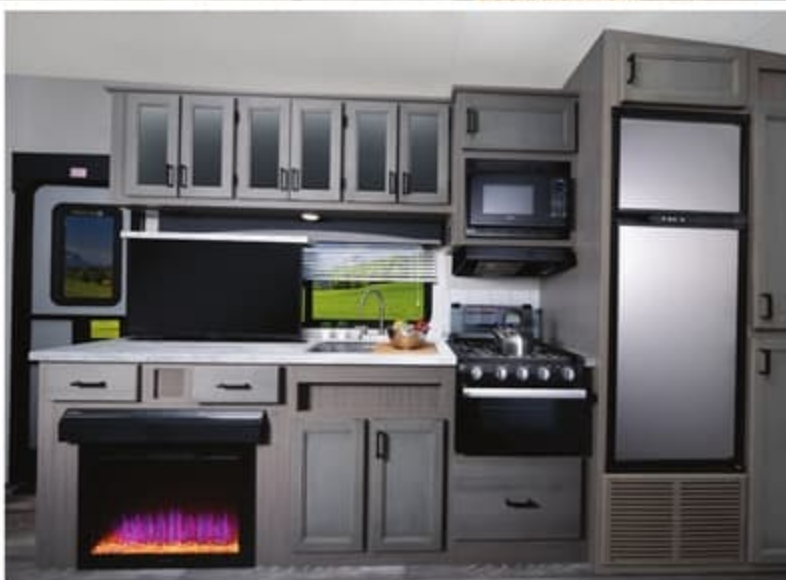
2022 Telluride 297BHS