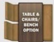
TABLE & CHAIRS/BENCH OPTION