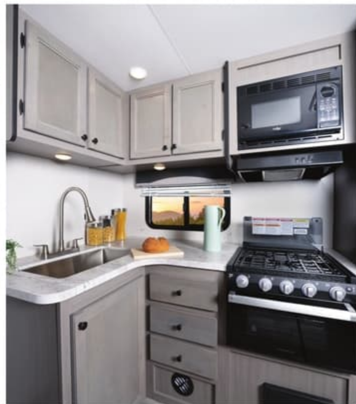
2022 Super Lite 241BH