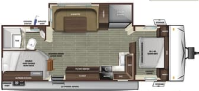
241BH OPTIONS B & C