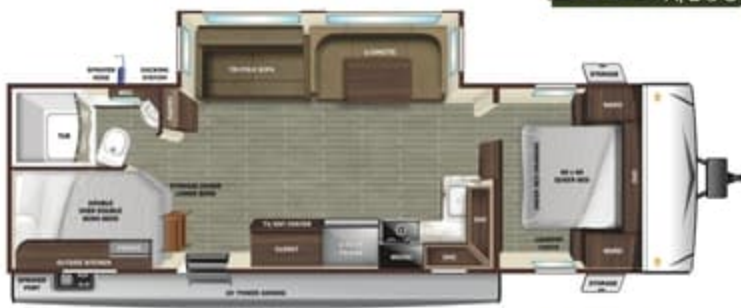
281BH OPTIONS A, B & C