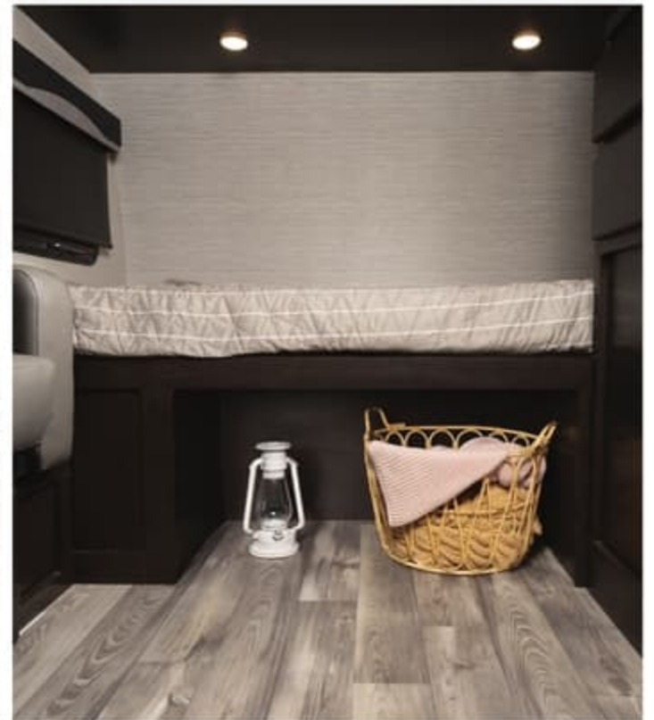
2022 Super Lite Maxx 16FBS