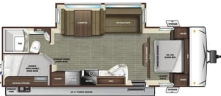
261BH OPTIONS A, B & C