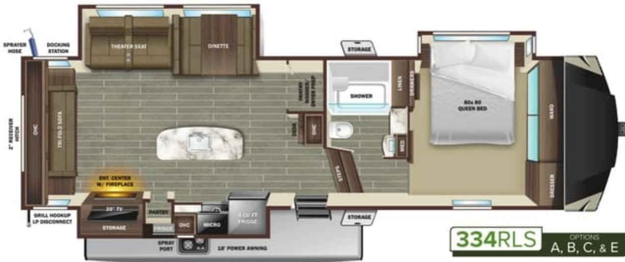
334RLS OPTIONS A, B, C, & E