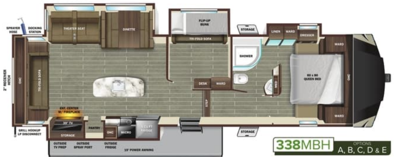
338MBH OPTIONS A, B, C, D & E