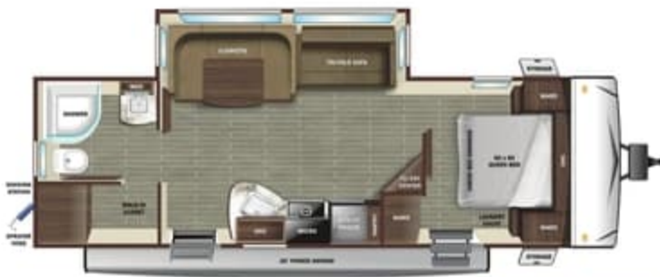
252RB OPTIONS A, B & C