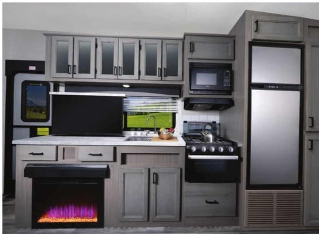
2022 Telluride 297BHS