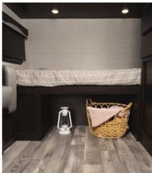
2022 Super Lite Maxx 16FBS