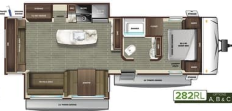
282RL OPTIONS A, B & C