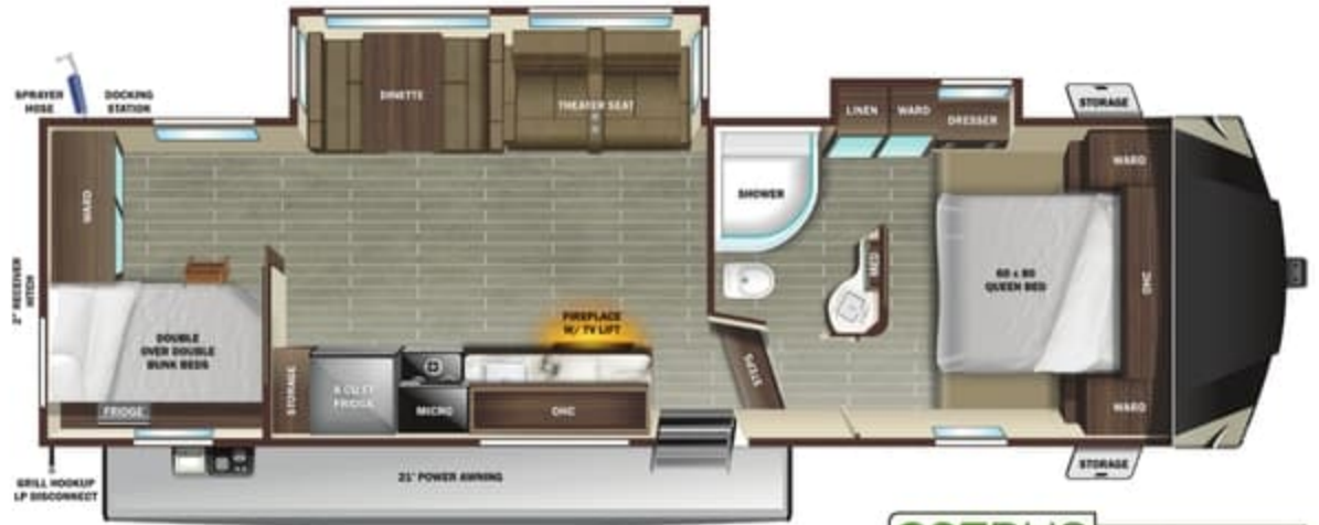
297BHS OPTIONS A, B, C, D & E