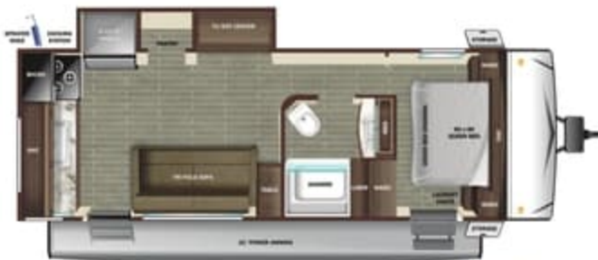
232MD OPTION A