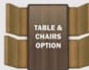
TABLE & CHAIRS OPTION