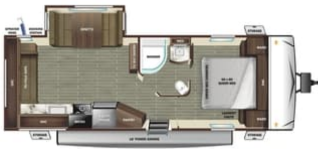
242RL OPTIONS A, B & C