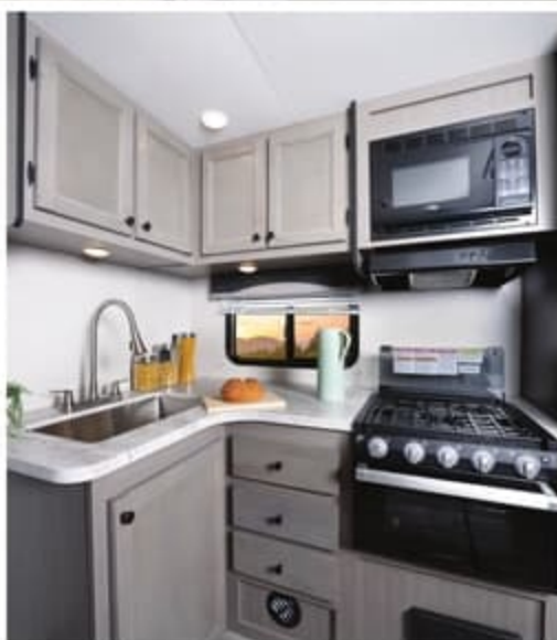
2022 Super Lite 241BH