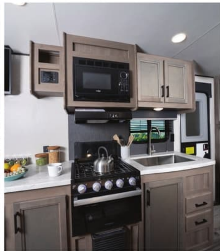
2022 Autumn Ridge 20FBS