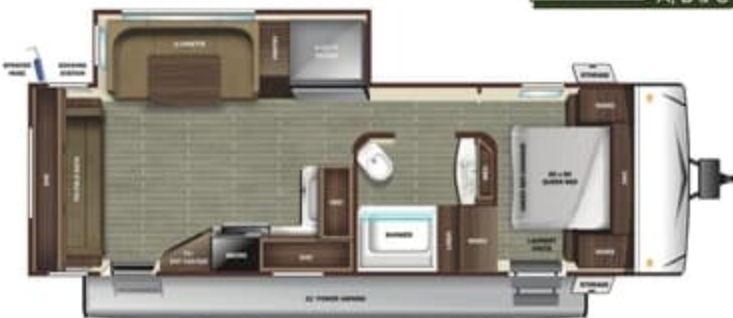
262RL OPTIONS A, B & C