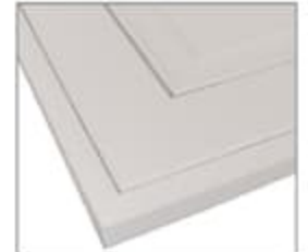
RUSHMORE PAINTED CABINETRY