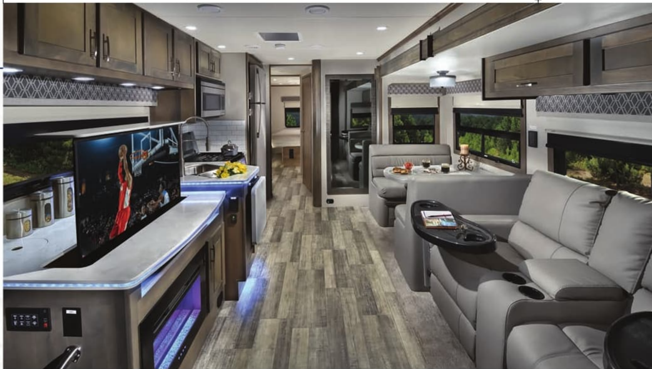
Force 37TS with Driftwood cabinetry and Carbon décor, is shown with these options: power theater seats, entertainment center with 50" LED TV and fireplace.