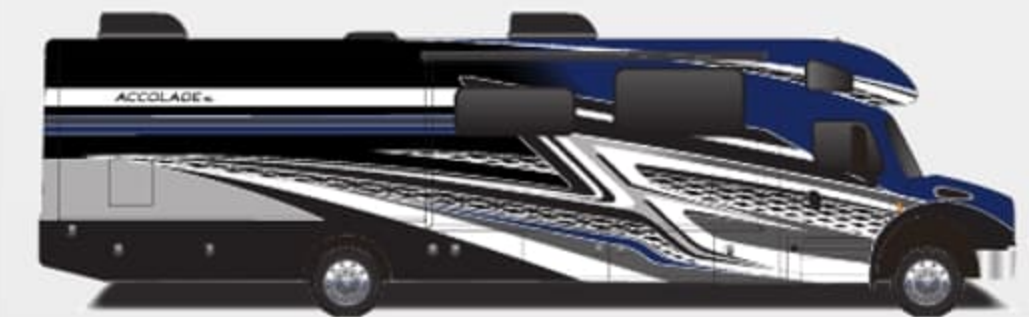
Blue Lightning Paint