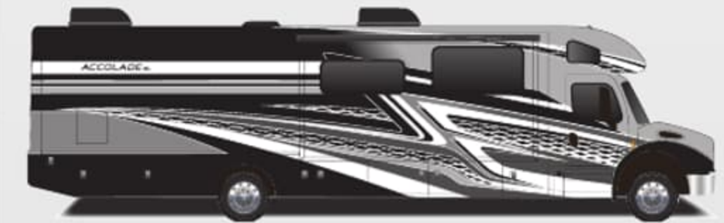
Grey Lightning Paint