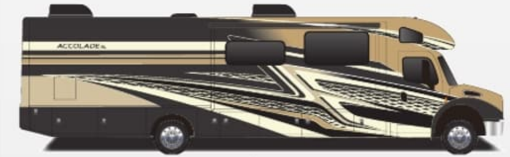
Beige Lightning Paint