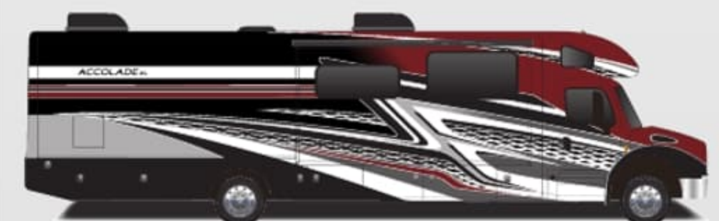
Red Lightning Paint