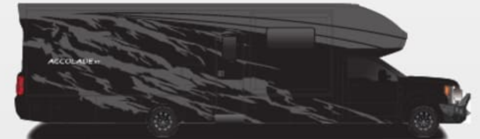
Desert Dune Full-Body Paint