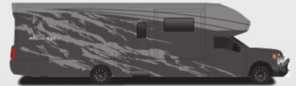
Parched Earth Full-Body Paint