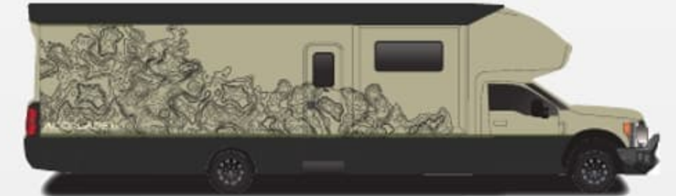
Backwoods: Desertscape Full-Body Paint