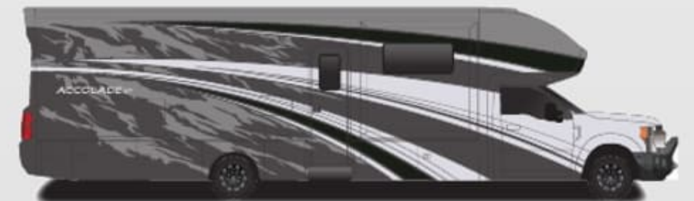
Alpine Byrum Full-Body Paint