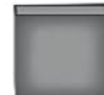
15 cu. ft. Fridge Option