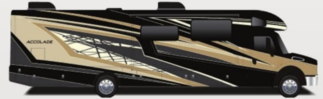
Cobblestone Full-Body Paint