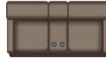
Theater Sofa Option