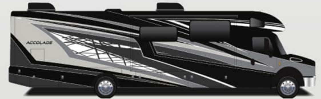
Moonlight Full-Body Paint