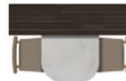
Freestanding Dinette Option