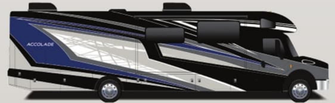
Sienna Full-Body Paint