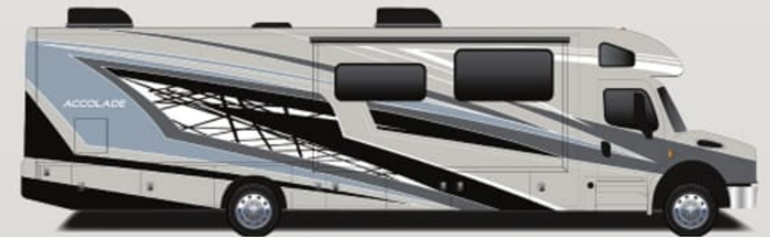
Oceanside Full-Body Paint