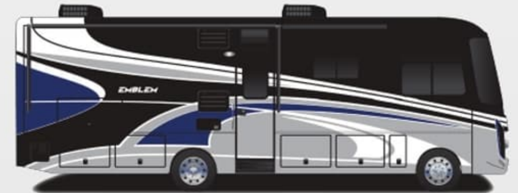
Coastal Full-Body Paint