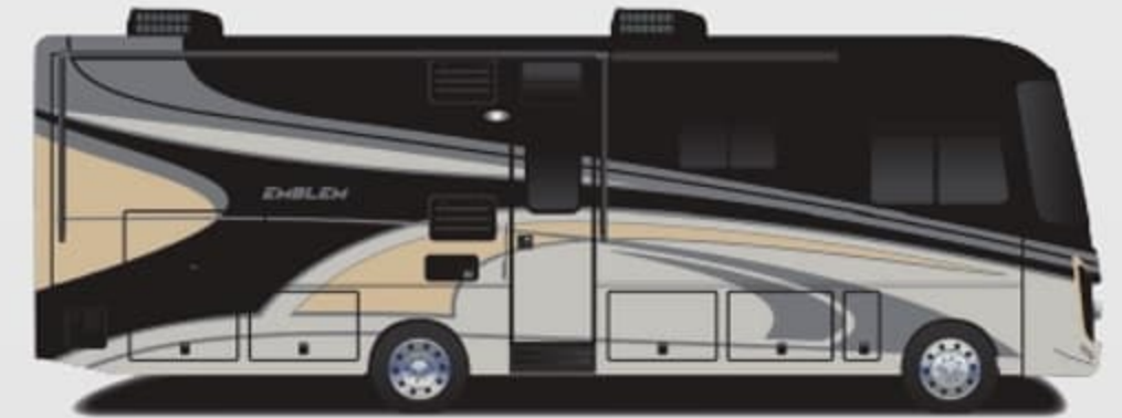
Ozark Full-Body Paint