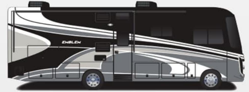
Appalachia Full-Body Paint