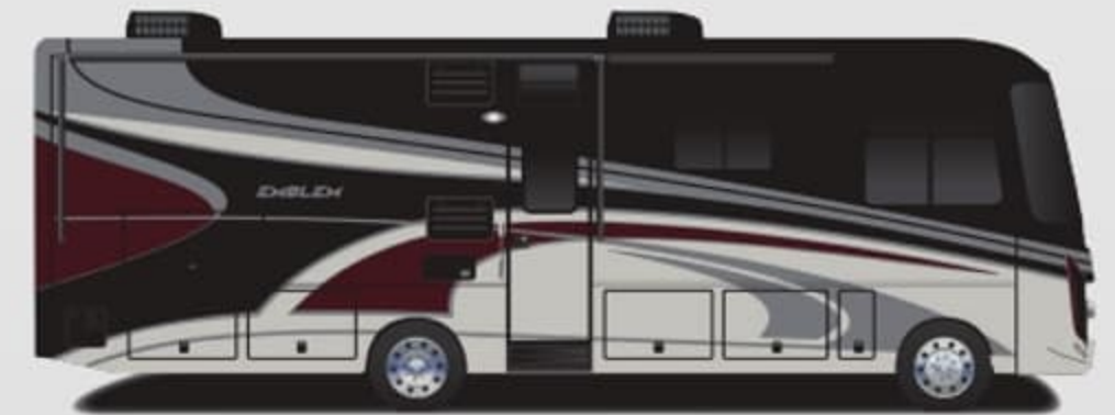
Plains Full-Body Paint