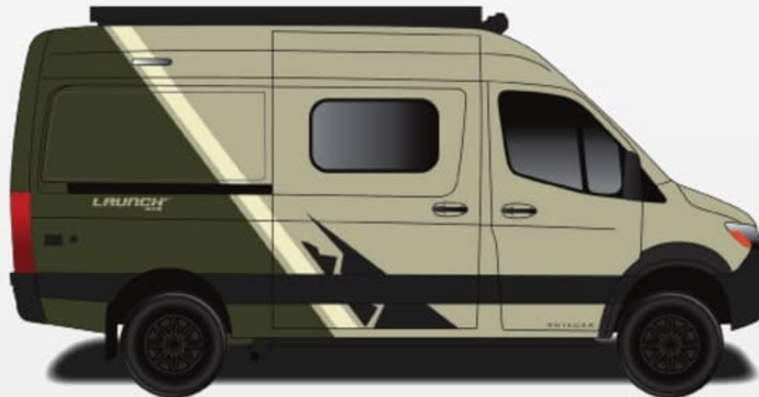
Forest Glade Partial Paint (Sandstone Van Only)