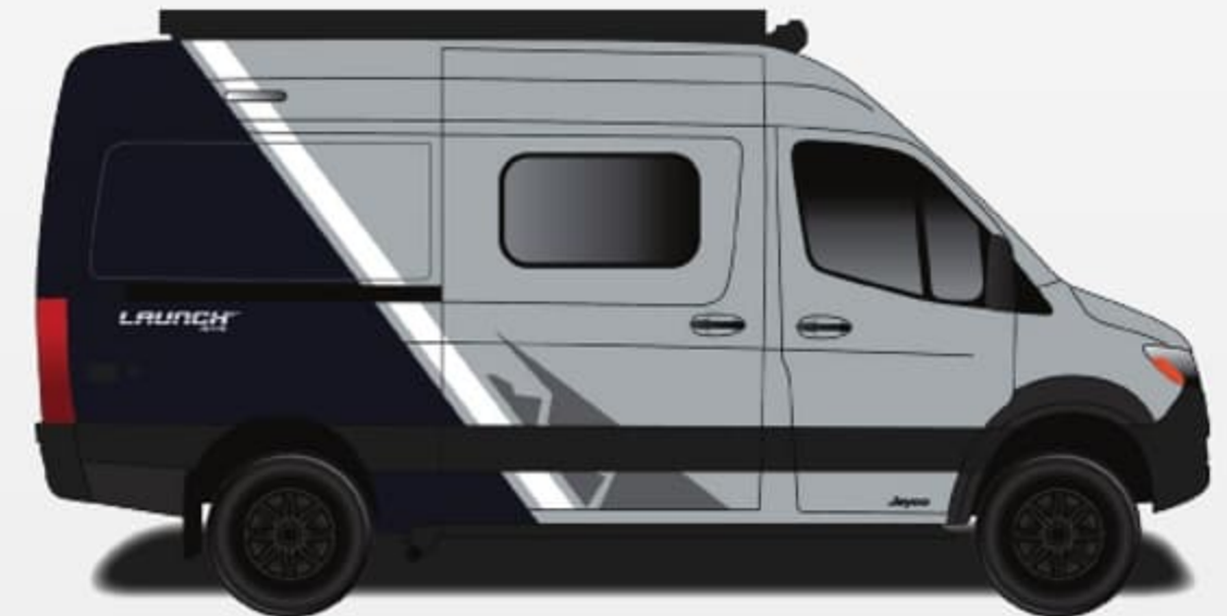
Mystic Tide Partial Paint (Blue-Grey Van Only)