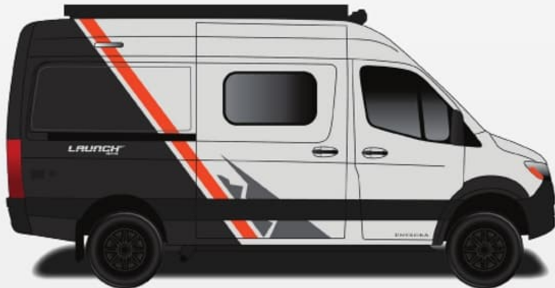
Aztec Partial Paint (Silver Van Only)