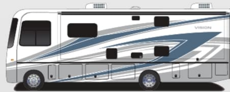
Basanite Full-Body Paint