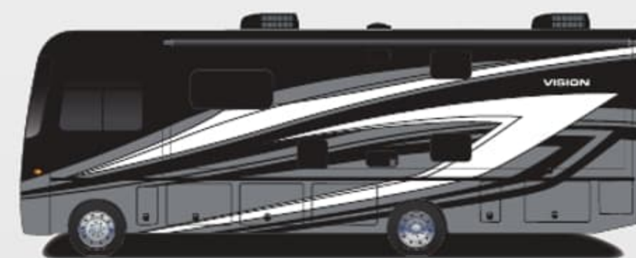
Tannerite Full-Body Paint