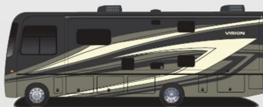
Dolomite Full-Body Paint